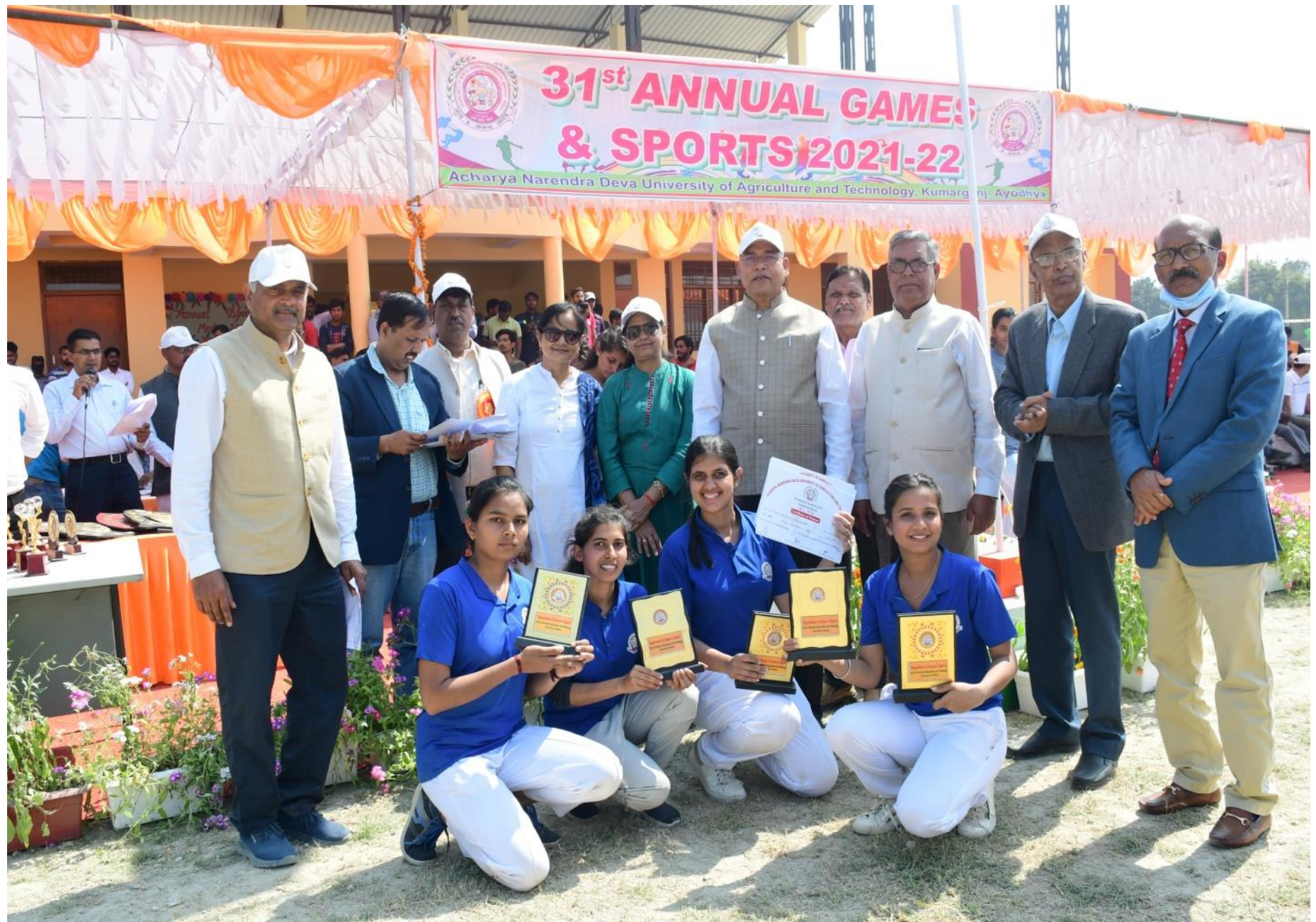
Kabaddi Winners (Blue House) on 06March, 2022