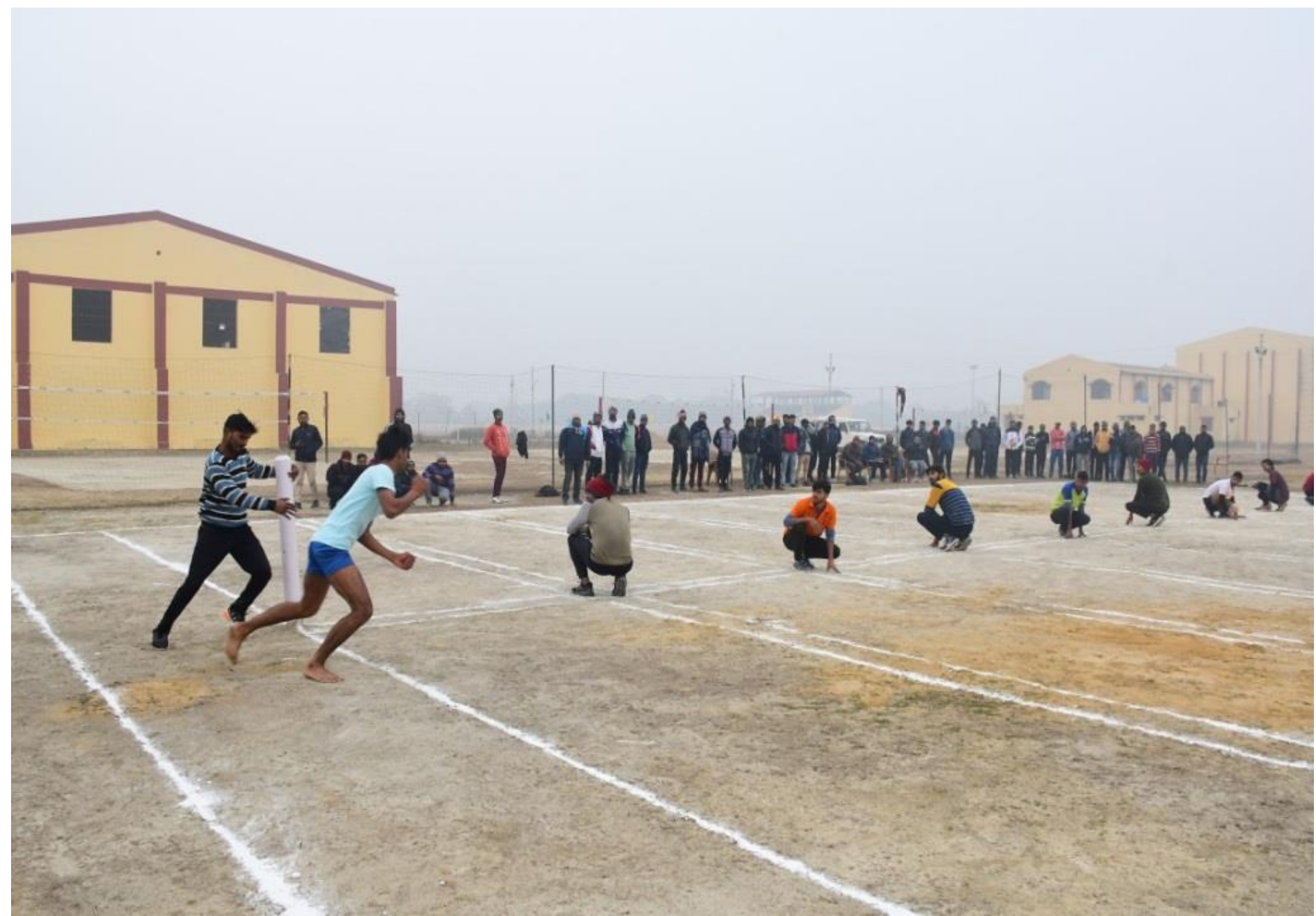
Kho –Kho match (boys) on 09 January, 2020