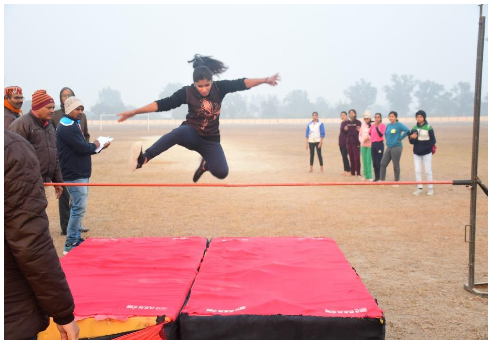
High jump (girls) on 10 January, 2020