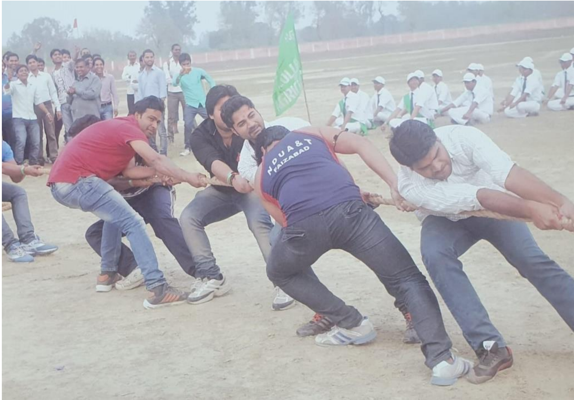
Tug off War (boys) on 08 March, 2018