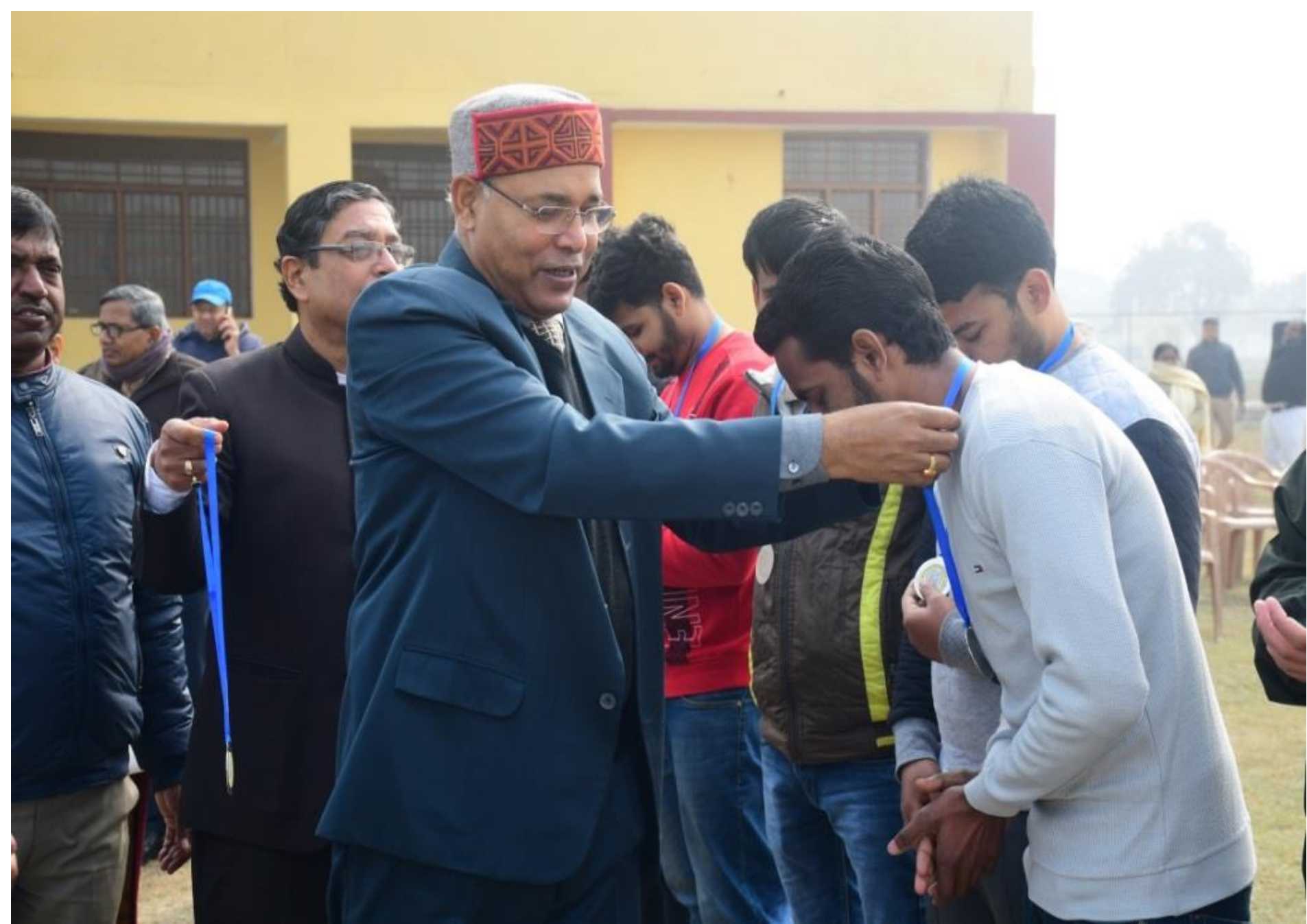
Medal distributions by Hon'ble Vice- Chancellor on 09 January, 2020