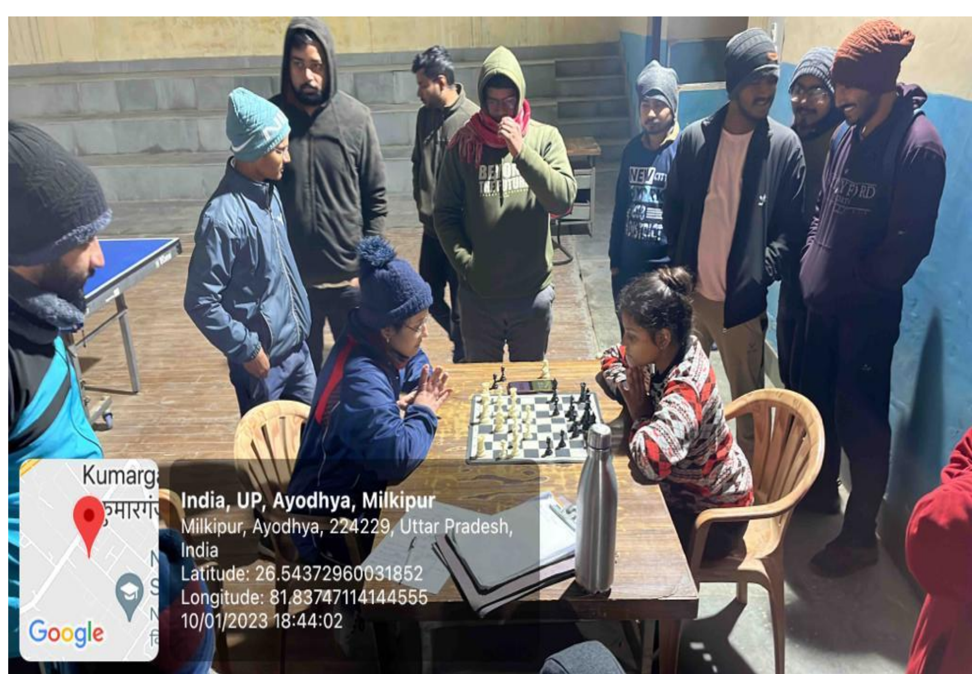
Chess Competition (girls)