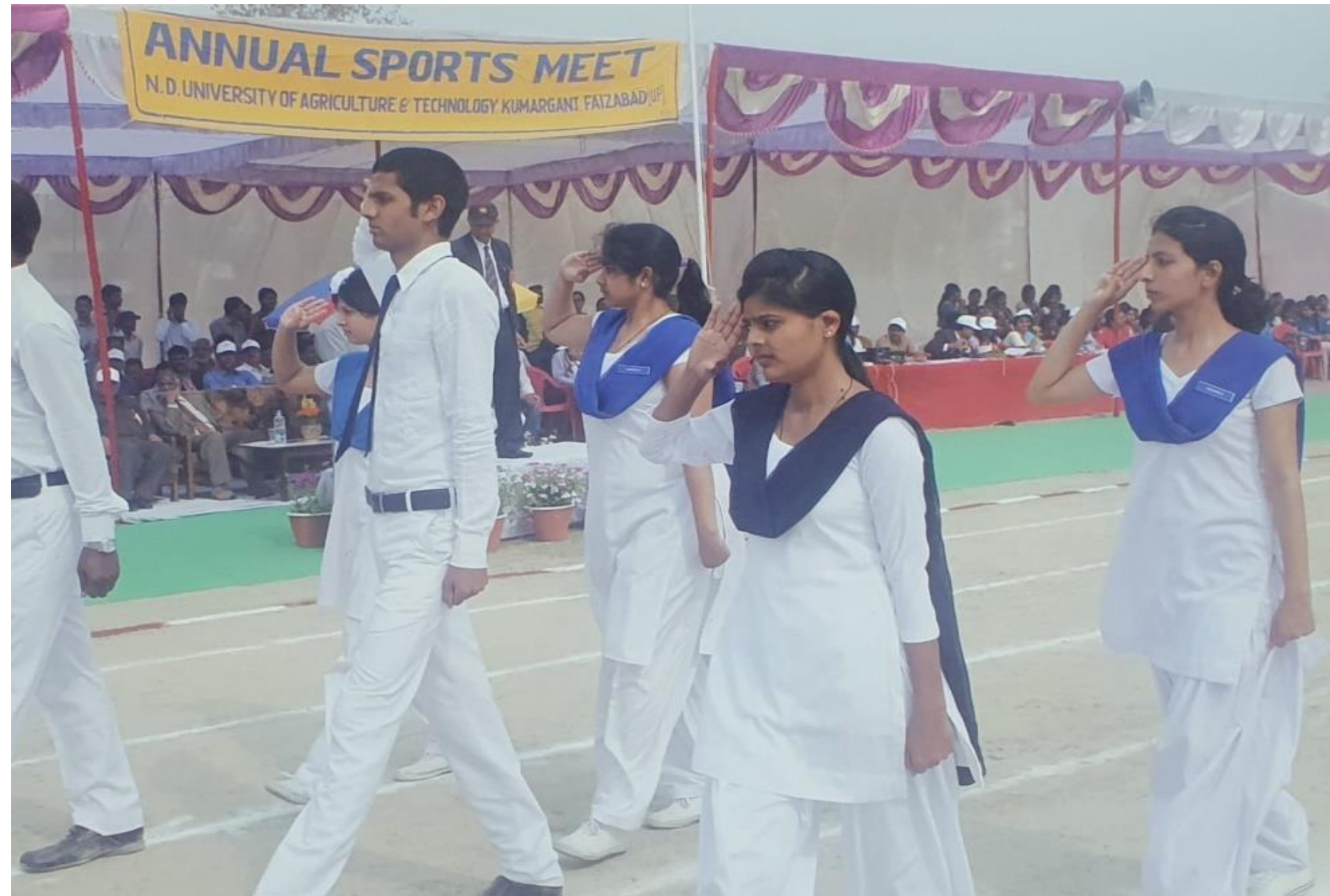
March Past during Annual Sports Meet on 06 th March, 2018