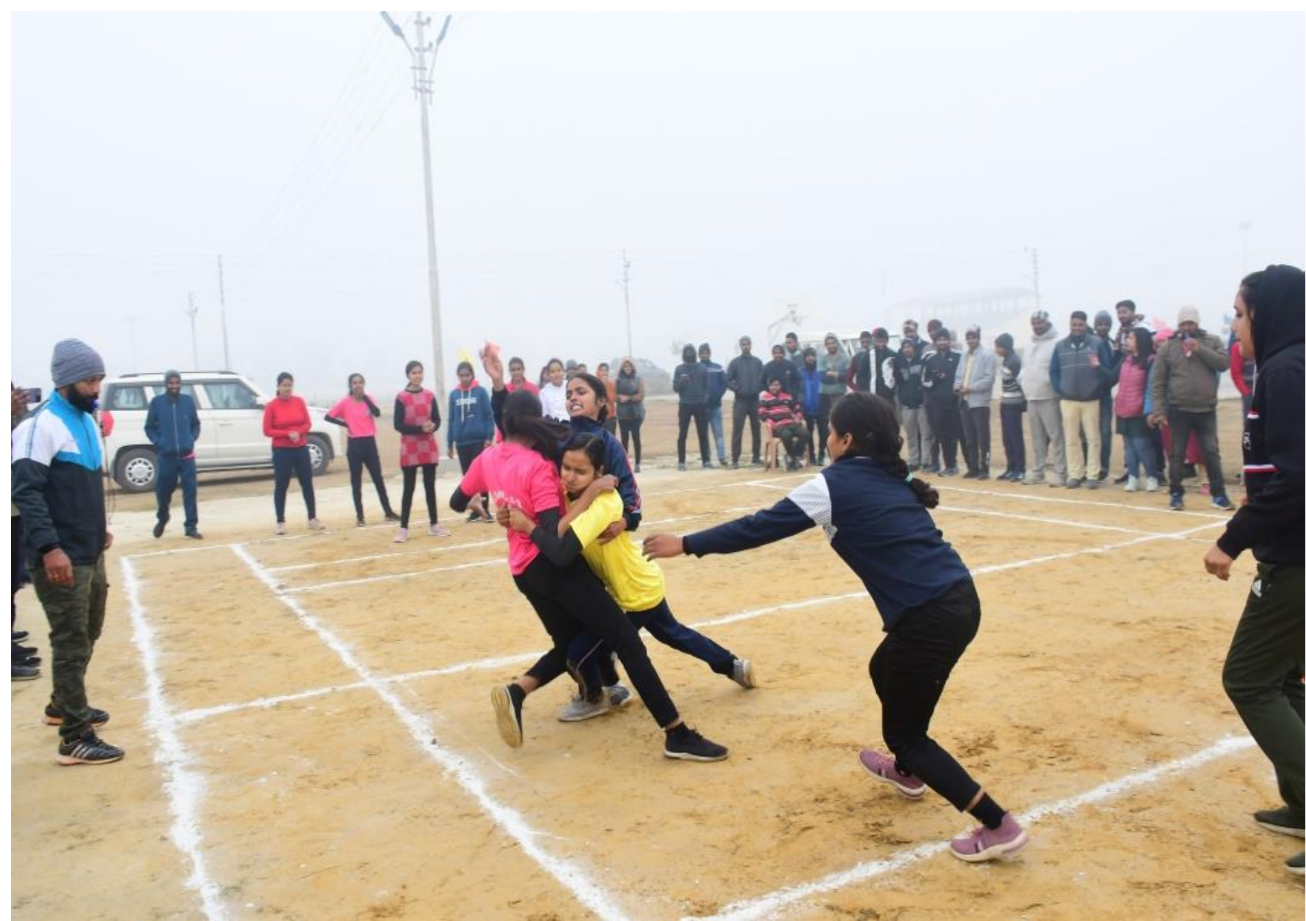
Kabaddi match (girls) during the tournaments on 09 January, 2020