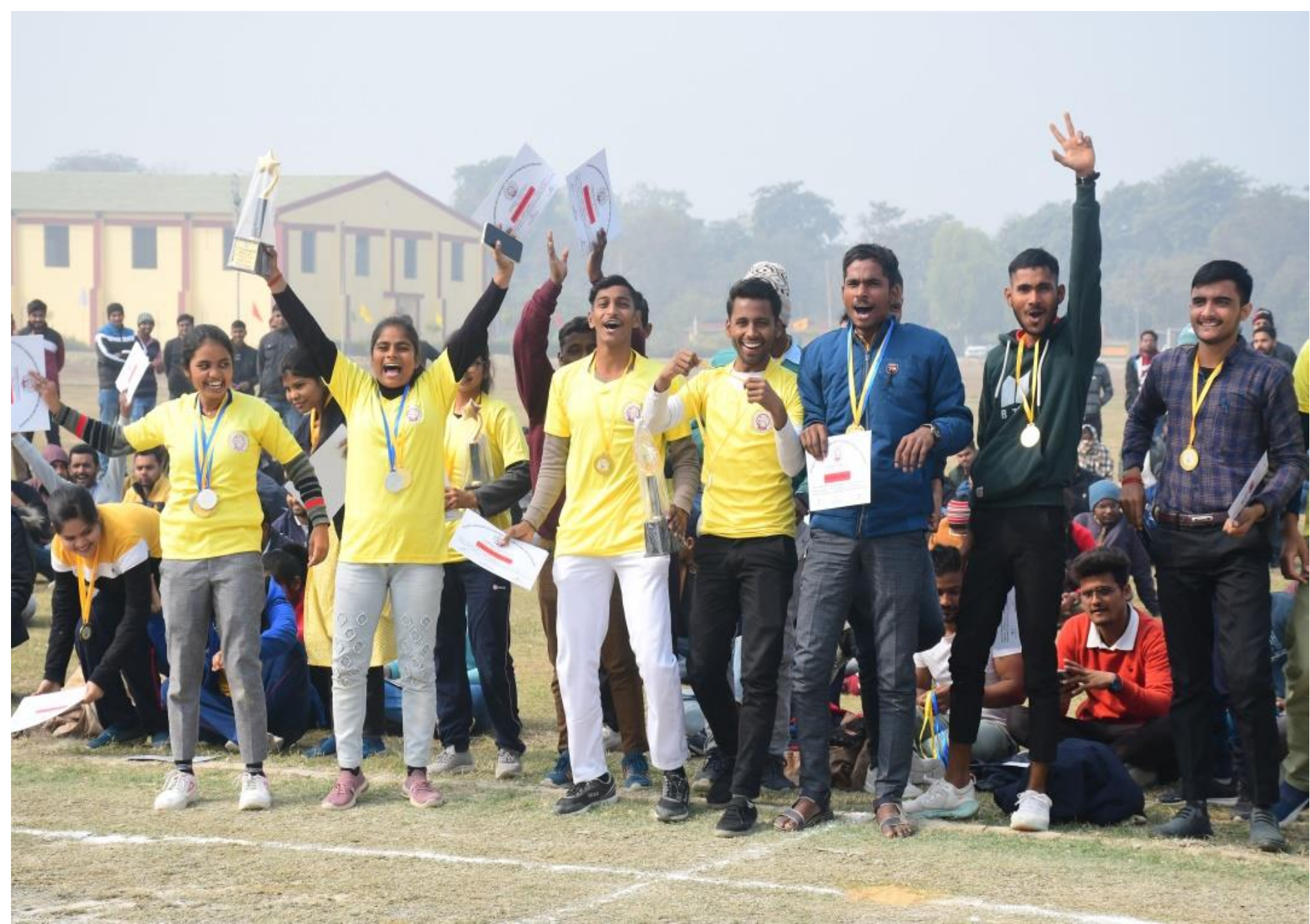
Winners (Girls and Boys) Cheering (2019-20)