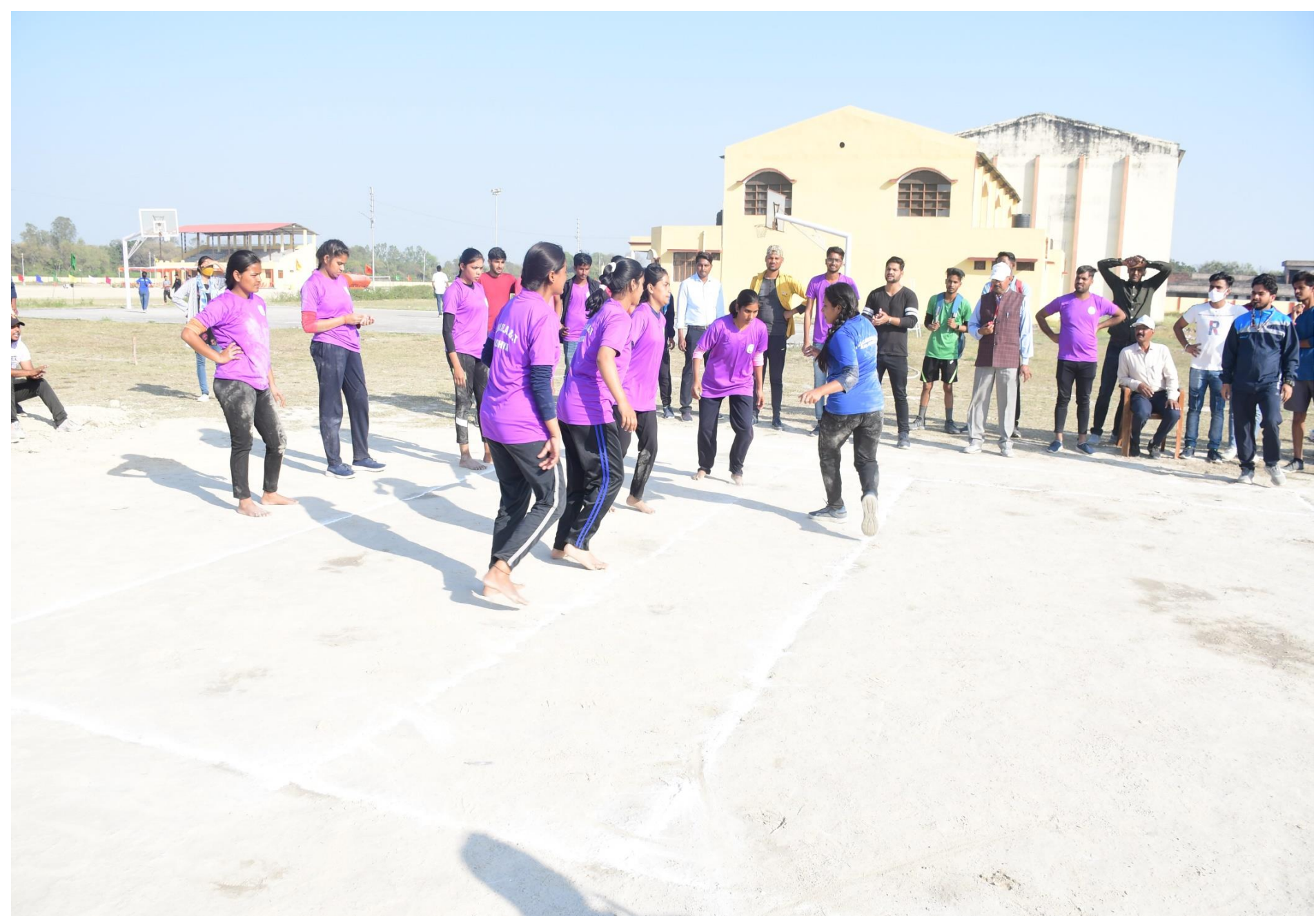
Kabaddi Match (girls) during annual sports meet on 28 February, 2022