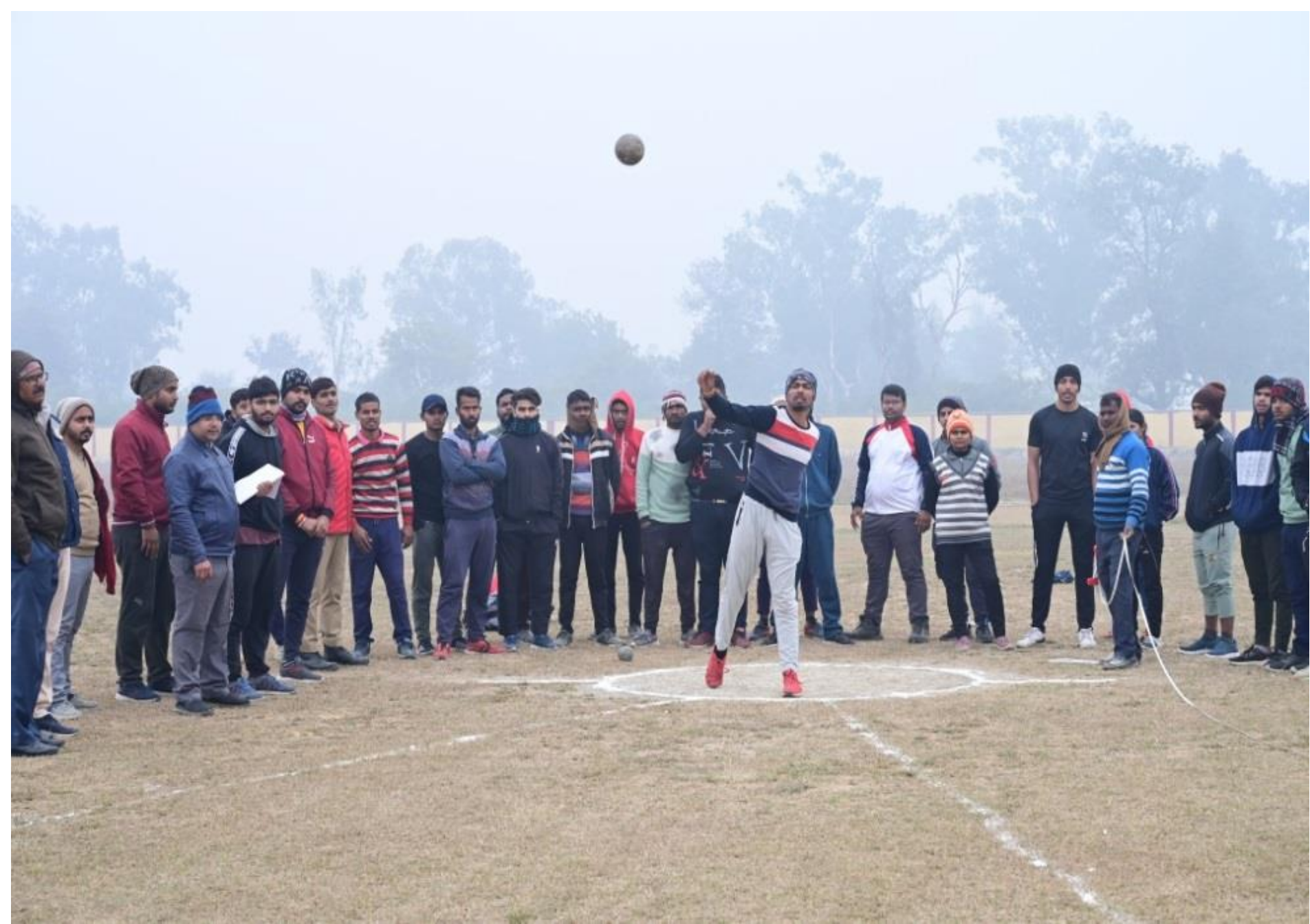
Shot Put throw (boys) on 09 January, 2020