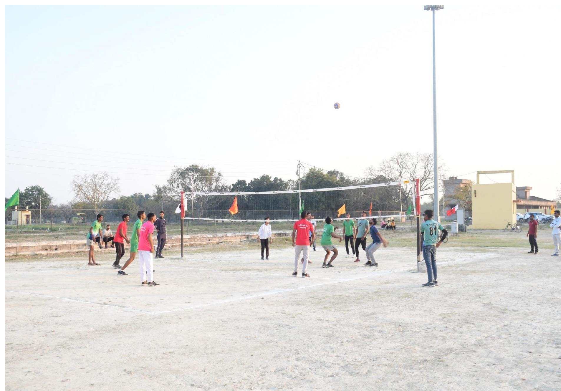
Volley ball Final Match (boys) on 10 January, 2020