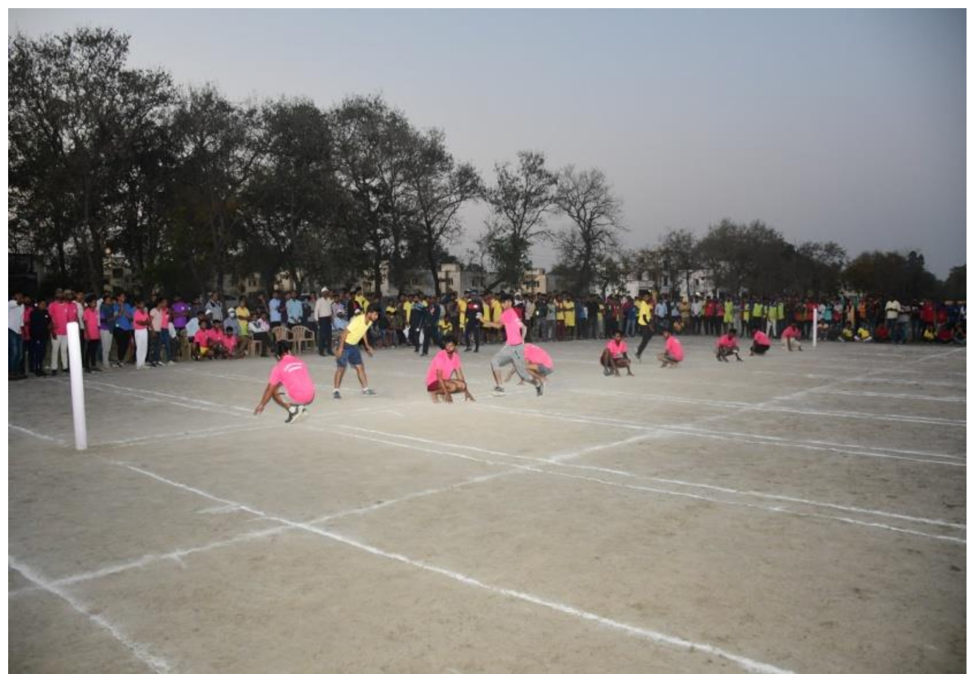
Kho-Kho Match (boys) during annual sports meet on 06 March,2022