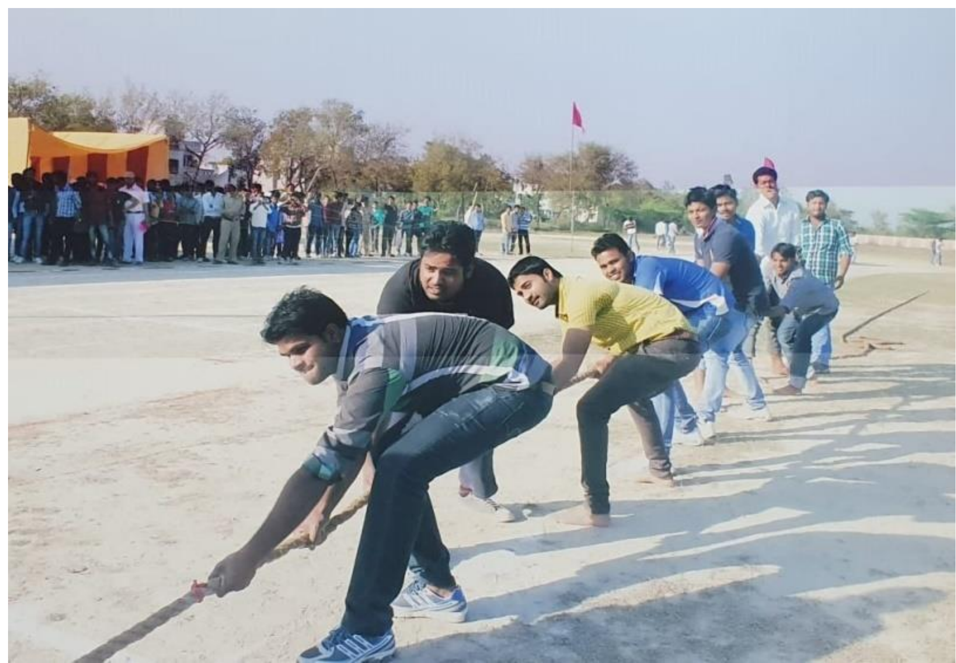
Tug of War on 04 th March, 2019