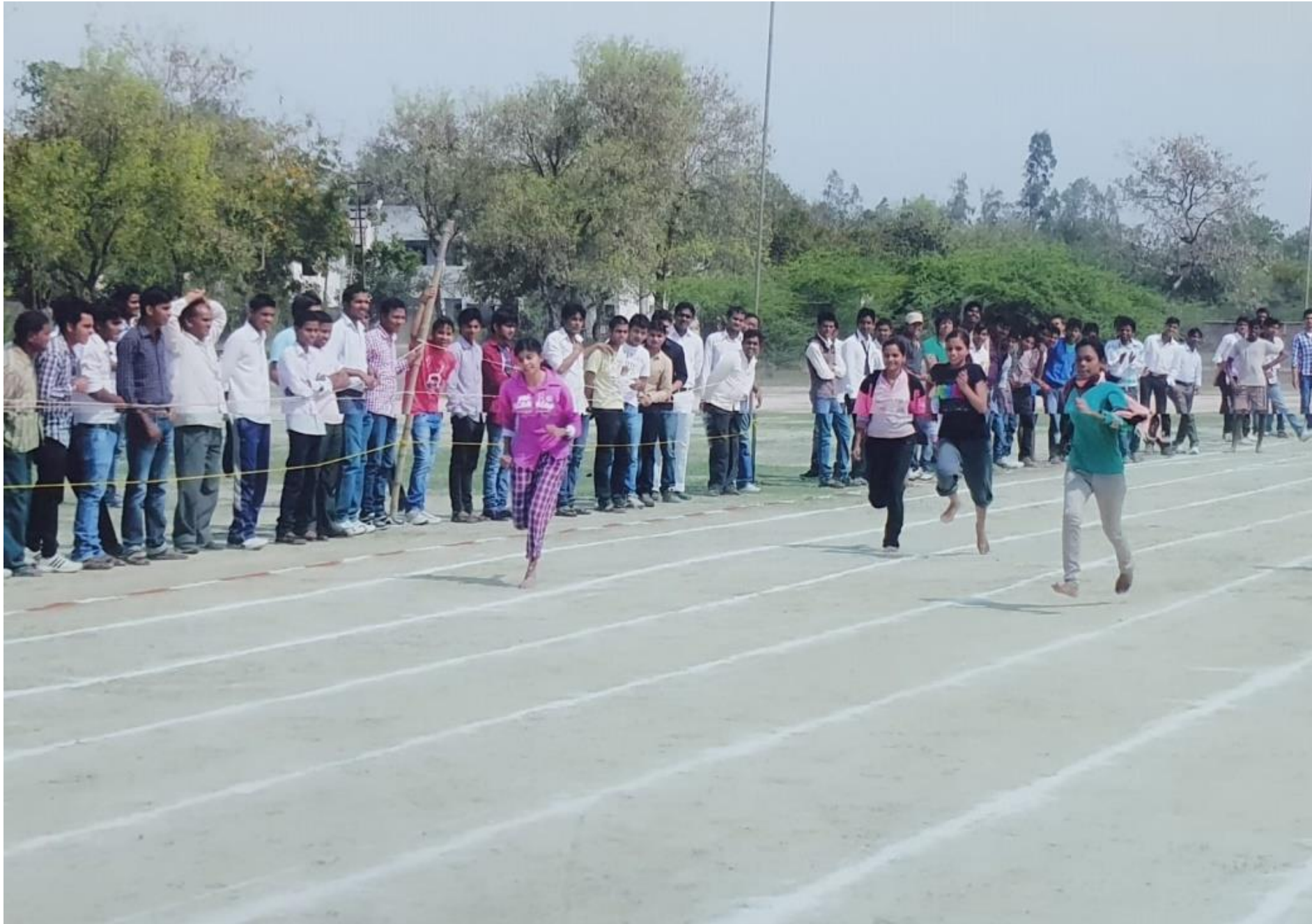
100 meter race (girls) During Sports Meet on 06 th March, 2018