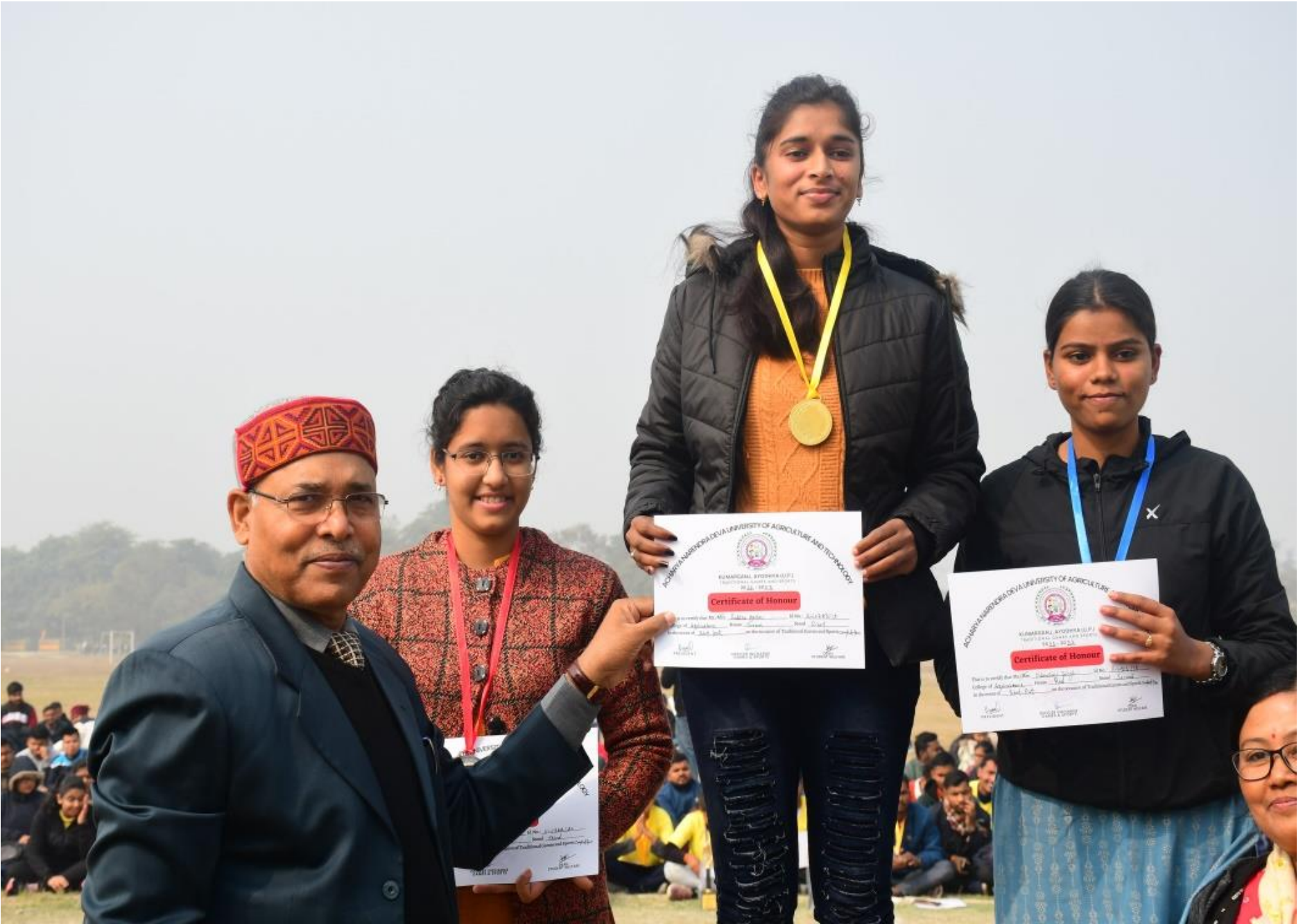
Medal & trophy distributions by Hon'ble Vice- Chancellor on 10 January, 2020