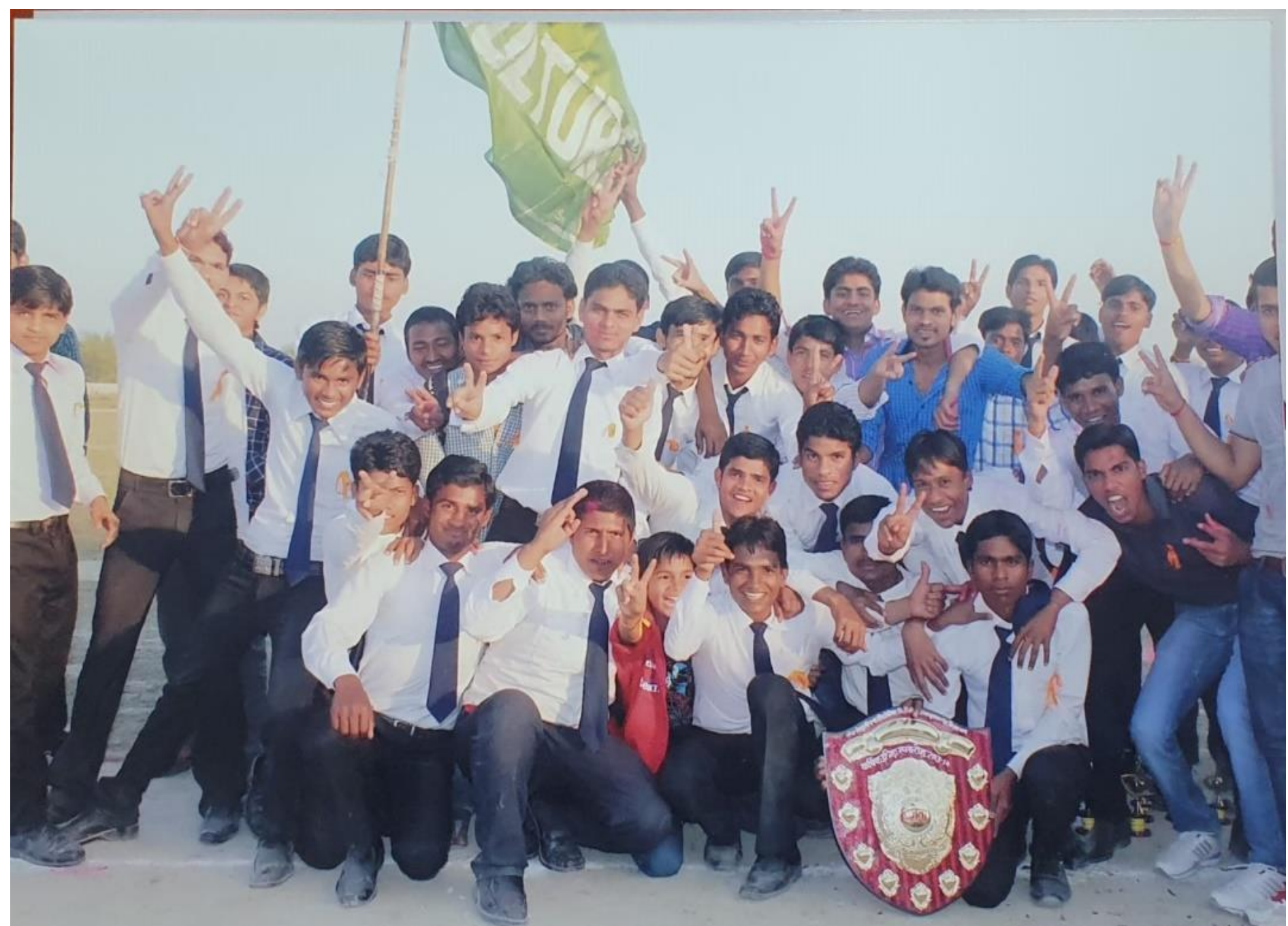
Winners (March Past Team) -2017-18