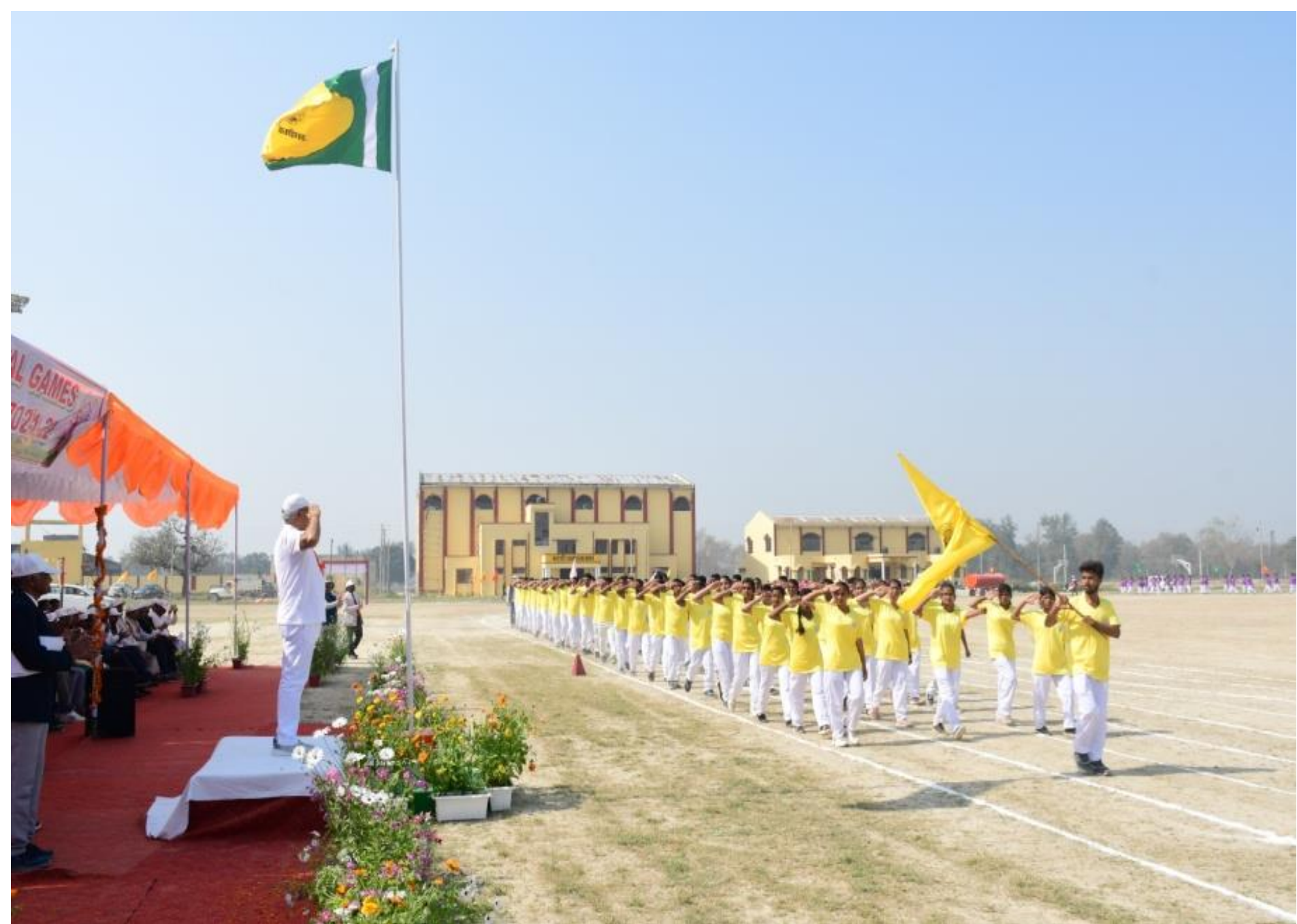
March Past (Yellow House) During Annual Sports Meet, 04 March 2022