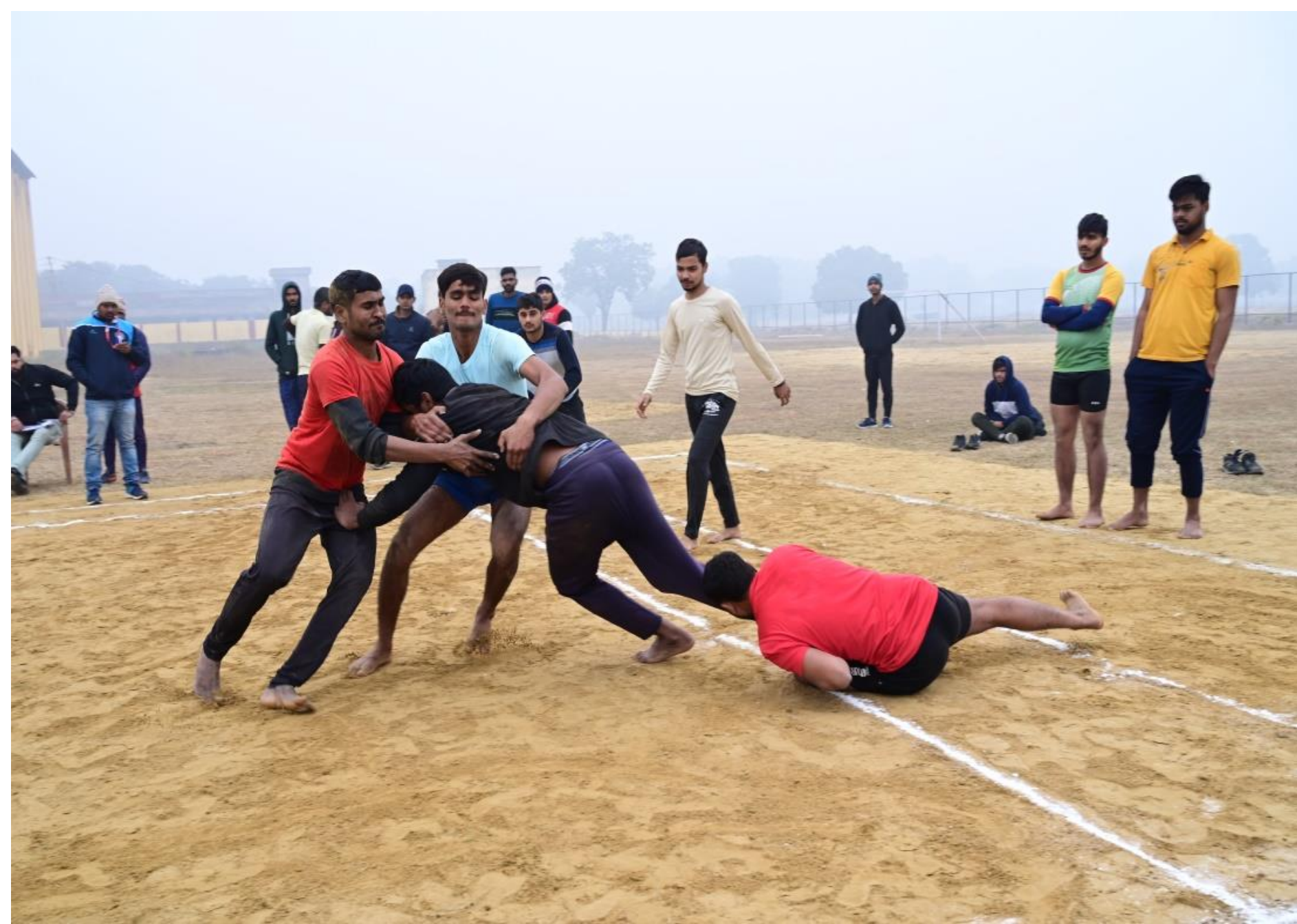
Kabaddi match (boys) of different college on 09 January, 2020