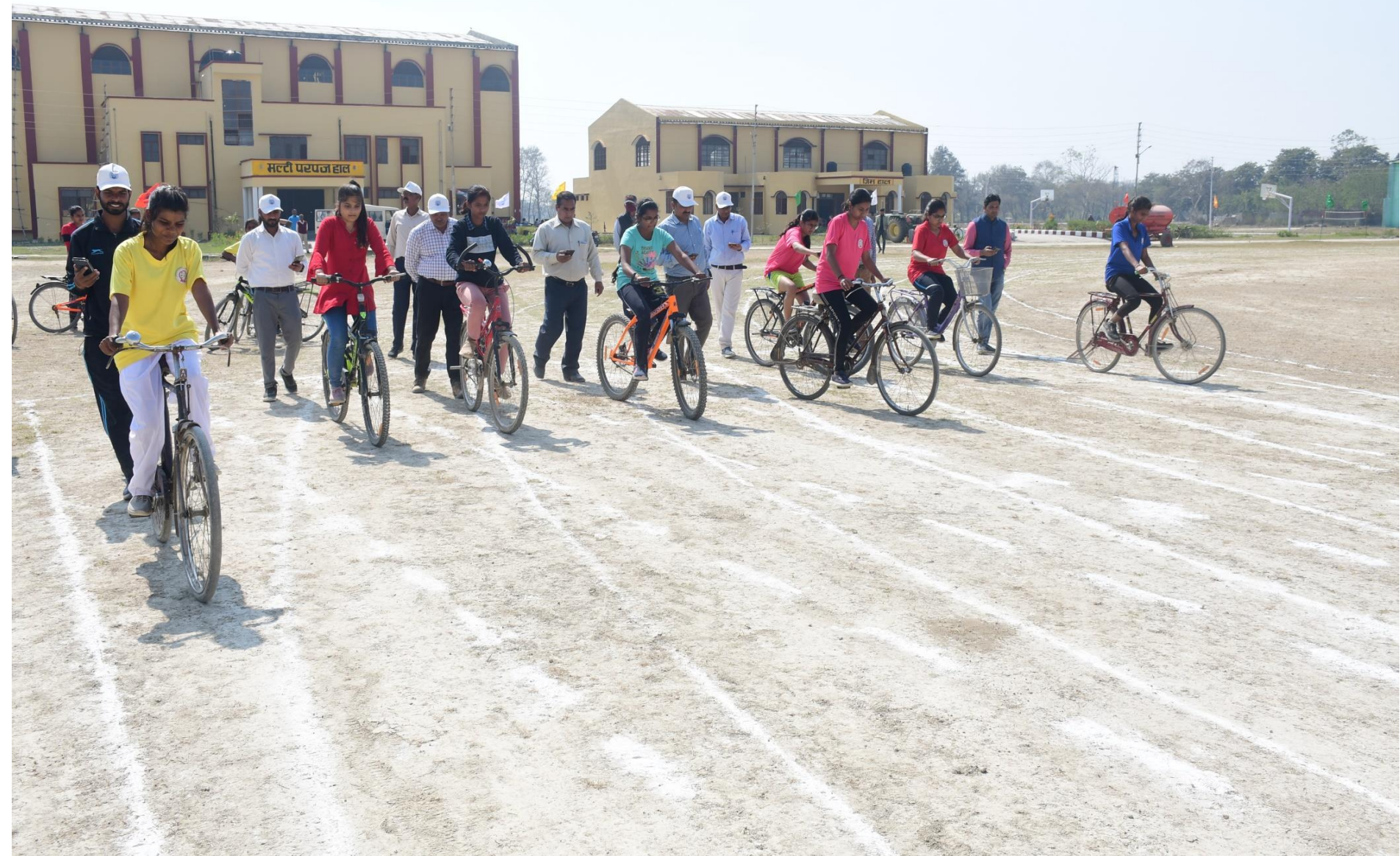
Slow cycle race (girls) during the sports meet on 06 March, 2022