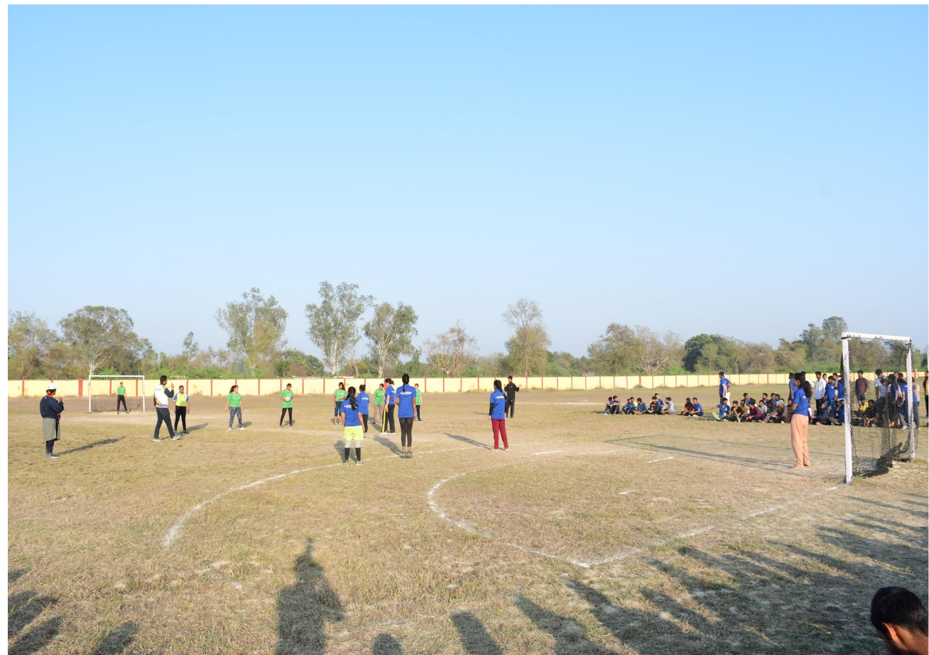
Handball match (girls) during annual sports meet on 06 March, 2023