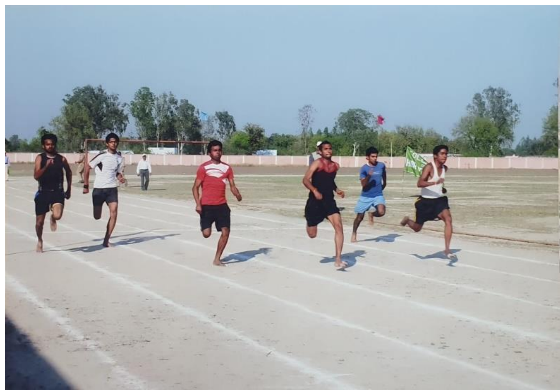
800 meter race on 03 March, 2019