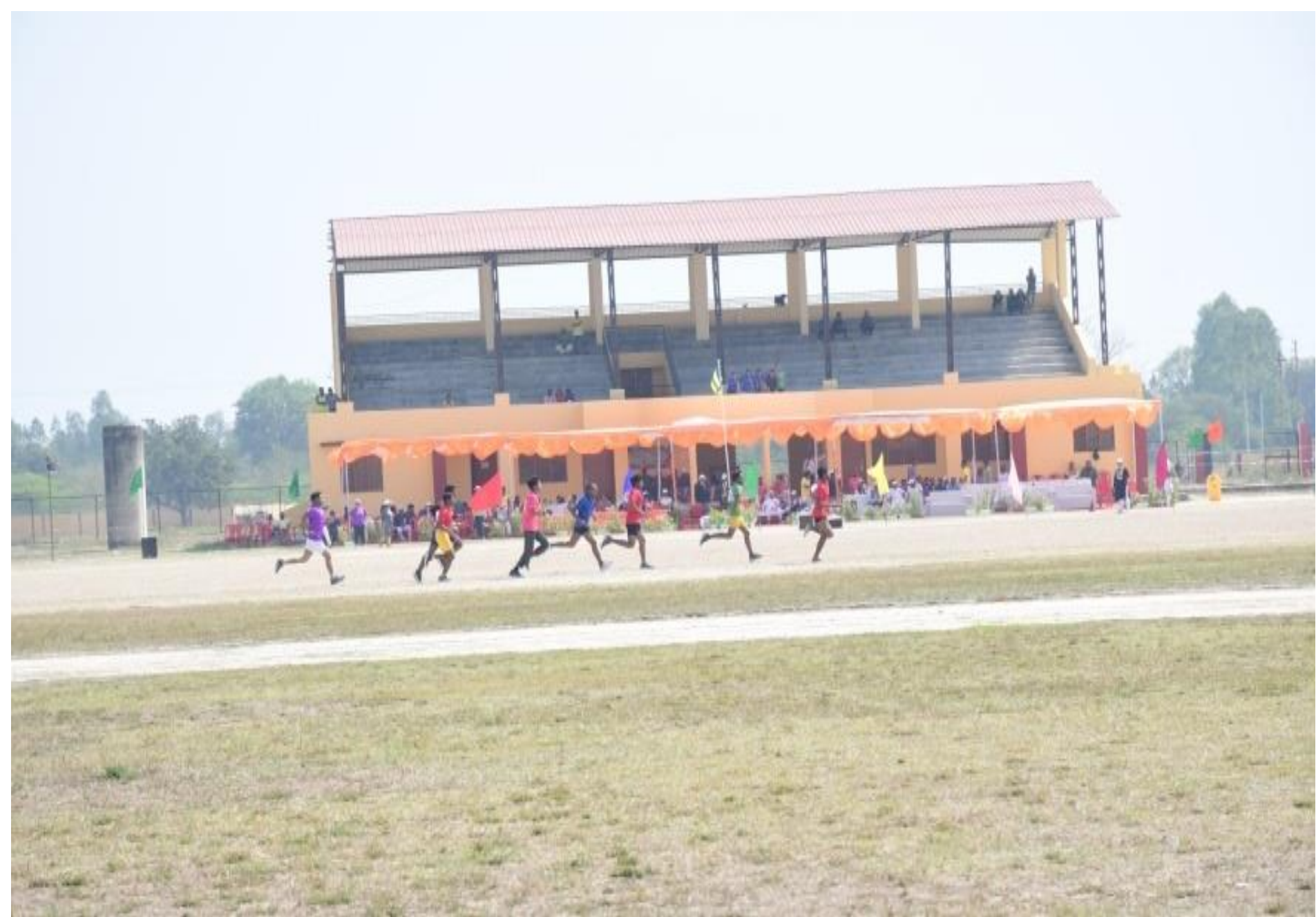
400 Meter Race (boys) on 04 March, 2022