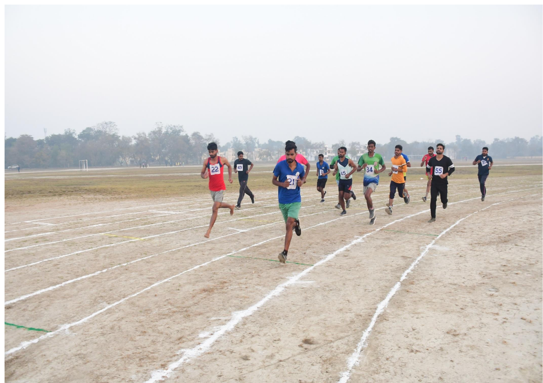
5000 meter race (boys) on 03 th March, 2019