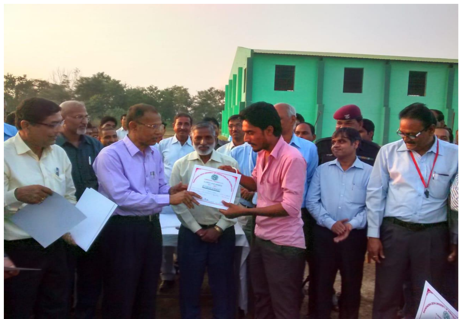
Certificate Distributions by Hon'ble Vice- Chancellor on 08 March, 2018