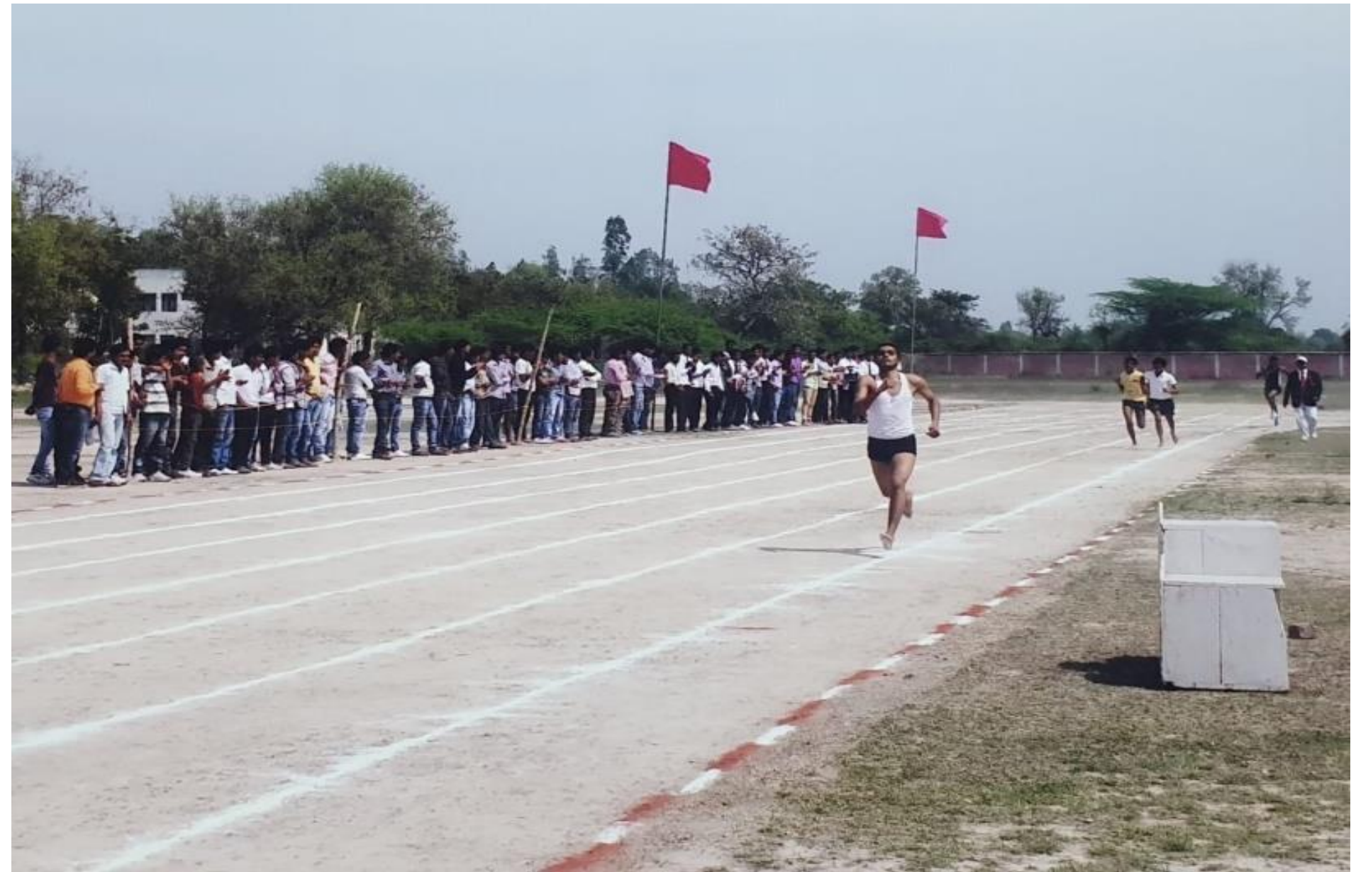
400 meter race on 03 March, 2019