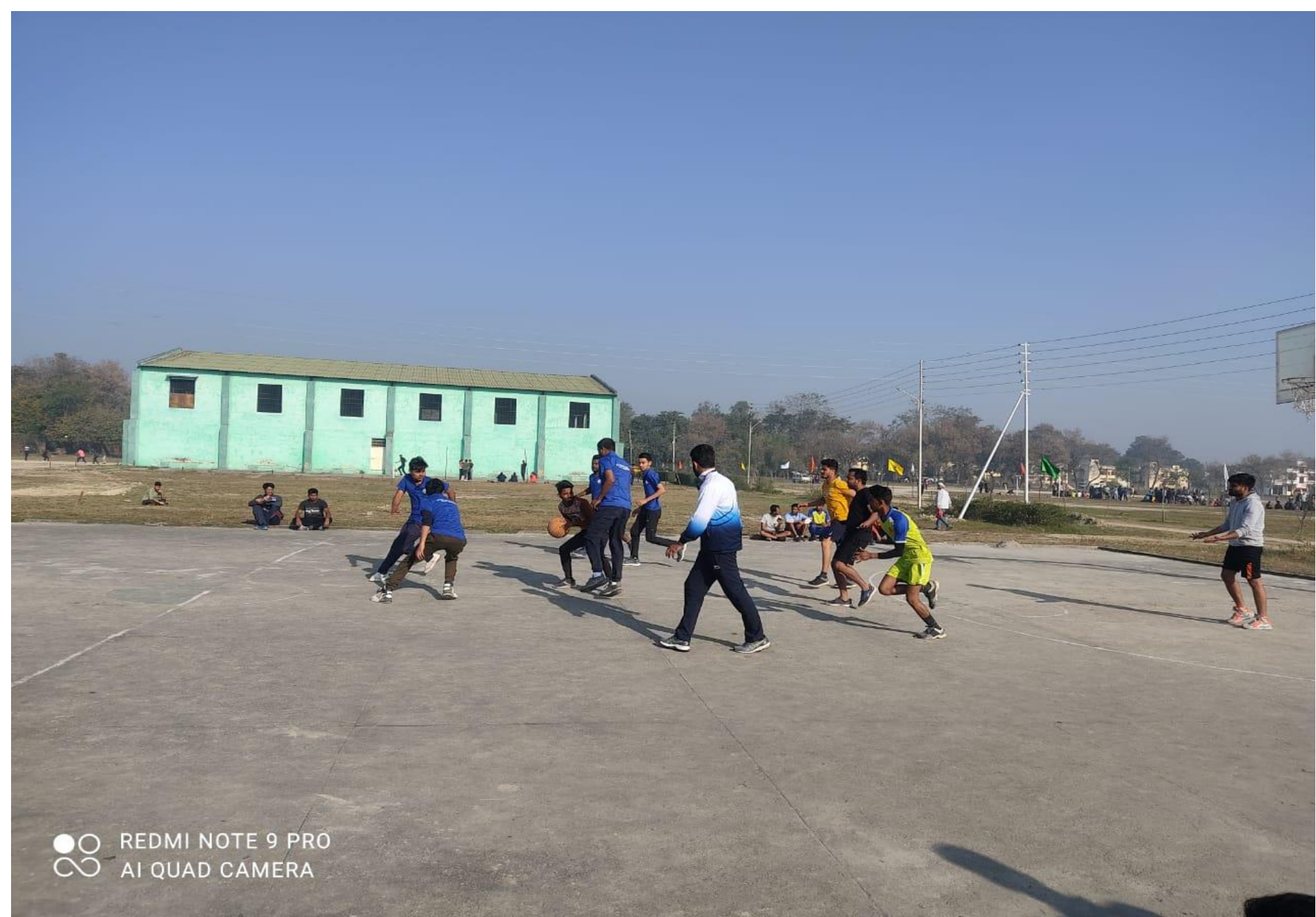
Basketball match (boys) during annual sports meet on 06 March, 2022