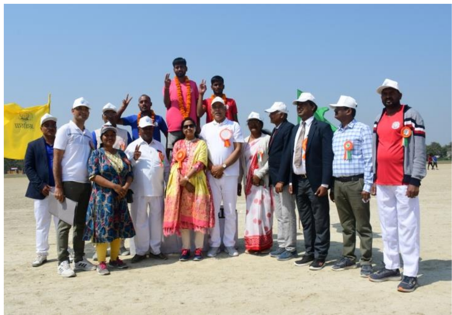
Garlanding ceremony to the students by Hon'ble Vice chancellor on 04 March, 2022