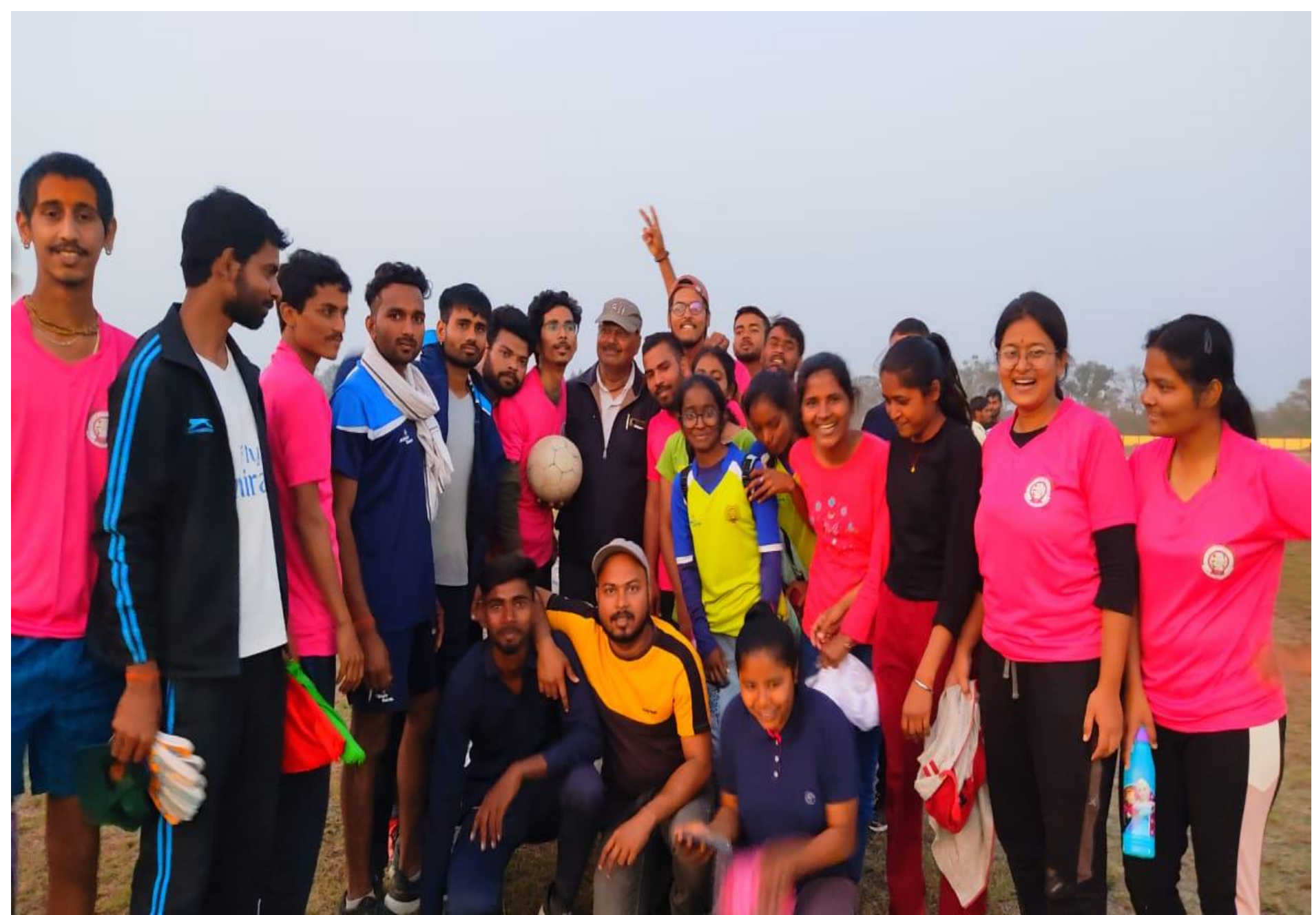
Winner Football (boys) during annual sports meet on 27 February, 2022