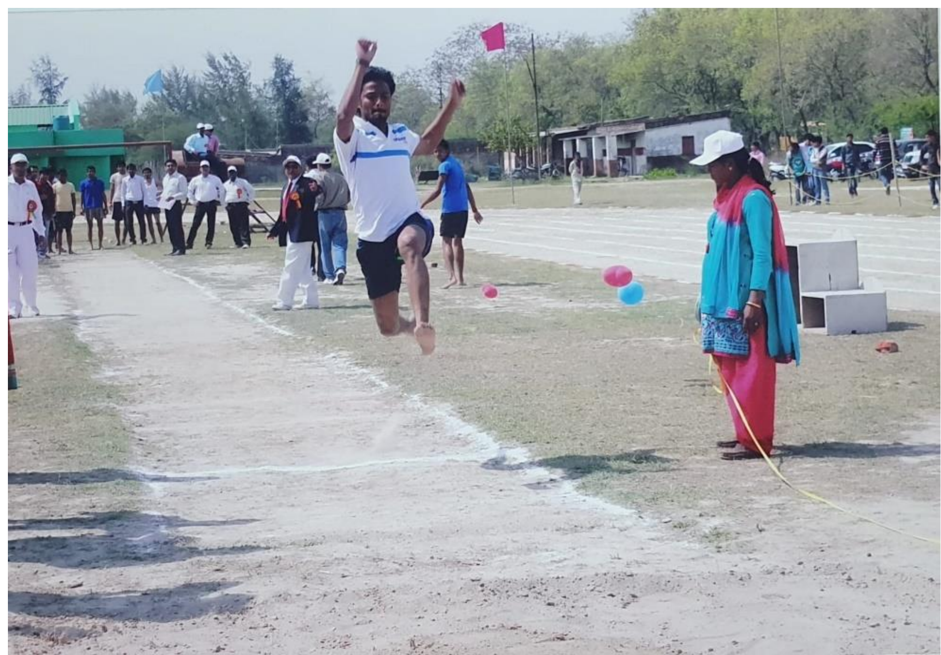
Long Jump (boys) on 07 th march, 2018