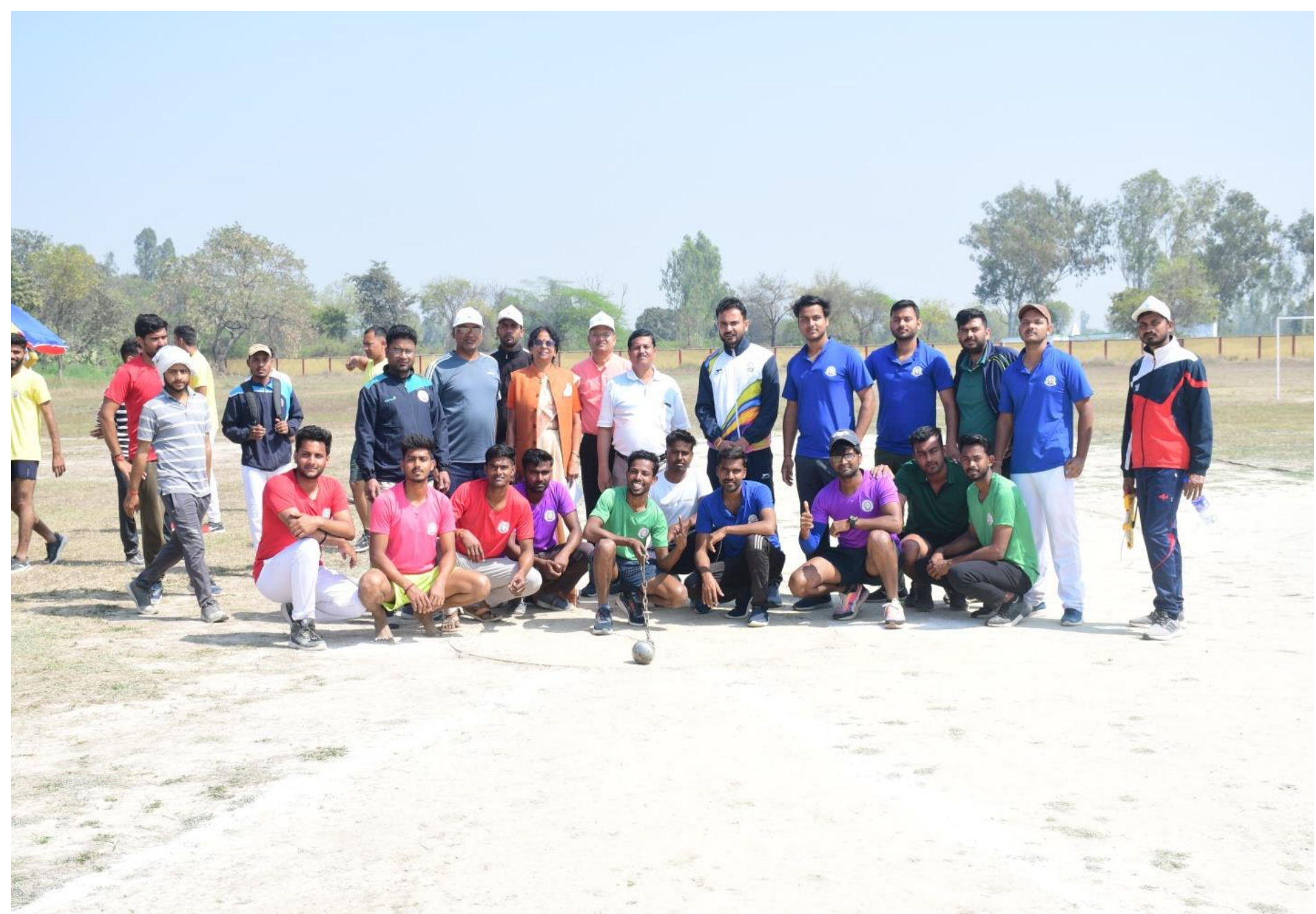
Hammer throw (boys) during the sports meet on 05 March, 2022