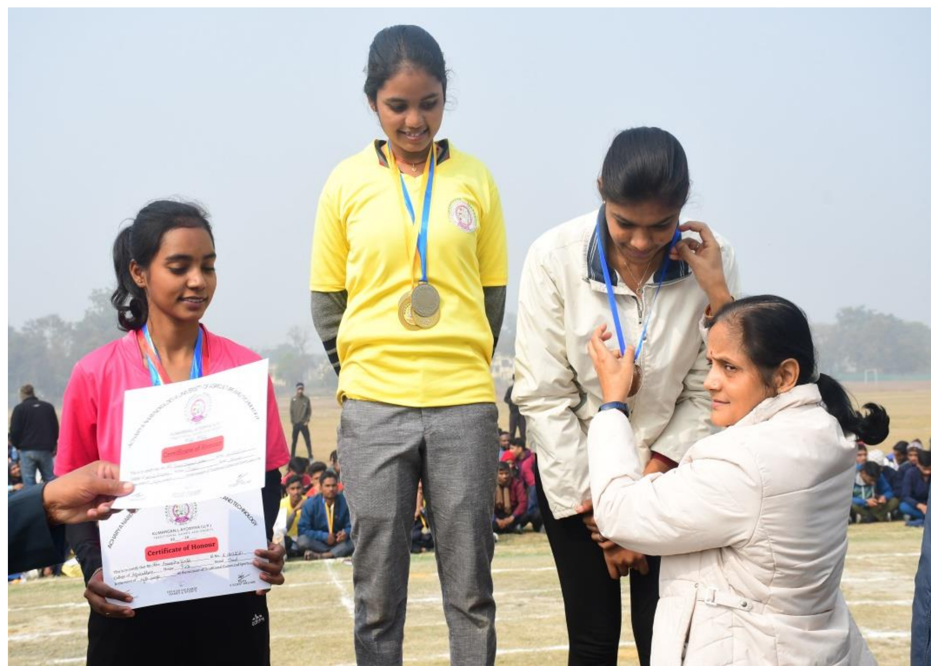
Medal and certificate to the winning (girls) students on 08 January, 2020