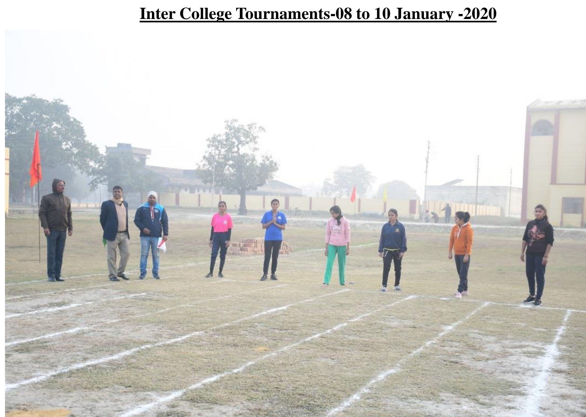
Competition for 100 meter run (girls) on 08 January, 2020