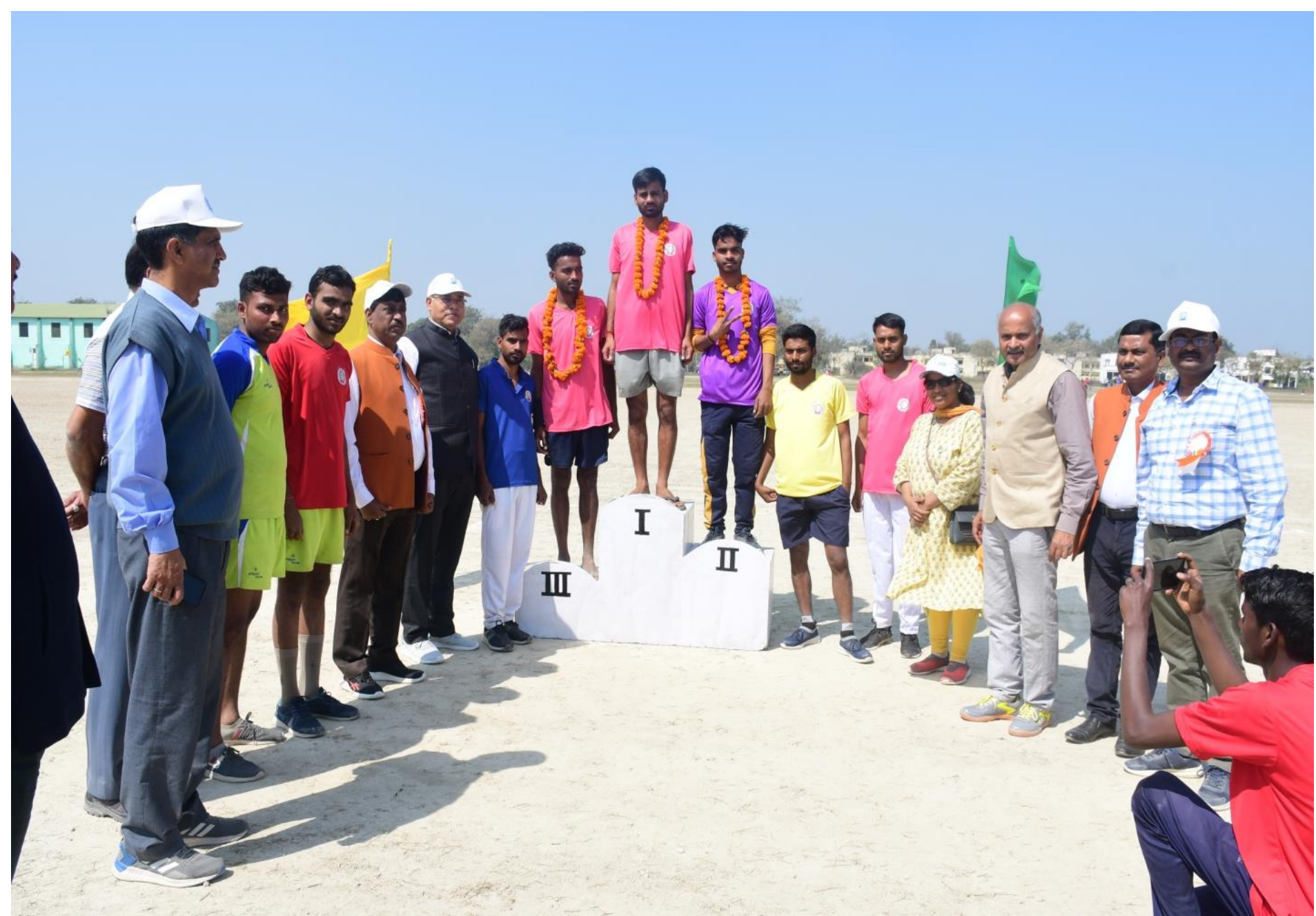
Garlanding to the students Hon'ble Vice chancellor on 05 March, 2022