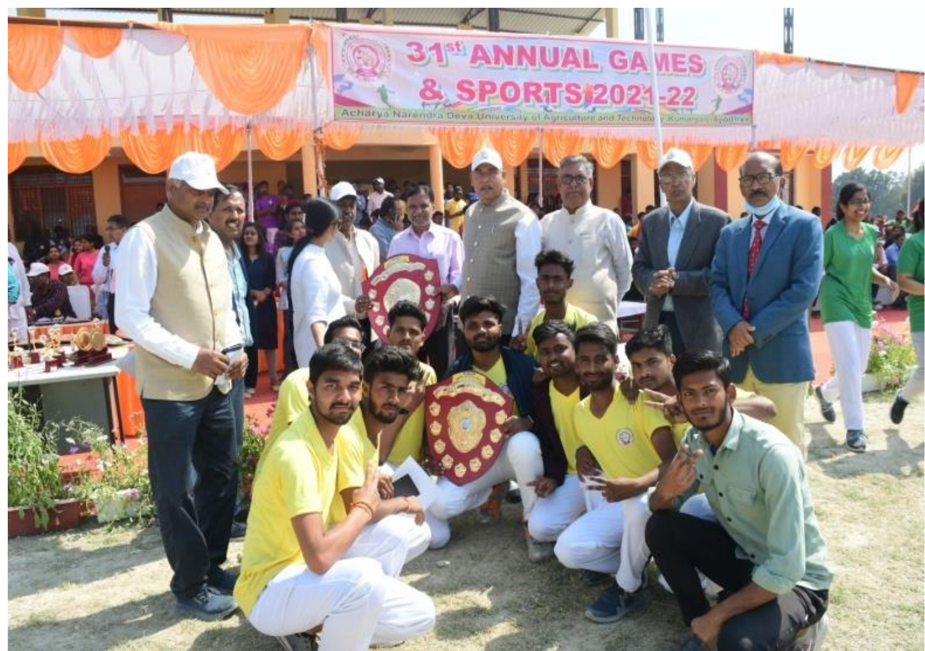
Kabaddi Winners (Yellow House) 06 March, 2022