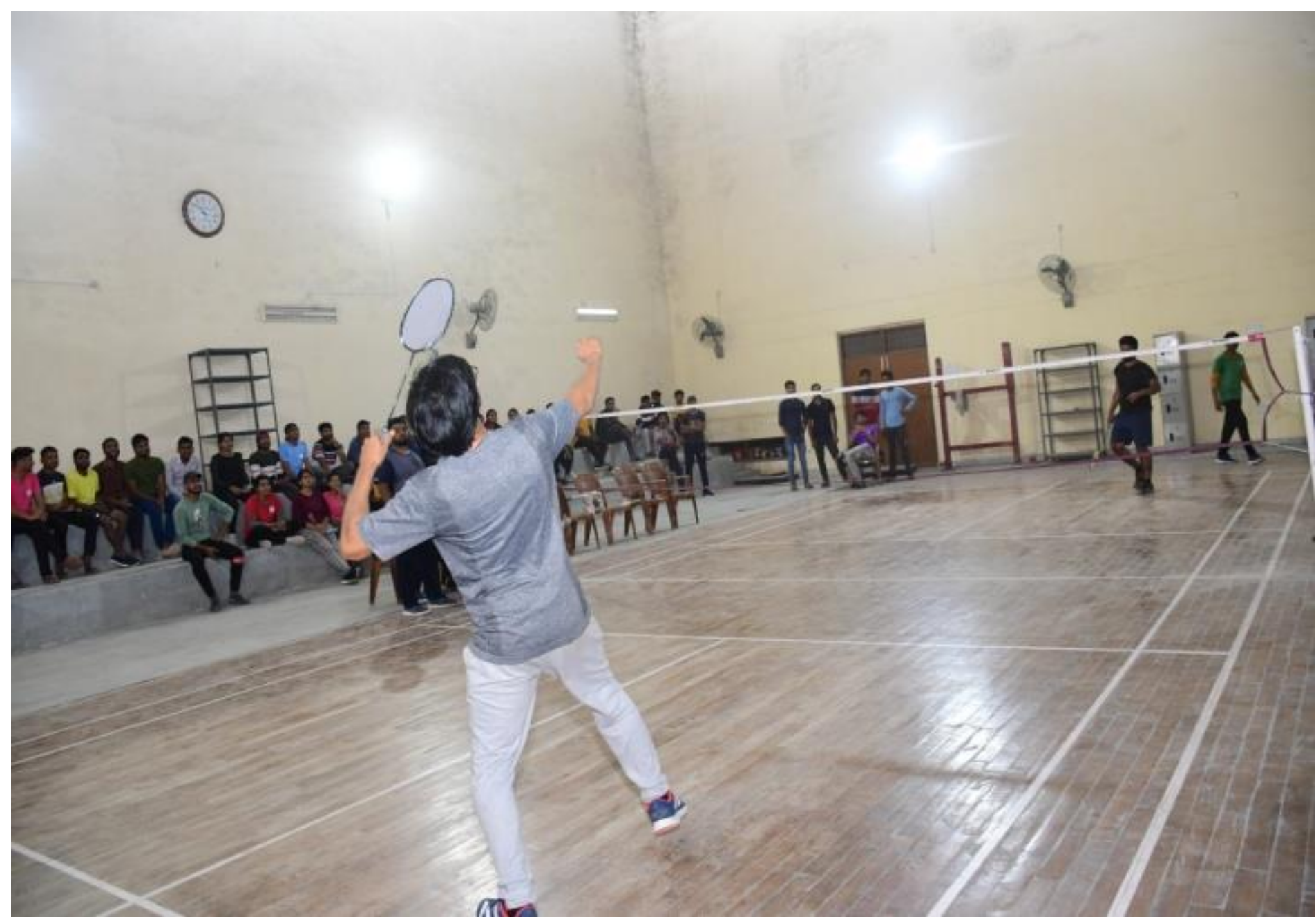
Badminton match (Boys –single) 02 nd March, 2022