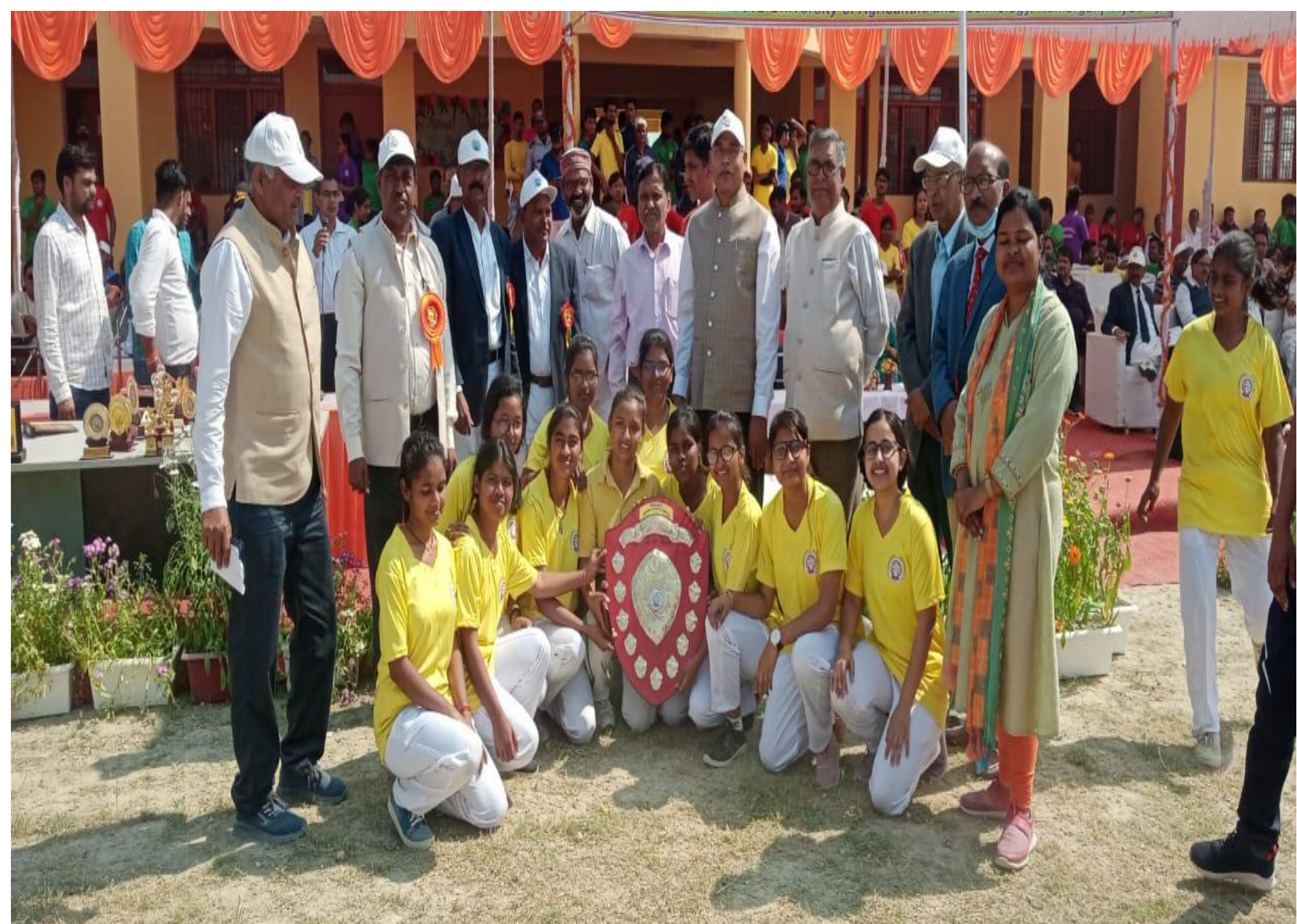
Kho-Kho Winners (Yellow House) on 06 March, 2022