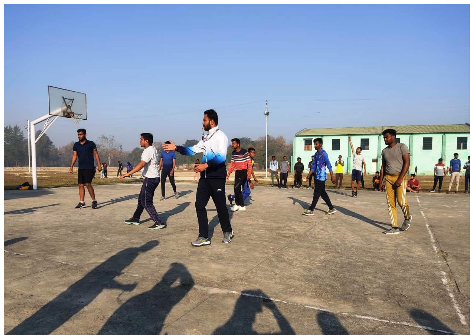
Basketball match (boys) of different college on 09 January, 2020