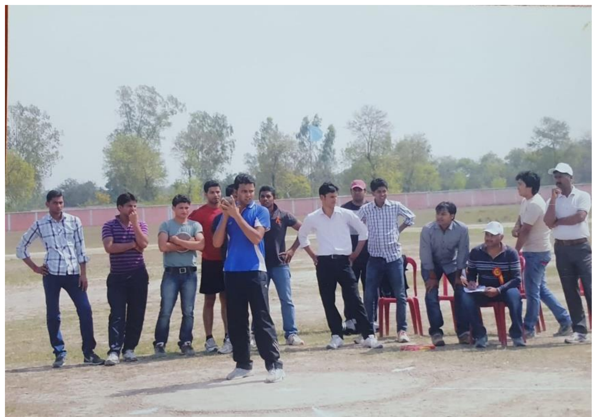
Shot-put throw on 03 March, 2019