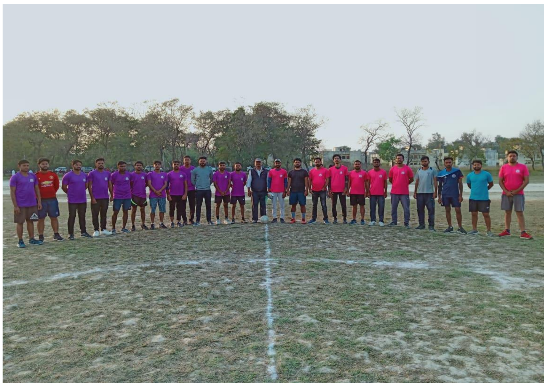
Football match (boys) during annual sports meet on 27 February, 2022