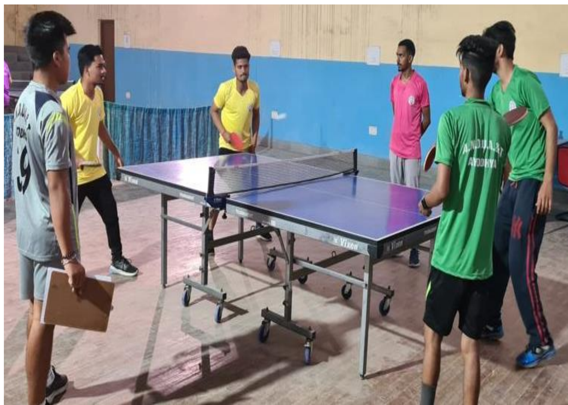
Table tennis match (boys) during the tournaments on 09 January, 2020