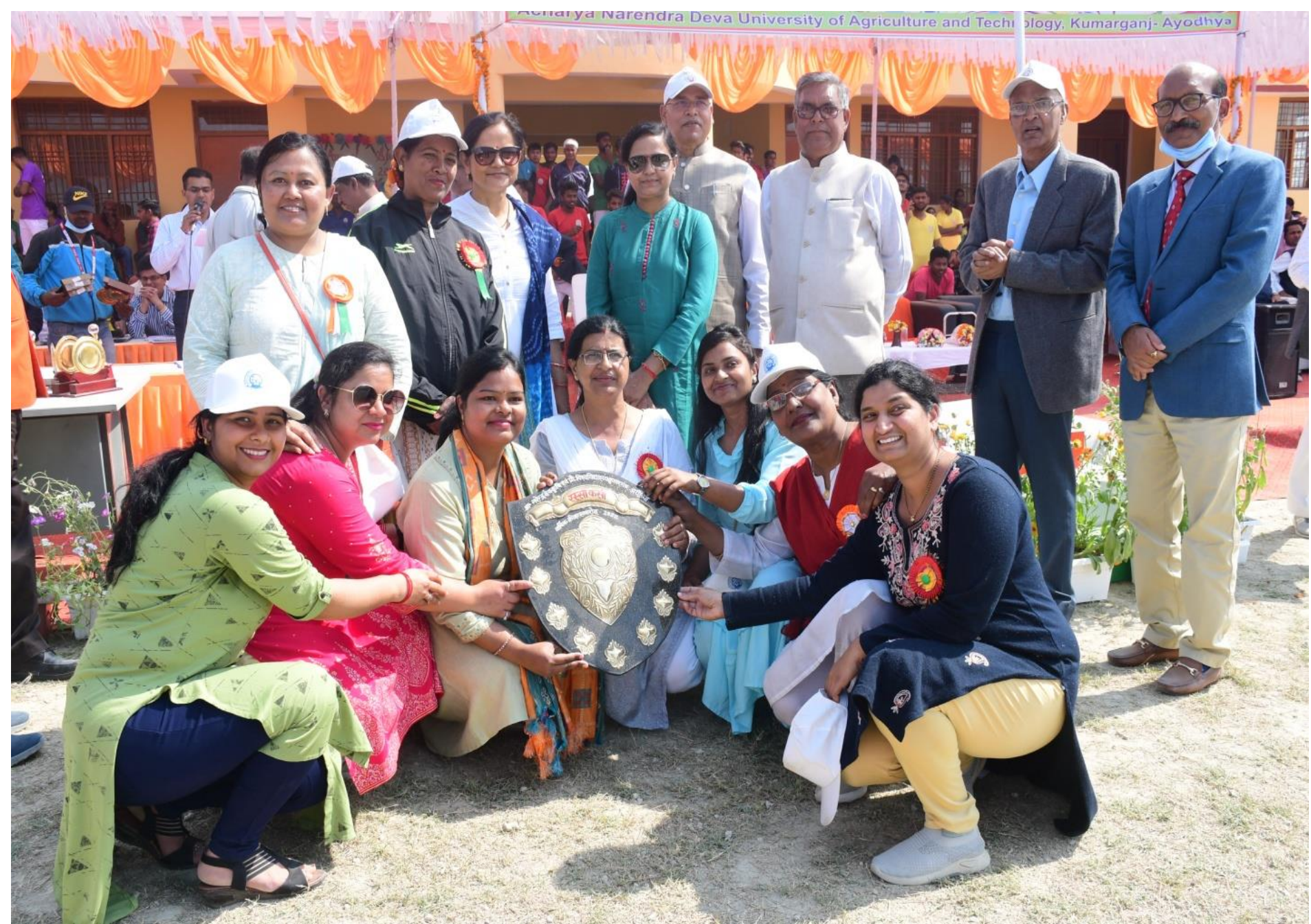
Trophy distributions by Hon'ble Vice- Chancellor Mam on 06 March, 2022