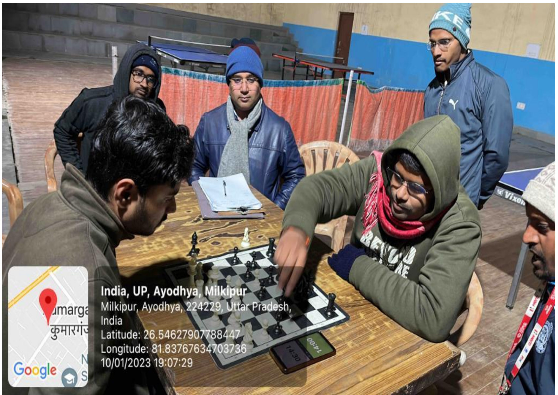
Chess Competition (boys)