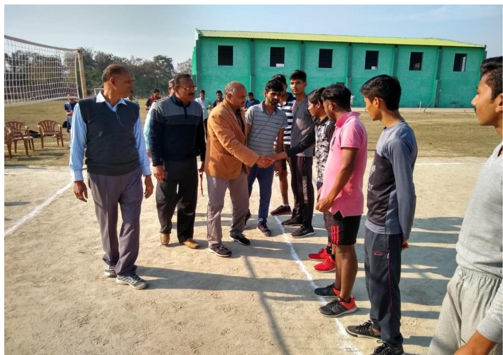
Volleyball match on 18 th January, 2019