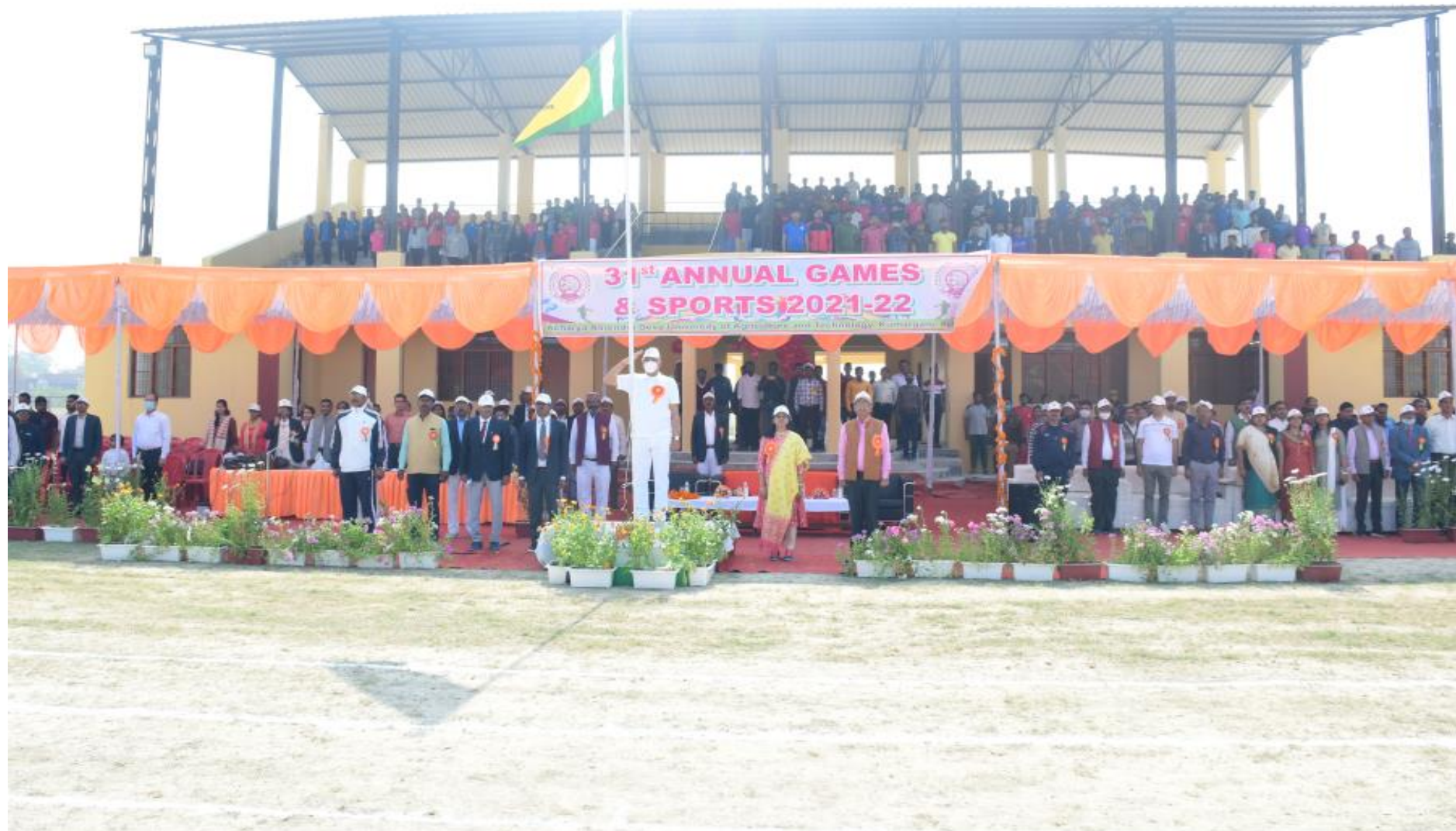
Salute to the Chief Guest by the march past team of different houses