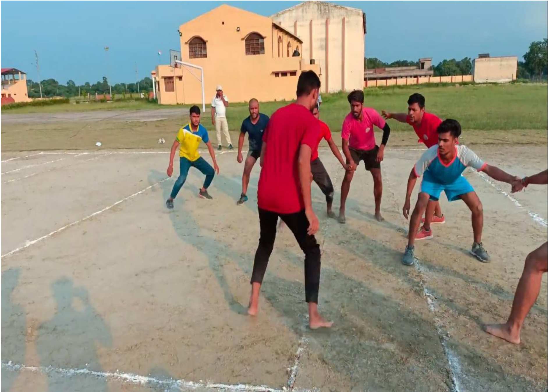
Kabaddi match on 18 January, 2018