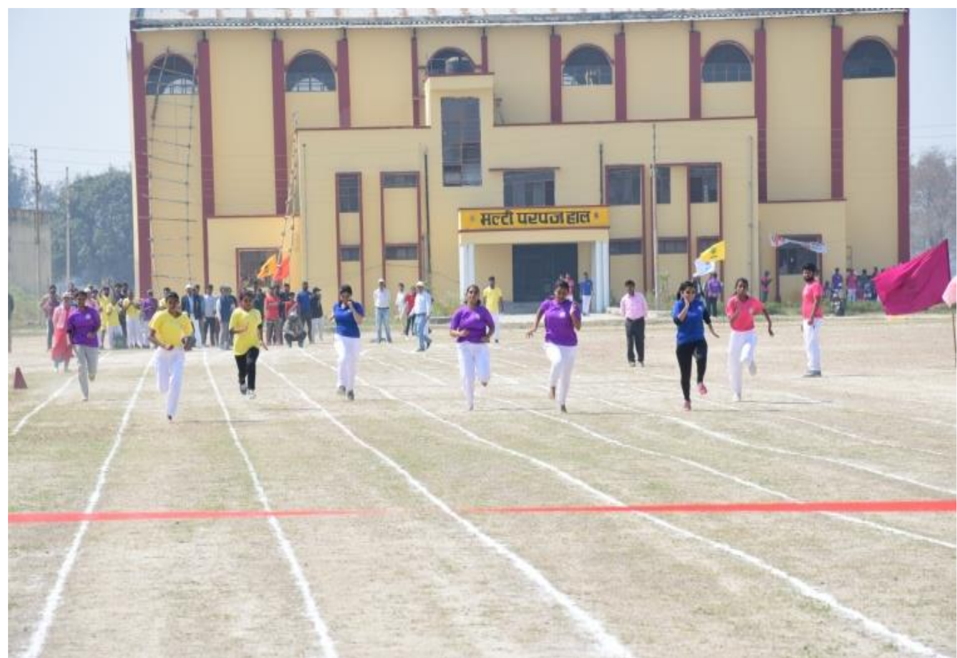
Competition for 100 meter race (girls) during annual sports meet, 04 March 2022