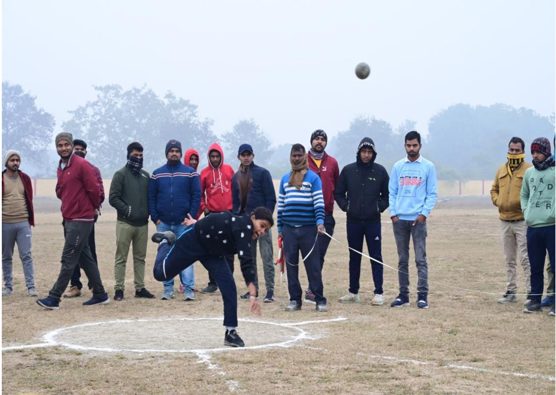
Shot Put throw (girls) on 08 January, 2020