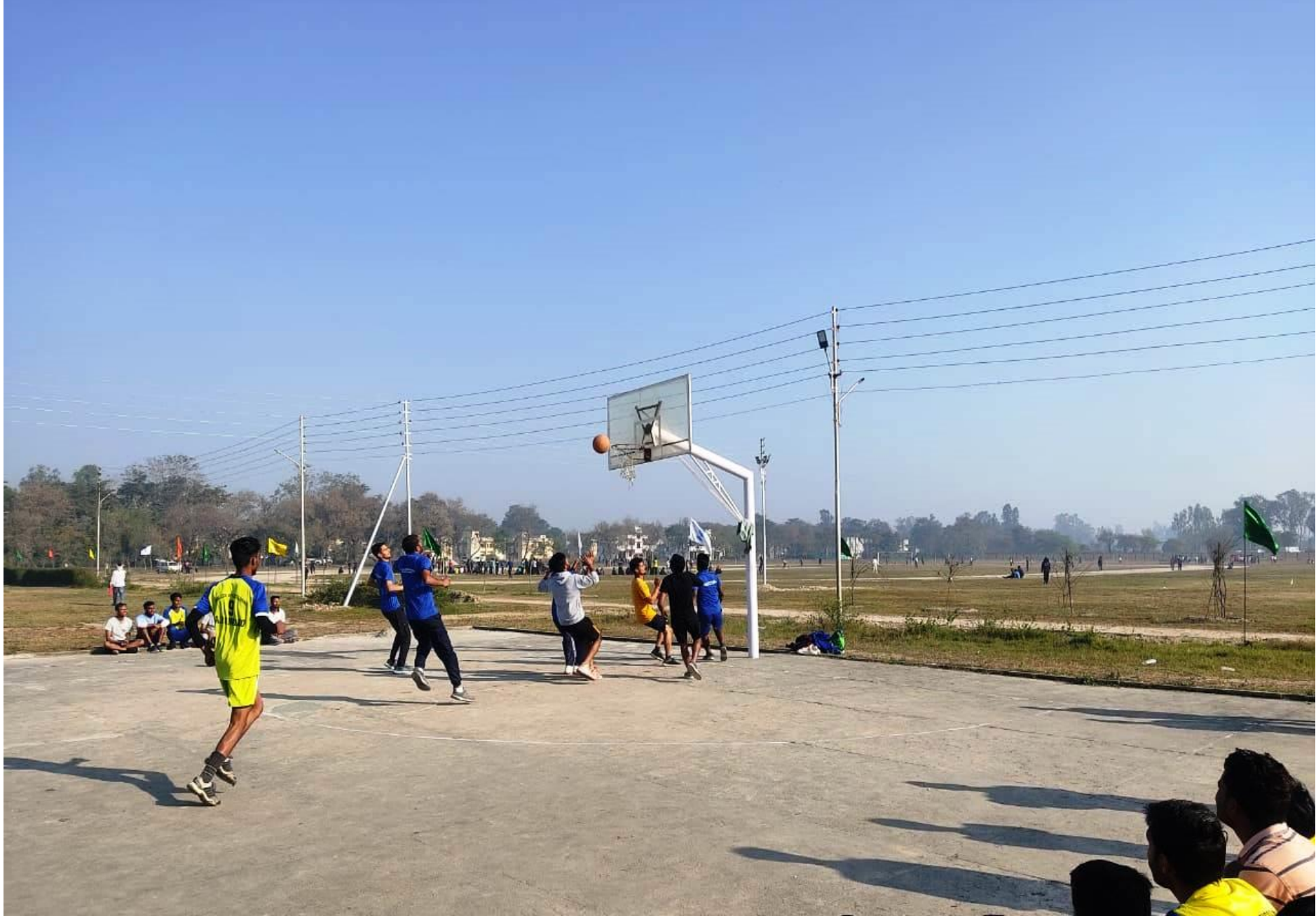
Basket ball match (boys) on 06 th March, 2018