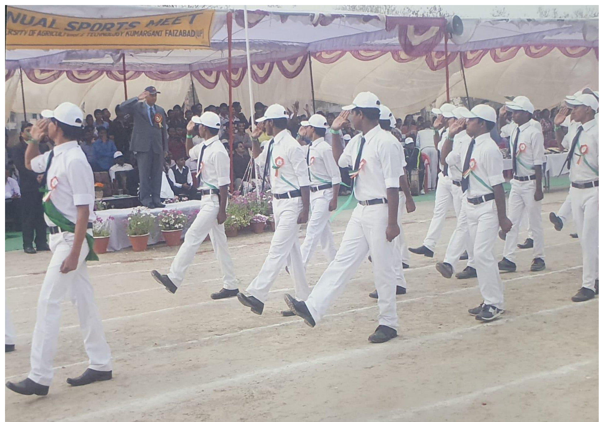
March Past during Sports Meet on 06 th March, 2018