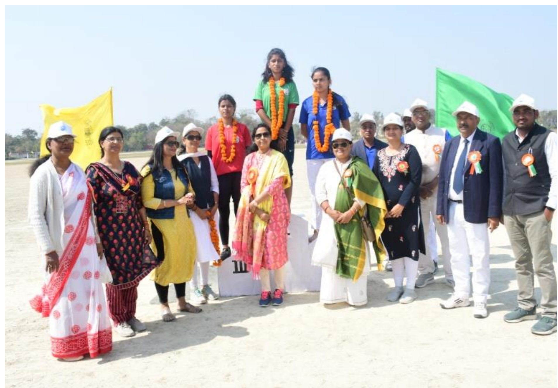
Garlanding ceremony of the winning students, 04 March 2022