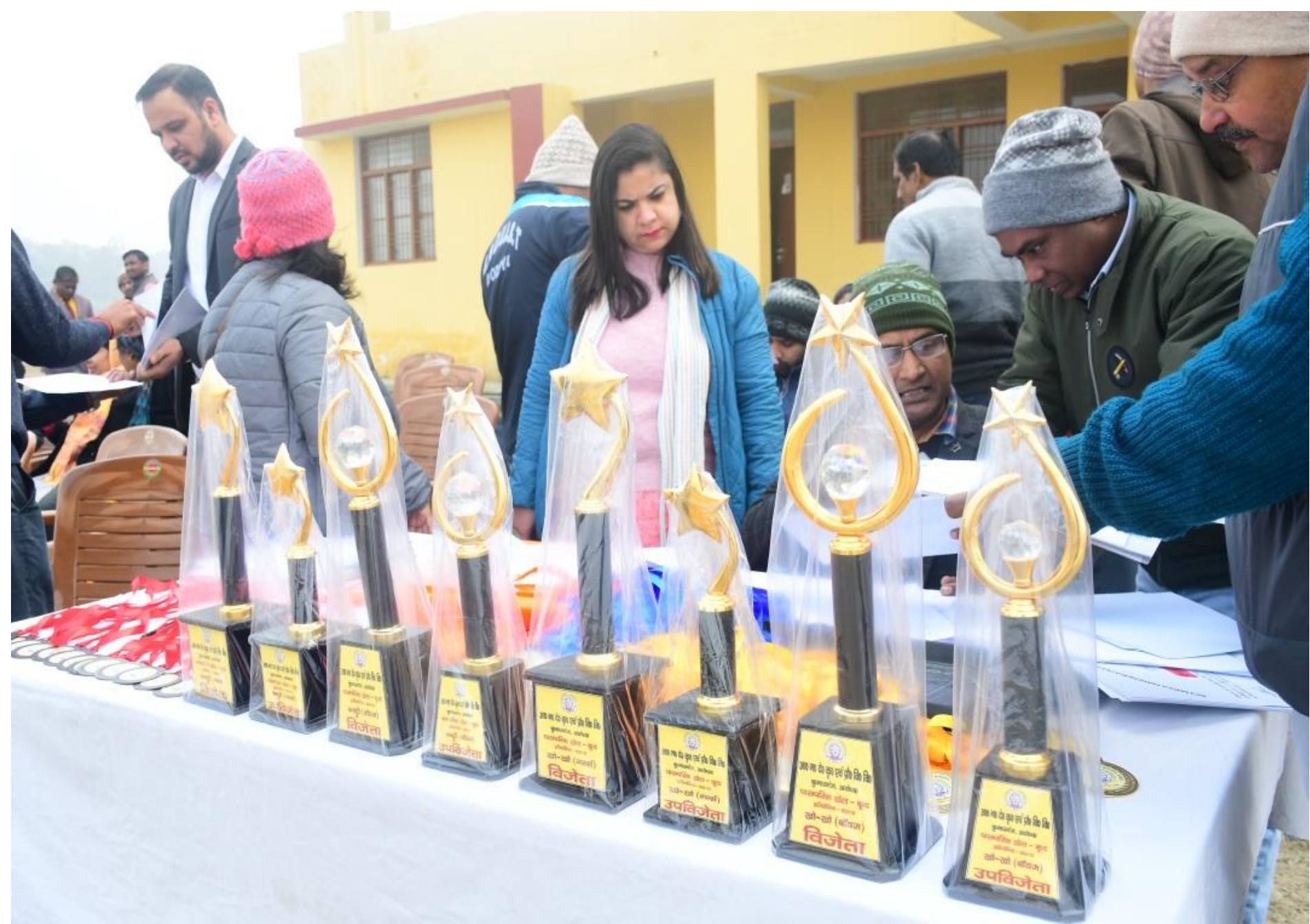
Trophy for distribution to the Winner of Different Games & Sports Events (2019-20)