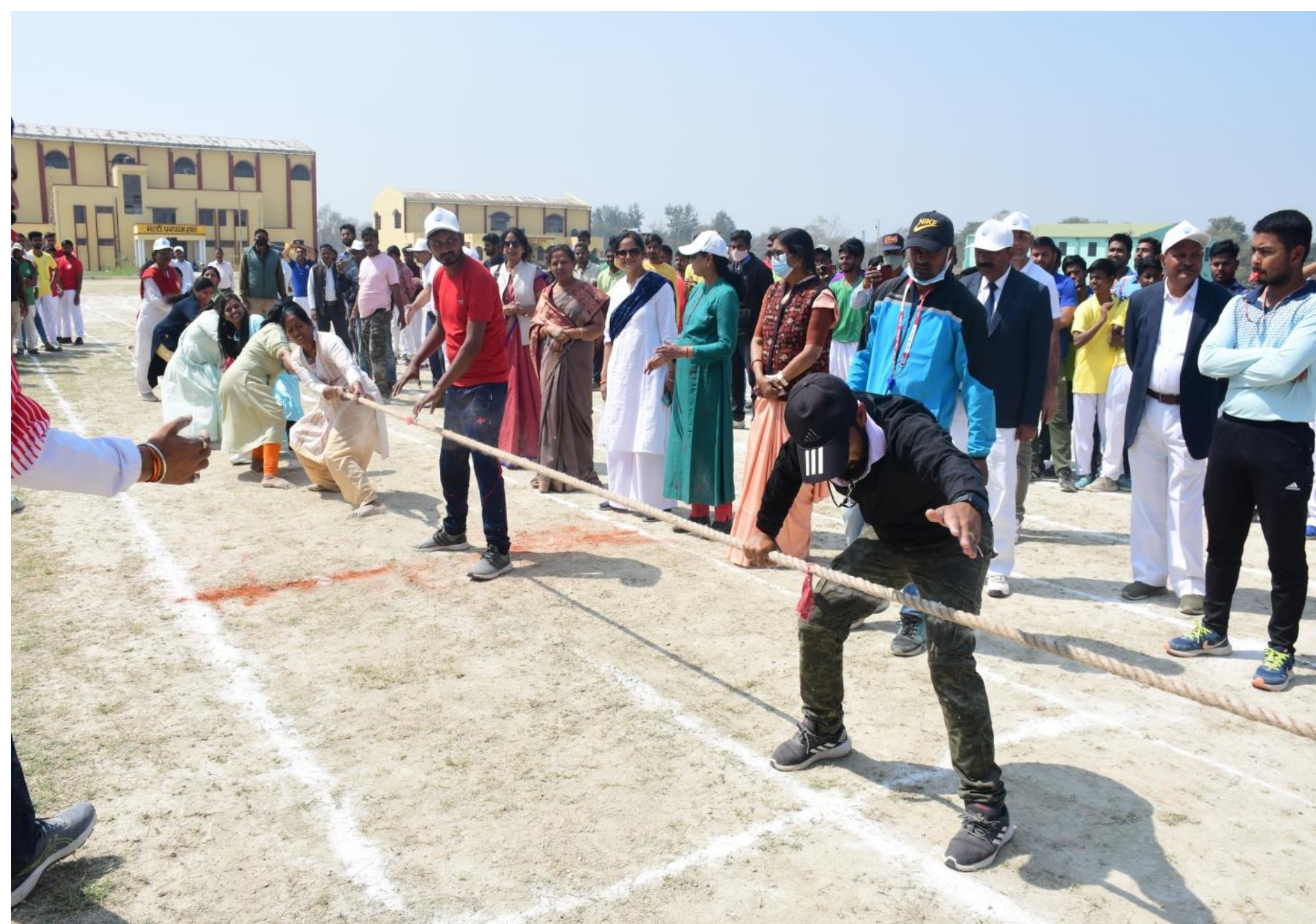
Tug off war (Staff vs Students) on 06 March, 2022