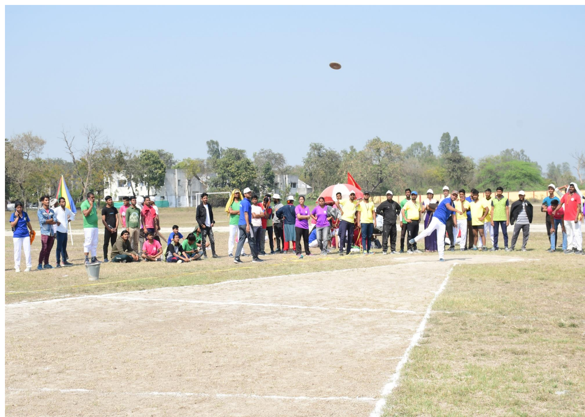
Discus throw (boys) on 04 March, 2022