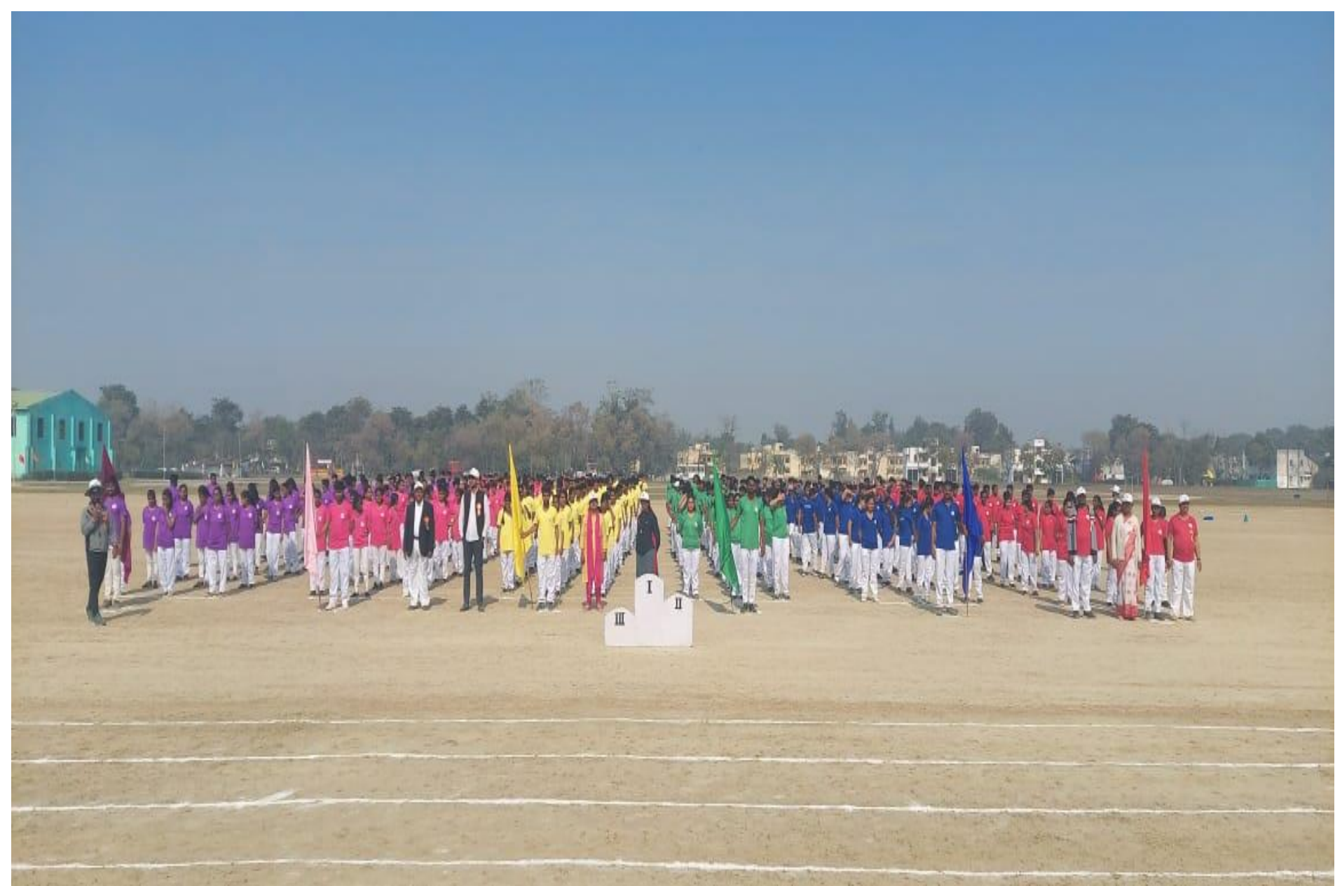
Six sports houses of the University on the occasion of Annual Sports & Games Meet-2021-22