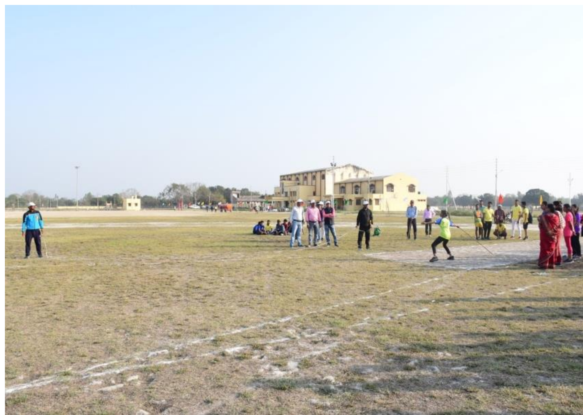
Javelin throw (girls) during annual sports meet on 04 March, 2022