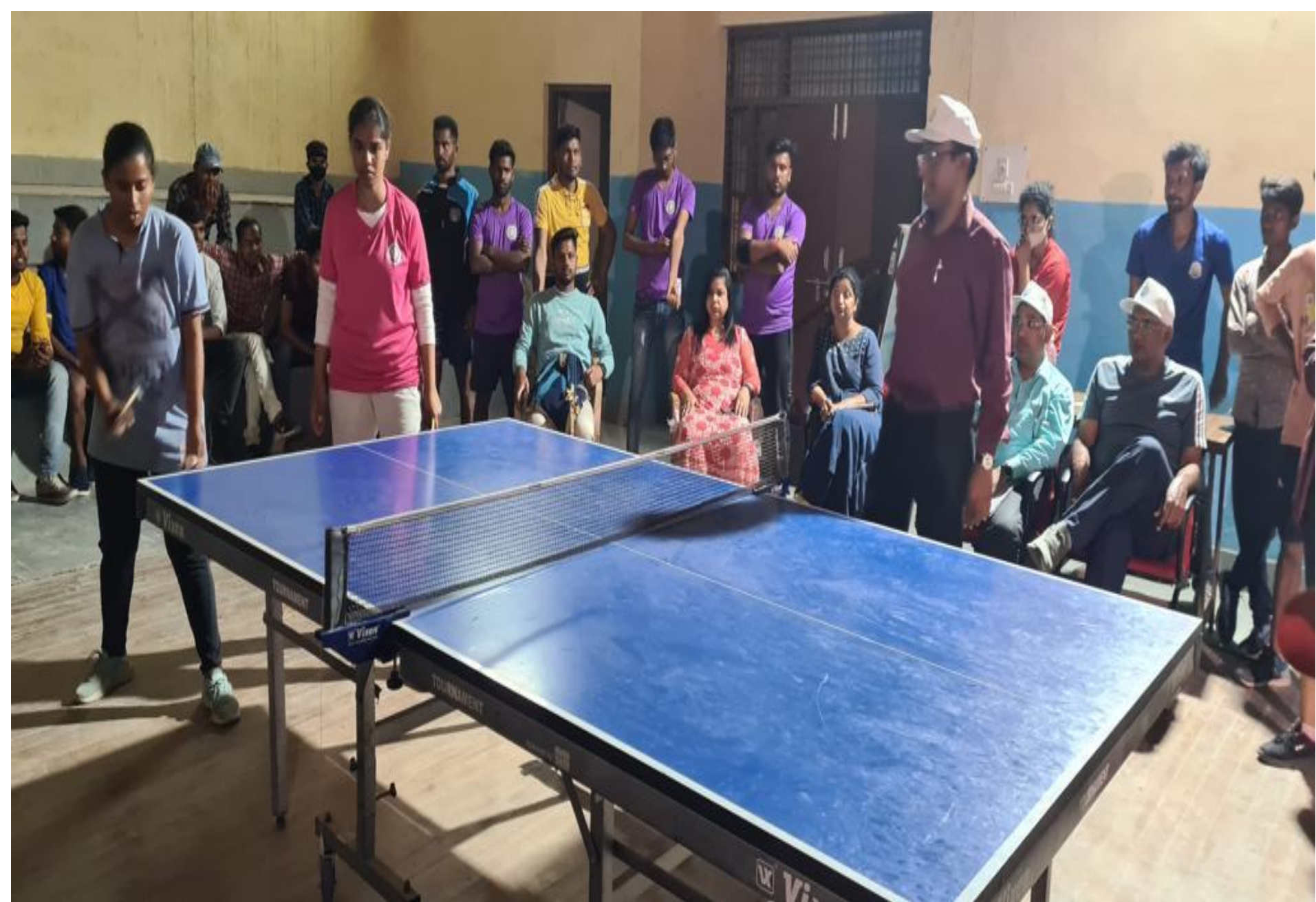
Table tennis match (girls) on 16 January (Evening), 2019