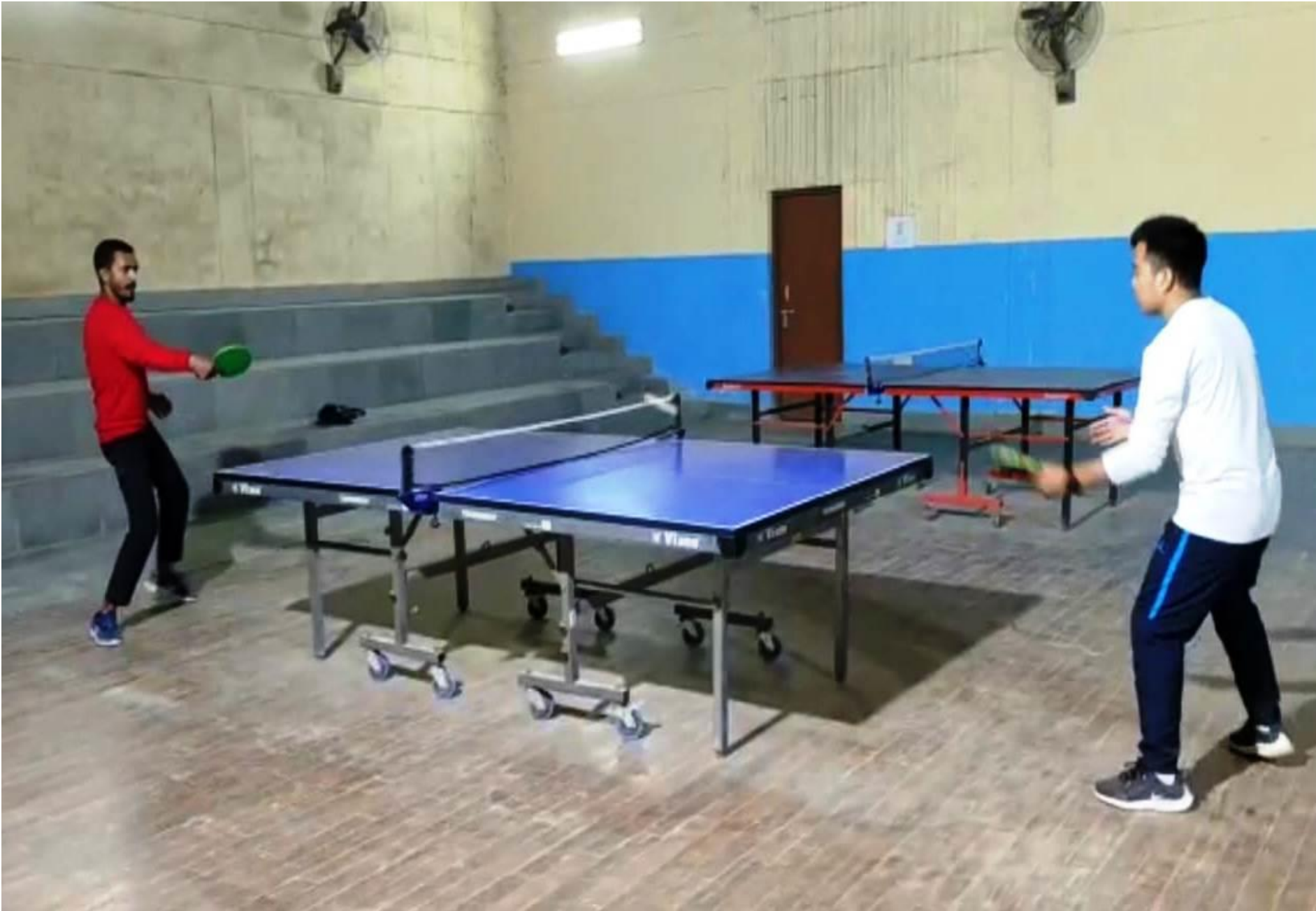
Table Tennis Match (boys) on 10 th February , 2018