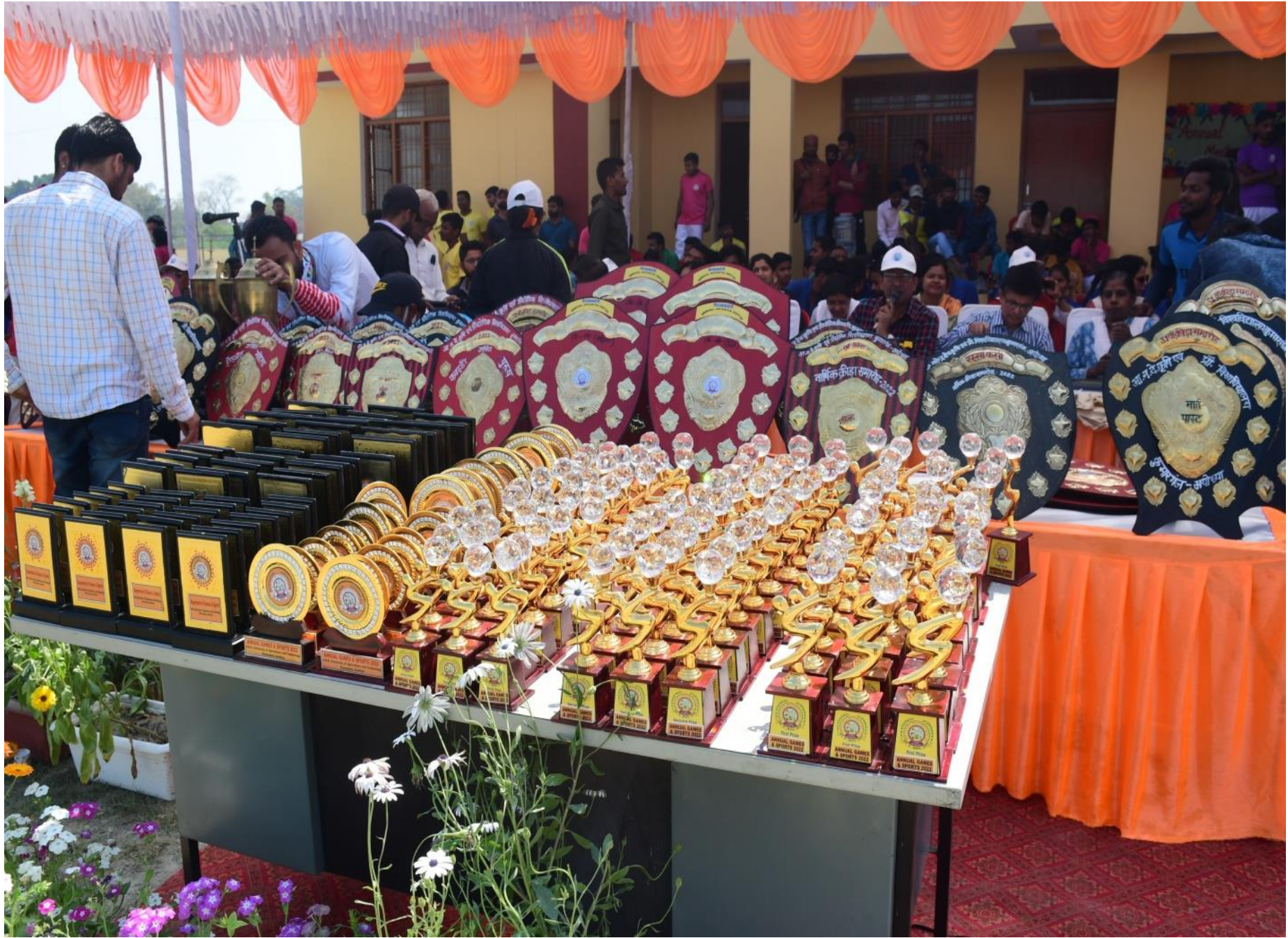
Before Distribution of trophy winners of Games & Sports (2022)