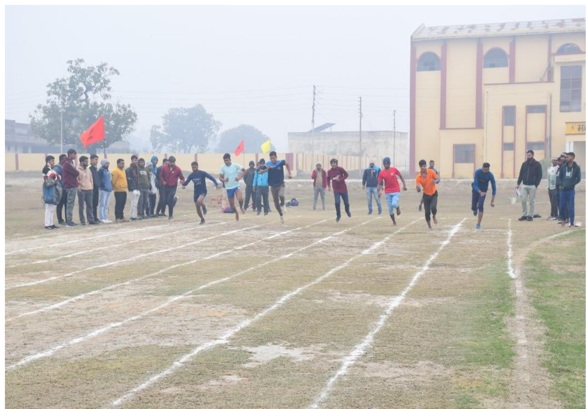
Competition for 100 meter race (boys) on 08 January, 2020