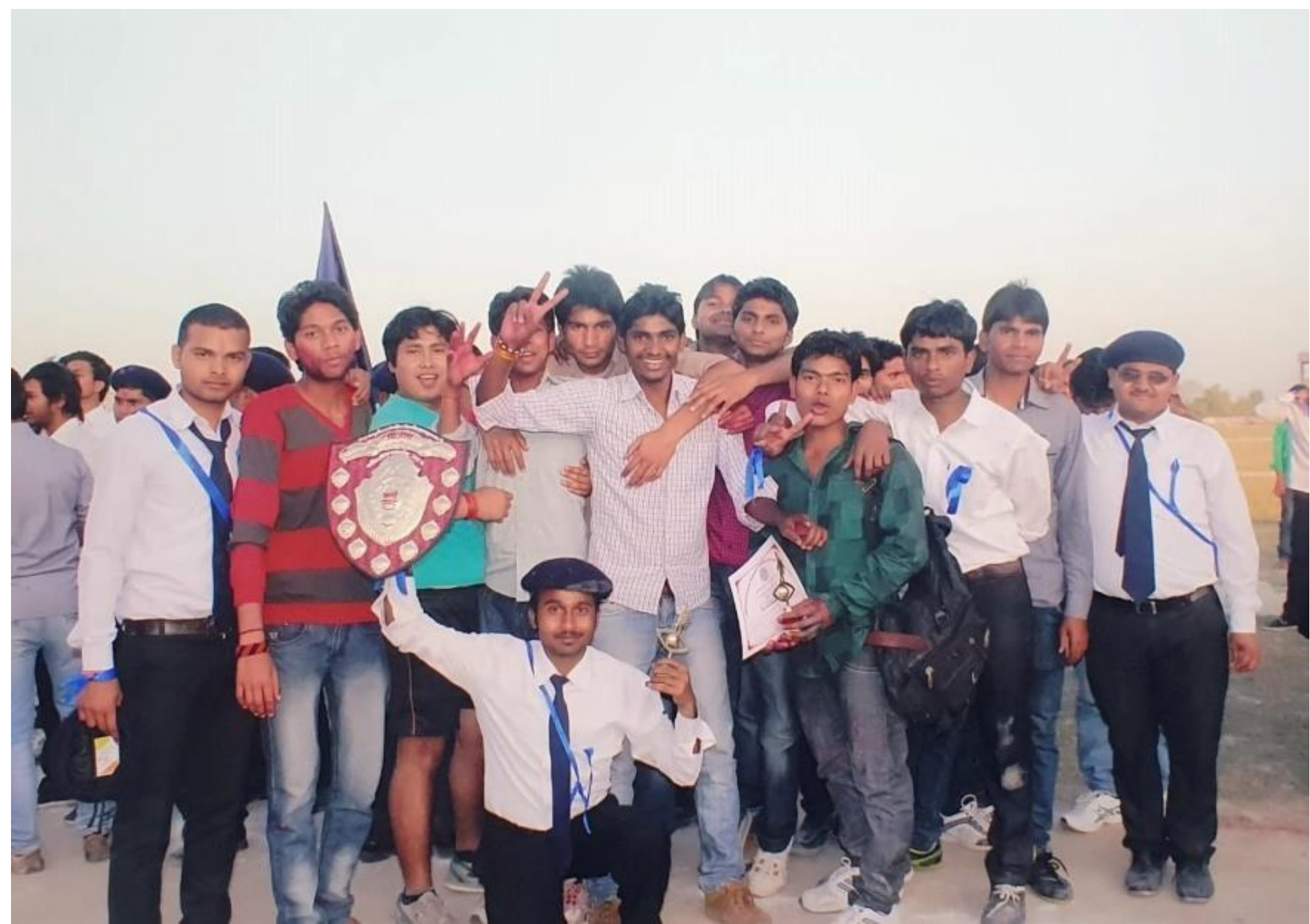
Winner Volleyball on 03 rd March, 2019