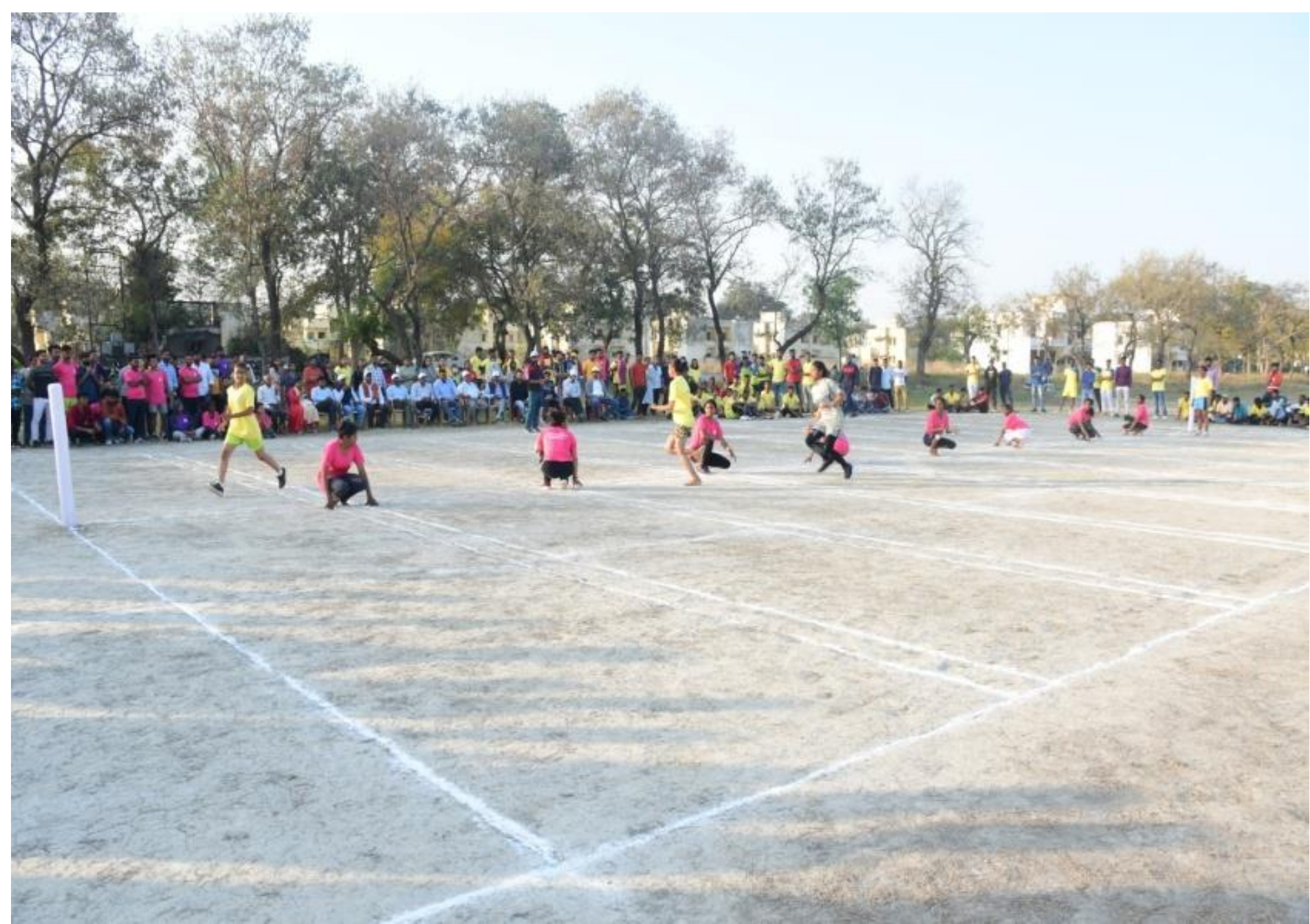
Kho-Kho Match (girls) during annual sports meet on 02 March, 2022