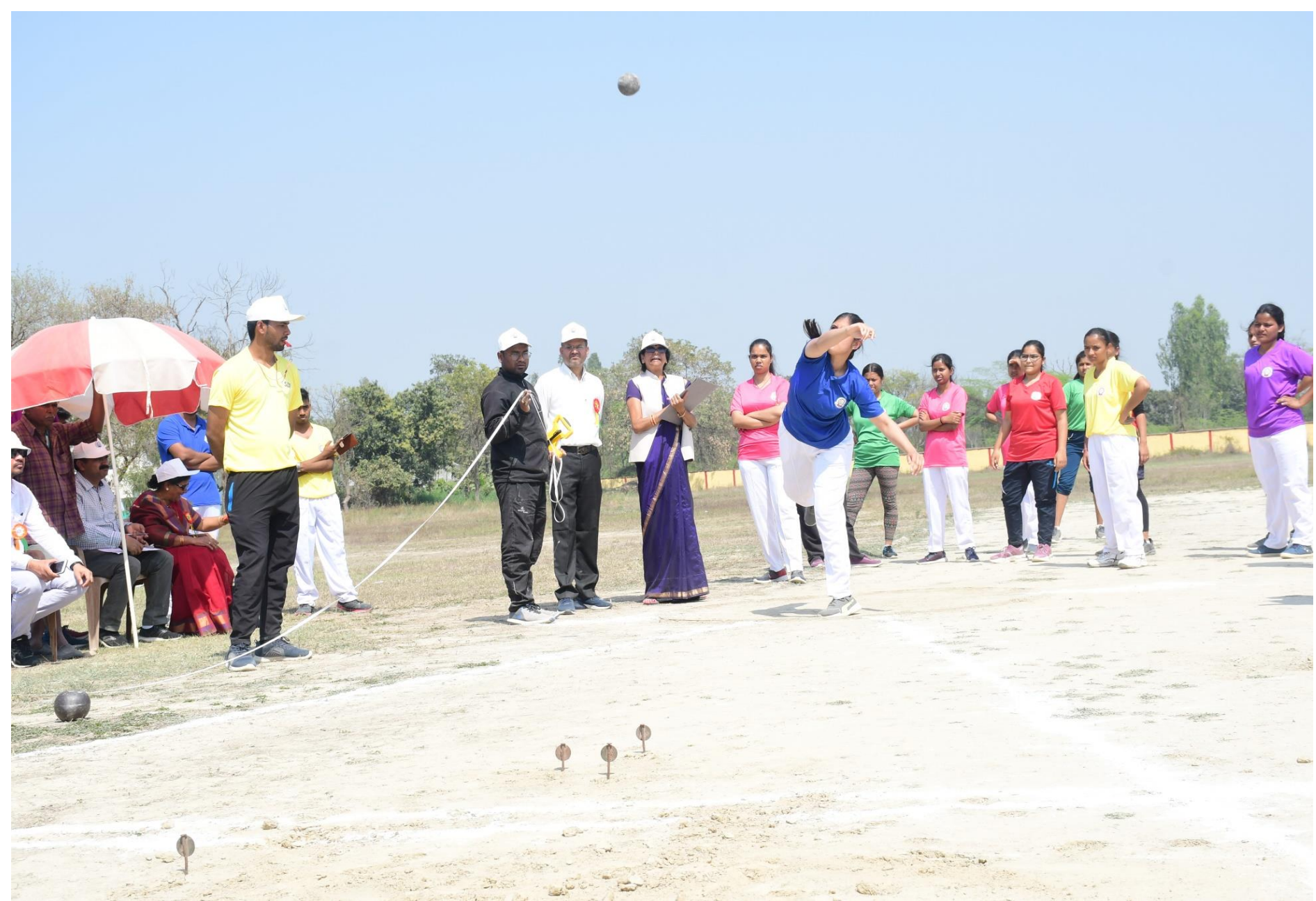
Shot Put throw (girls) on 04 March, 2022