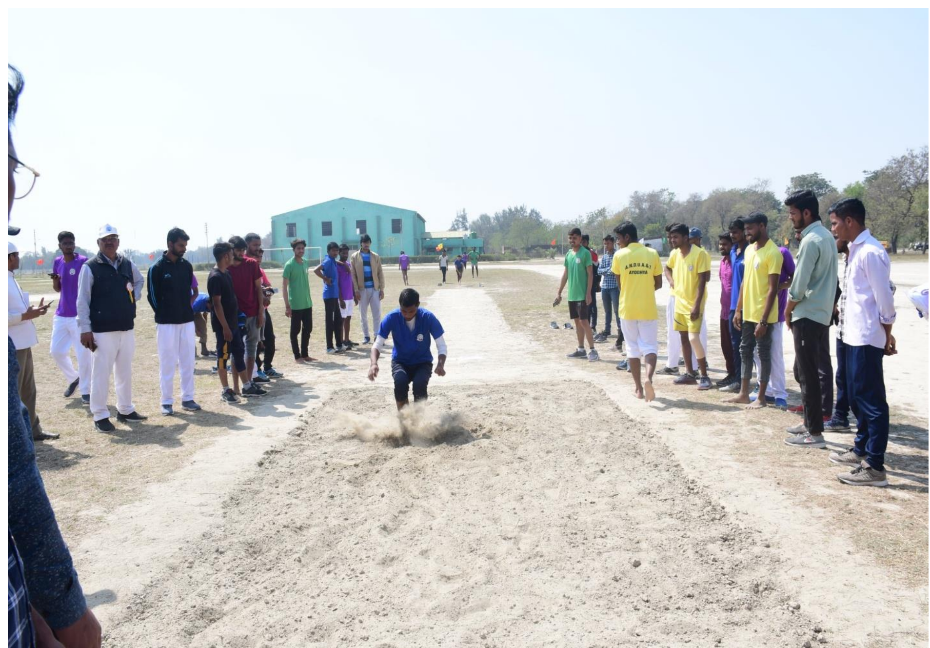
Long Jump (boys) during the sports meet on 04 March, 2022