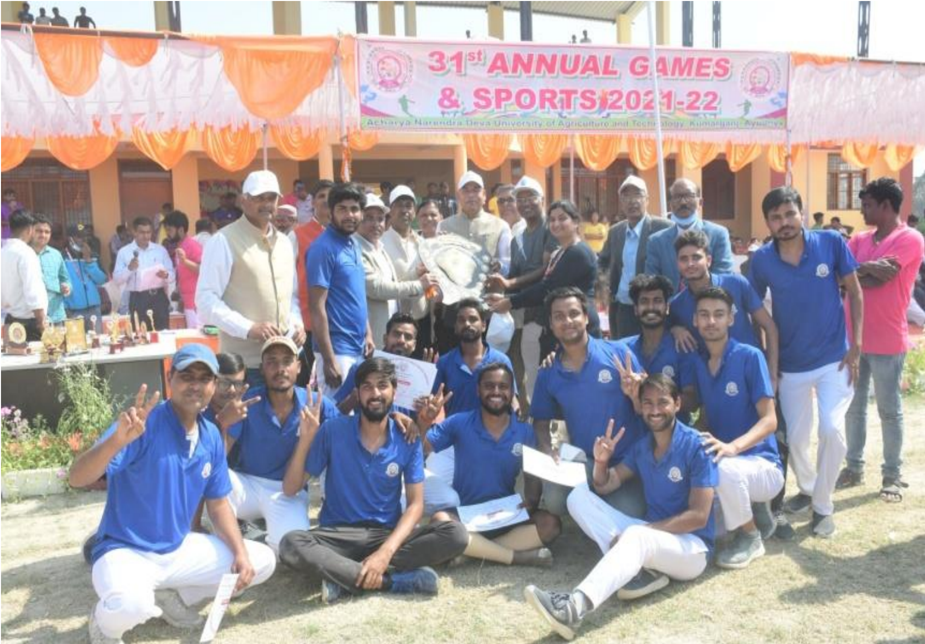
Medal & trophy distributions by Hon'ble Vice- Chancellor on 06 March, 2022