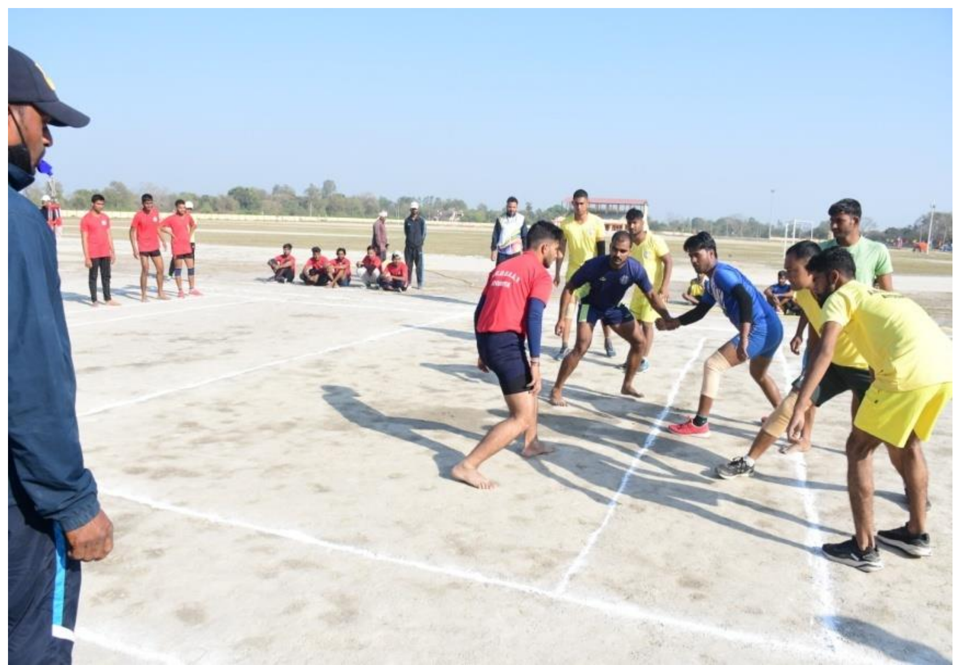
Kabaddi Match (boys) during annual sports meet, 27 February, 2022