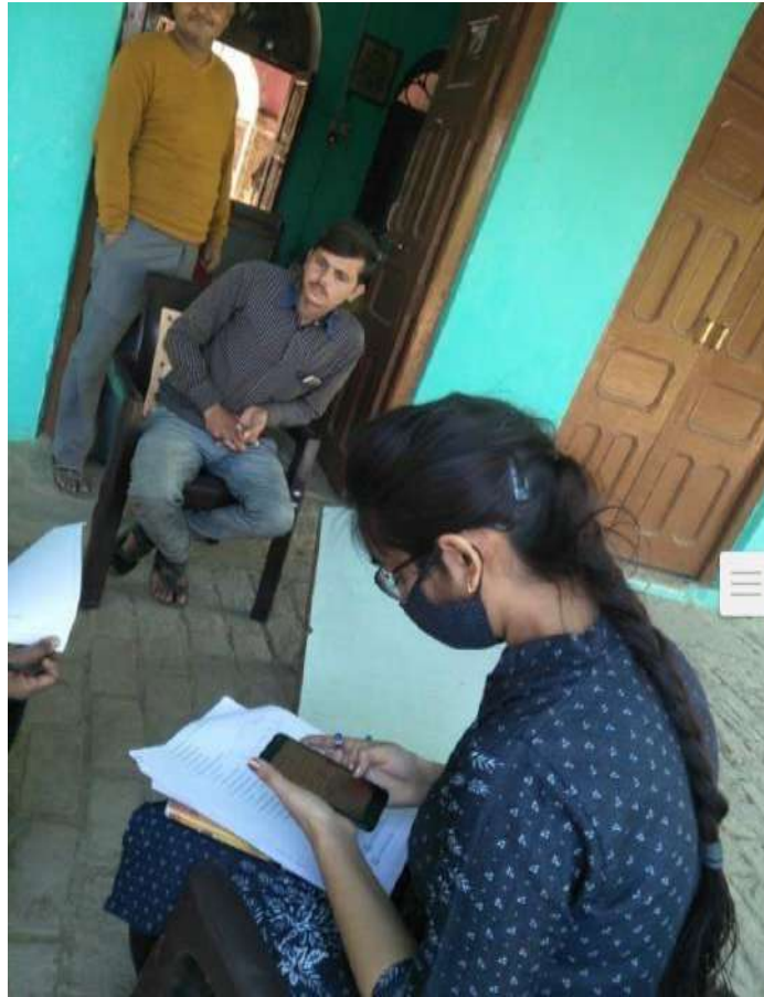
INTERACTION WITH FARMER AND AWARE ABOUT THE IRRIGATION SCHEDULE OF NURSERY DURING COVID-19 PERIOD ON DATED 23 FEBRUARY 2021