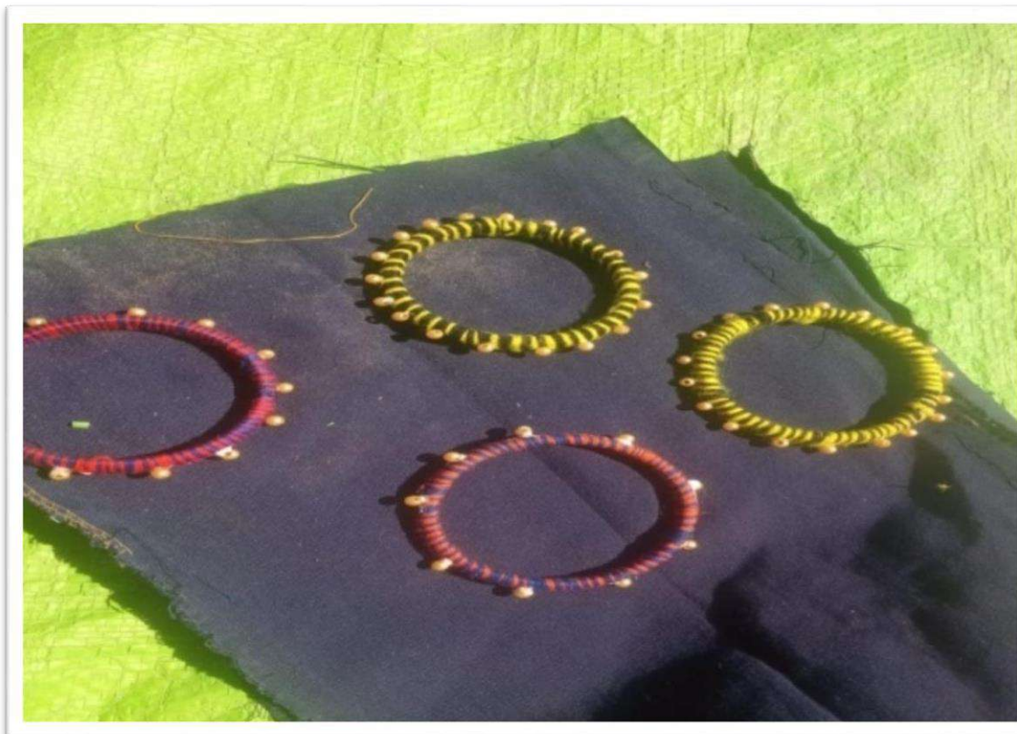
USEFUL MATERIAL PREPARED BY STUDENTS FROM HOUSEHOLD WASTE ON DATED 18 NOVEMEBR 2020