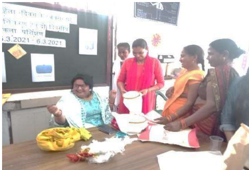
INTERACTION OF EXPERTS ON HANDICRAFTS MATERIALS TO RURAL WOMEN ON DATED 20 MAY 2022