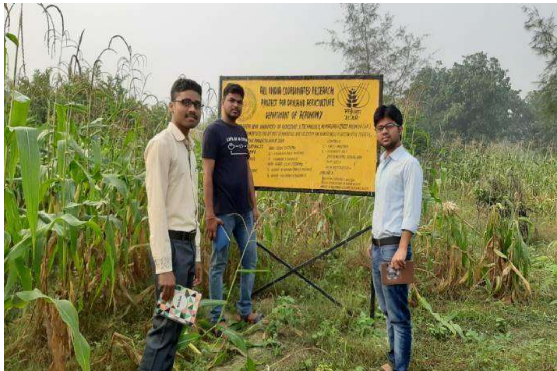
STUDENTS AT AGRONOMY FARM TO UNDERSTAND ON-GOING EXTENSION AND RURAL DEVELOPMENT PROGRAMMES 20 NOVEMBER 2019