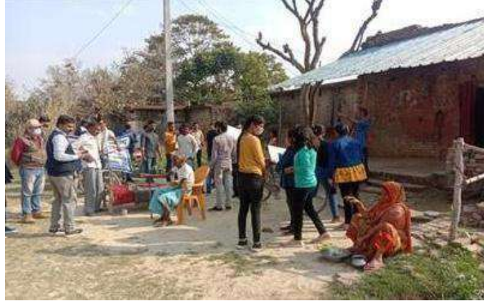
STUDENTS INTERACTED WITH FARMERS ON PROGRESSIVE FARMING OF BANANA ON DATED 18 APRIL 2018