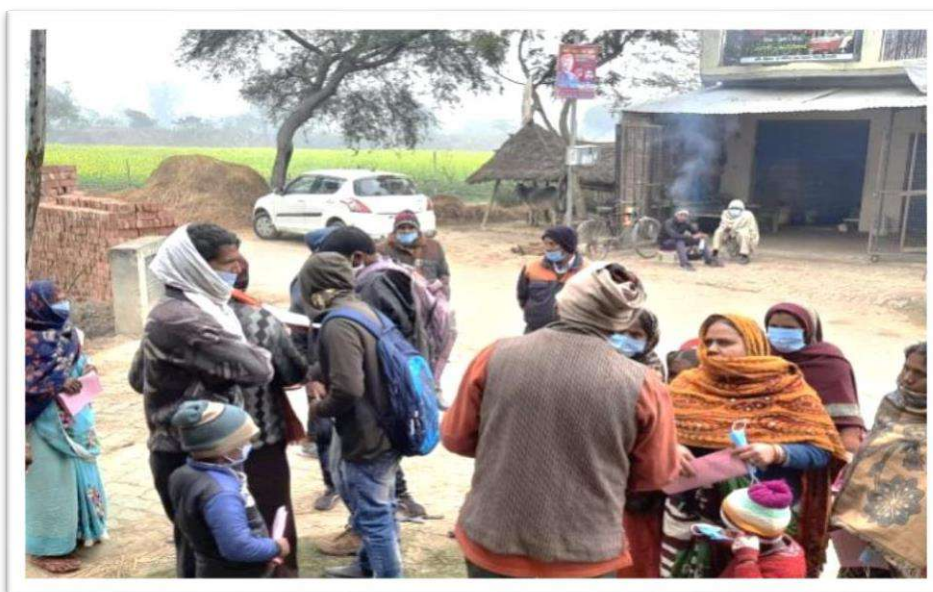
EXPERTS AND STUDENTS AWAREING THE LIVESTOCK OWNERS ON MASTITIS DISEASE IN THE VILLAGE JORIUM, AYODHYA ON DATED 10 FEBRUARY 2021