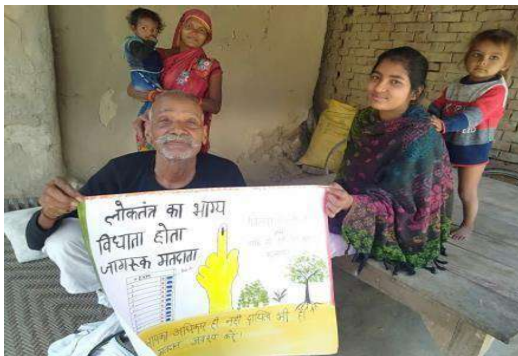
VOTER AWARENESS CAMPAIGN AT NEIGHBOURING VILLAGES FOR 100% POLLING ON DATED 20 OCTOBER 2020