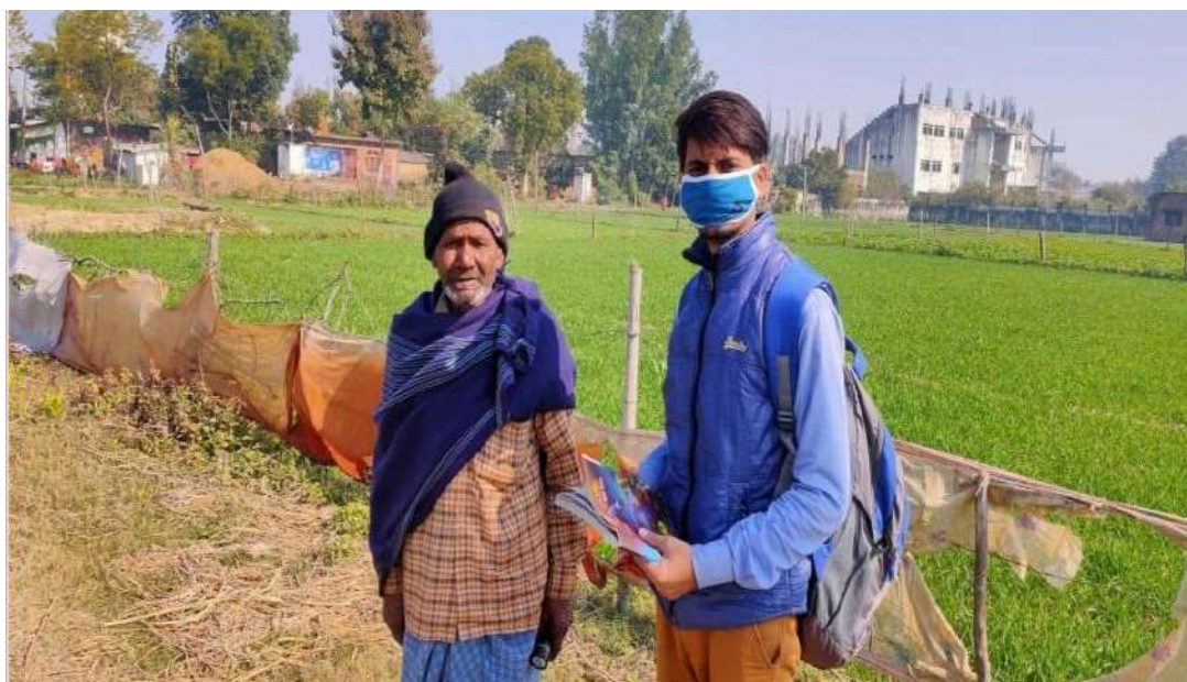
INTERACTION WITH FARMER AT THEIR FIELD AND SHARED KNOWLEDGE ON NURSERY MANAGEMENT DURING COVID-19 PERIOD ON DATED 15 JANUARY 2021