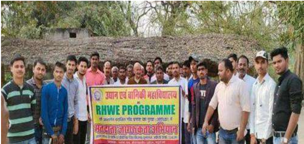
AWARENESS PROGRAMME ORGANIZED BY STUDENTS IN LOCAL VILLAGES ON DATED 25 JANUARY 2018