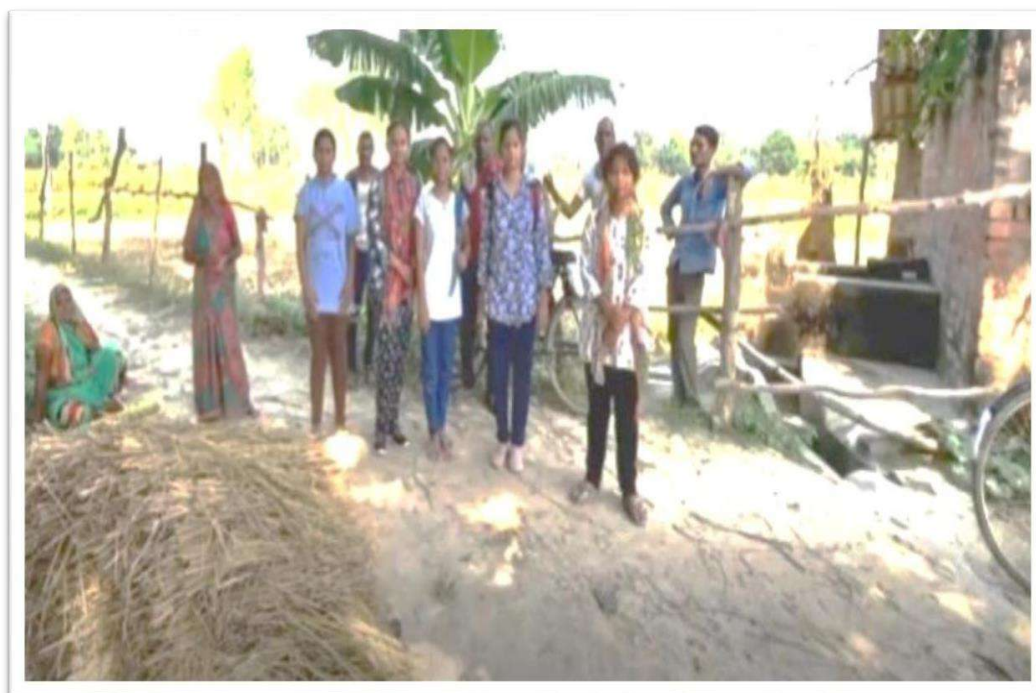
GIRL STUDENTS VISITED THE FARMER FIELD AND THEIR THRESHING FLOOR OF PADDY ON DATED 15 JUNE 2022