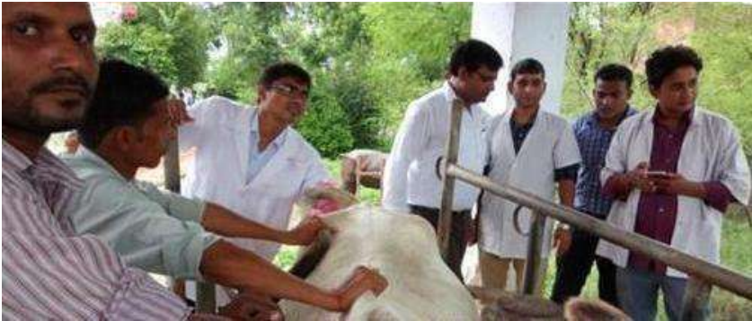
STUDENTS AT THE TIME OF DIAGNOSIS OF GYAENECOLOGICAL DISEASE CATTLE ON DATED 19 AUGUST 2017