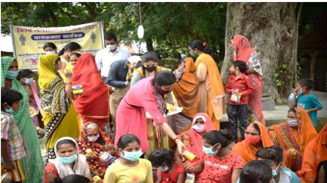
STUDENTS AWAREING THE VILLAGE WOMEN ON WORLD POPULATION DAY (11 JULY 2022)