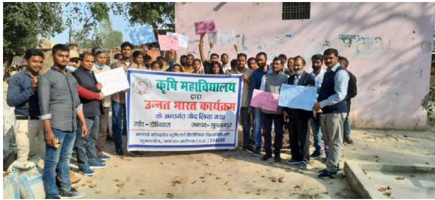
Matdata Jagrukta Abhiyan (Voter Awareness)