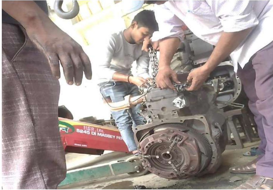
DEMONSTRATION OF ASSEMBLING OF DIESEL ENGINE ON DATED 11 OCTOBER 2017