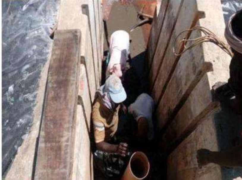
STUDENTS AT THE TIME OF PRACTICING AQUA FARMING ON DATED 8 FEBRUARY 2017

College of Fisheries, a constituent unit, organized In Plant Training Programme on Aqua farming which was scheduled at West Coast frozen Food Pvt. Ltd. A group of B.F.Sc students under the In Plant Training Programme of aquaculture department on 19/02/2018 were recruited to the West Coast frozen Food Pvt. Ltd, Dist-Kumta (Karnataka) Where Intensive culture of Litopenaeus vannamei is practiced. Another group is scheduled at Pancham Aquaculture Farm. Under the In Plant Training Programme of aquaculture department on 08/02/2017 were recruited to the Silver Aqua Research Center, Porbandar, Gujrat. Where semi intensive & Extensive culture of Litopenaeus vannamei was practiced.