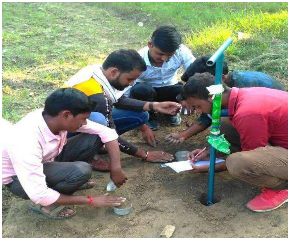
DEMONSTRATION OF MEASUREMENT OF SOIL MOISTURE CONTENT AT FIELD ON DATED 14 JULY 2018