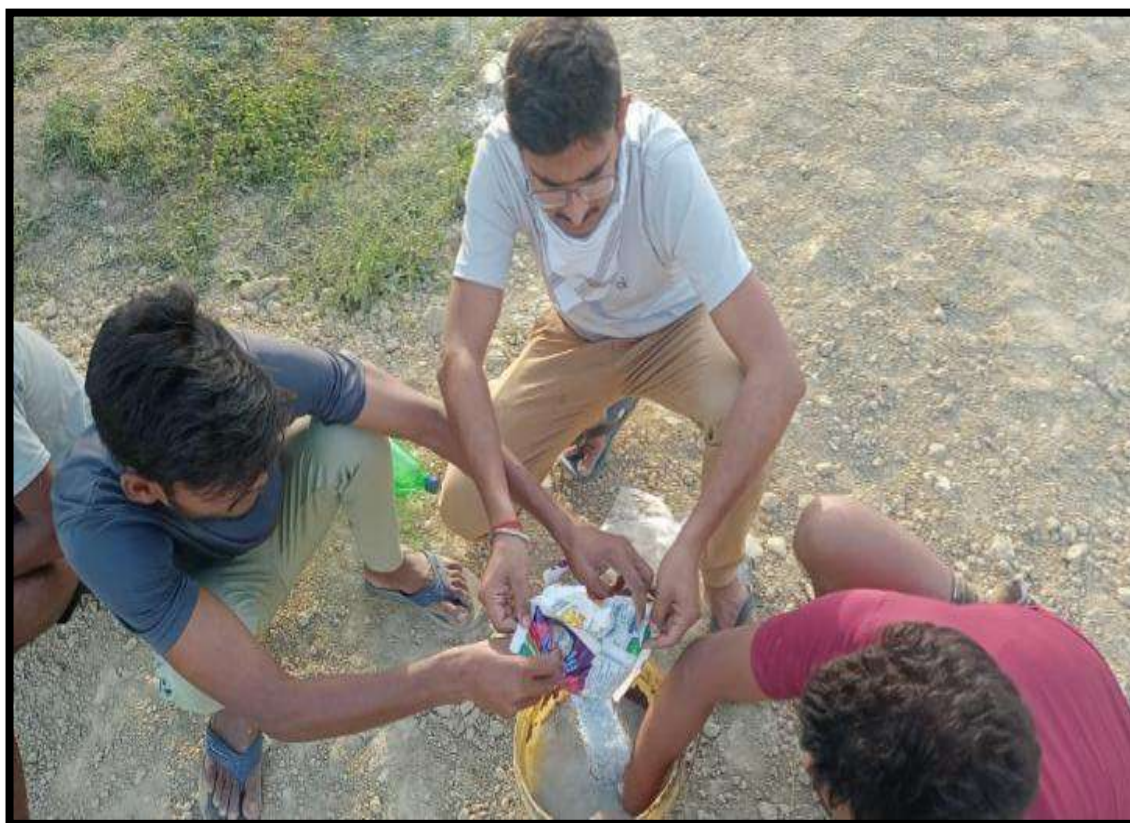
PREPARATION OF OIL SOAP EMULSION FOR REMOVAL OF AQUATIC INSECT ON DATED 4 JULY 2019

The students of College of Fisheries were attached to local Villages farm due to COVID-19. During this village attachment programme they interacted with the small, marginal fish farmers and aqua-preneurer. They also become aware of farmers' problems and provide the solution to fulfill the technological gap regarding management practices