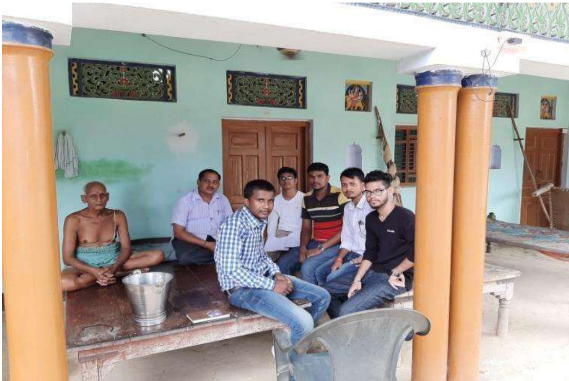
INTERACTION WITH THE FARMERS ON VALUE ADDITION OF CROPS AND DOUBLING OF INCOME ON DATED 6 AUGUST 2019