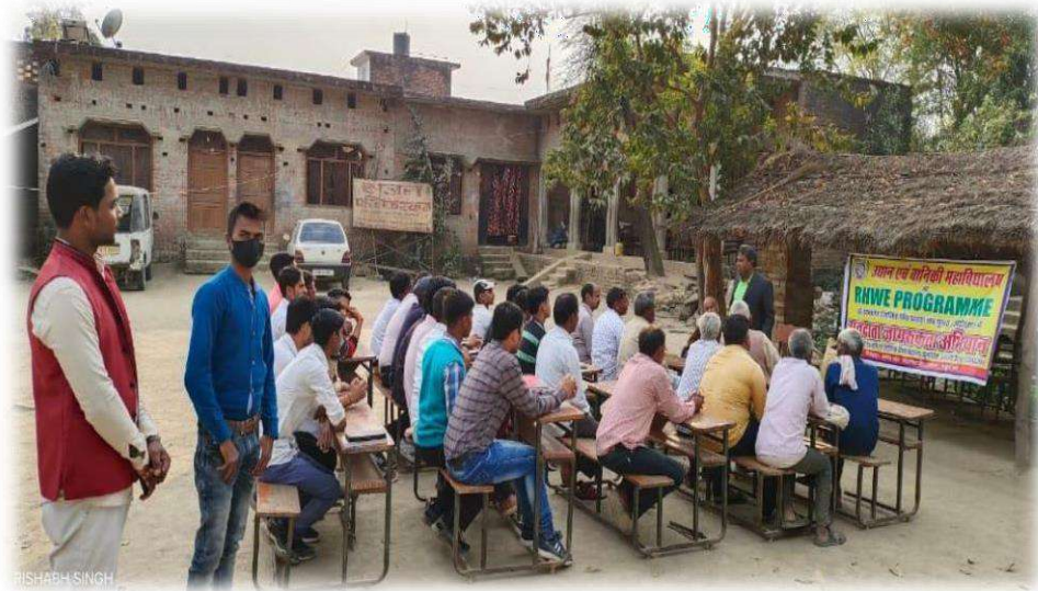
AWARENESS PROGRAMME ON SCIENTIFIC CULTIVATION OF VEGETABLE CROPS ON DATED 5 FEBRUARY 2018

Rural extension activities programme was conducted by B.Sc. (Horticulture) fourth years students of College of Horticulture & Forestry (A constituent unit) at nearby villages of Milkipur block for experiences learning to perform intensive study under the guidance of coordinator and teachers for outreach activities on farmers field. Through the programme, students had organized the different activities for capacity building of farmers especially on horticultural crops (vegetables/fruits/spices/flowers) to enhance the livelihoods of farmers in nearby villages. Emphasis was given as per present status of village along with causes of poor yield/income and their solutions and also guided and aware on social issues existing in rural areas with camp or kisan gosthi with involvement of Gram pradhan.