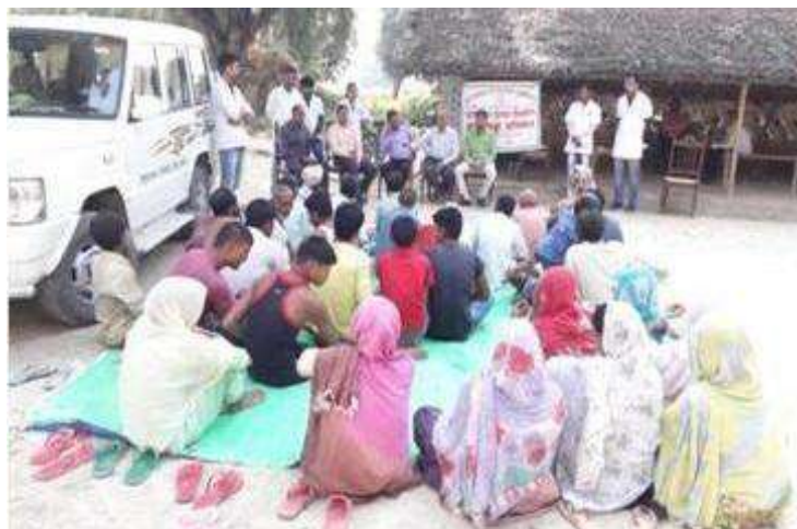
VACCINATION AWARENESS CAMPAIGN AT VILLAGE PURA (SUMERPUR), AKMA FOR FARMERS ON IMPORTANCE OF VACCINATION ON DATED 11 OCTOBER 2018

College of Veterinary Science and Animal Husbandry (A constituent unit) organized an awareness campaign program on FMD prevention and control with special reference to Vaccination protocol at village Pura (Sumerpur) on 11-10-2018 with the state Veterinary Doctors. They provided the vaccine which was used to animals and trained to farmers on various merits of vaccination through the goathi/ camp. In this programme, the students had shared the information on basic surgical treatment of livestock and created awareness in formers about economic loses and benefit of vaccination. Due attention was given to sick animals/ unhealthy livestock of formers at doorstep in neighbouring villages.