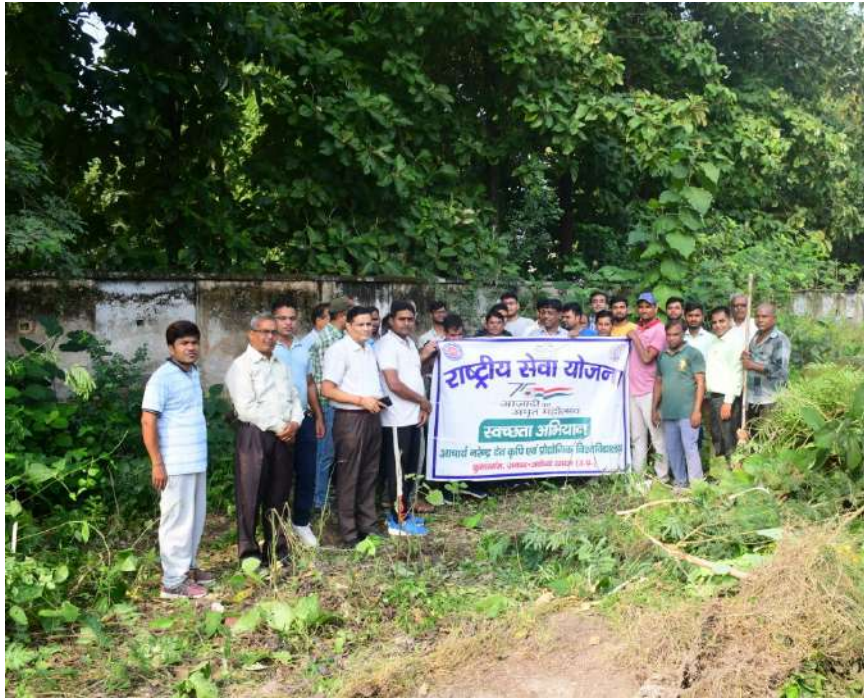
SWACHCHH BHARAT ABHIYAN