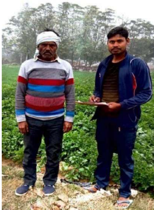
INTERACTION WITH FARMER AT THEIR FIELD TO AWARE ABOUT CROP PROTECTION DURING COVID-19 PERIOD ON DATED 8 FEBRUARY 2021