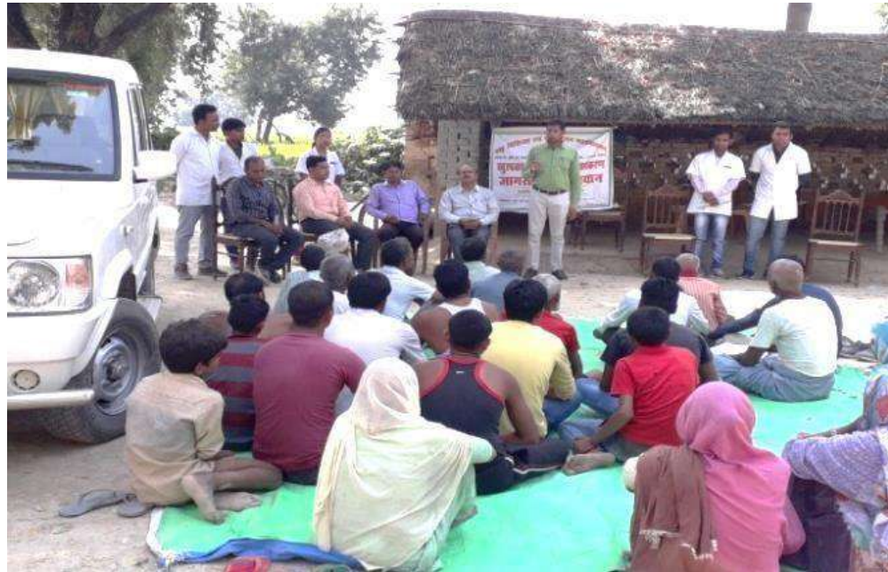
CAPACITY BUILDING PROGRAMME ORGANIZED BY STUDENTS ON FMD PREVENTION AND CONTROL ON DATED 11 OCTOBER 2018