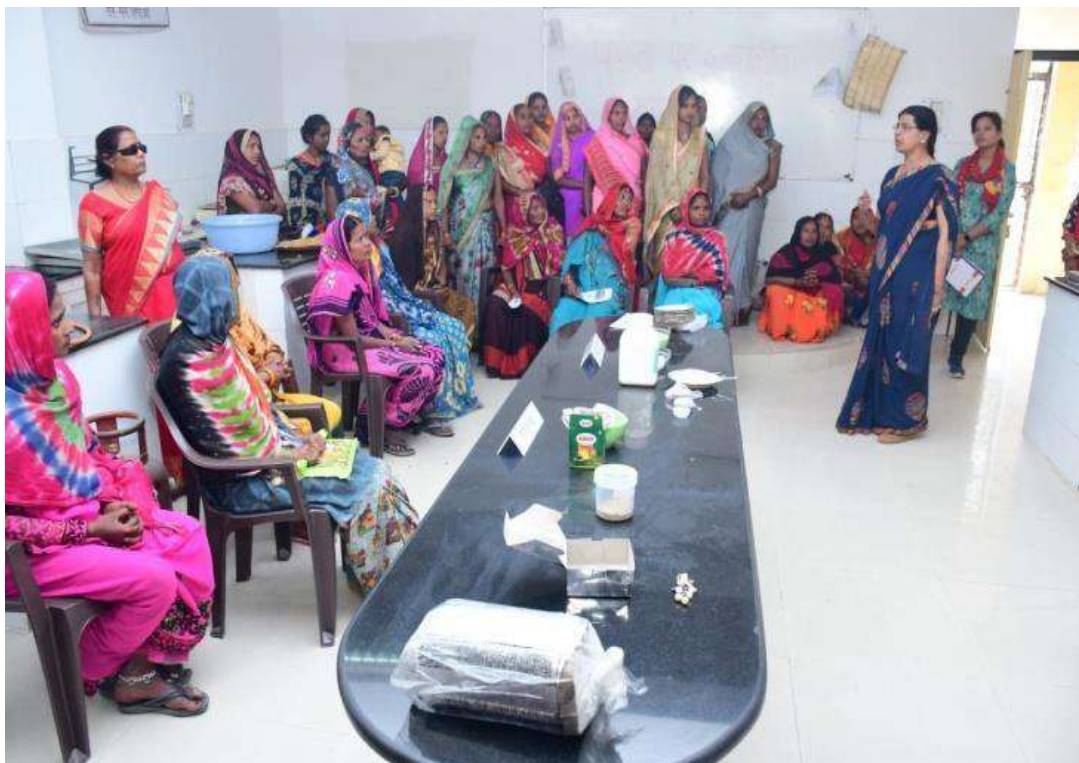
STUDENTS ORGANISED PROGRAMME ON HEALTH ISSUES DURING WOMEN HEALTH AWARENESS CAMP IN VILLAGES ON DATED 22 FEBRUARY 2020