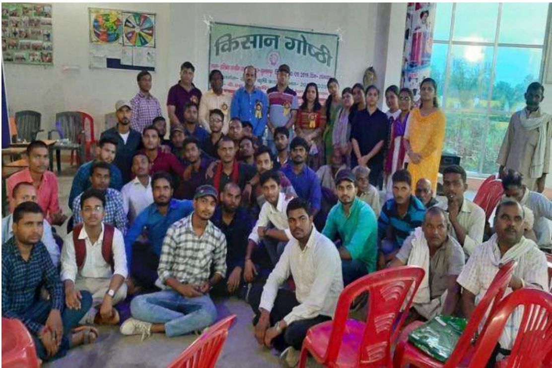
KISAN GOSTHI ON VALUE ADDITION AND DOUBLING THE FARMERS INCOME ON DATED 7 OCTOBER 2019