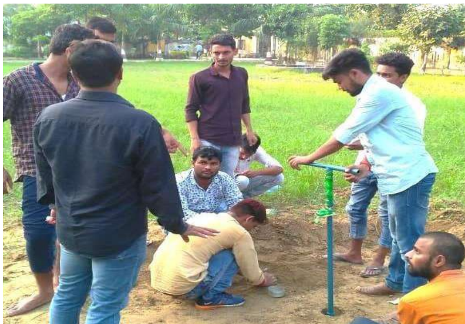
COLLECTION OF SOIL SAMPLE ON DATED 14 JULY 2018