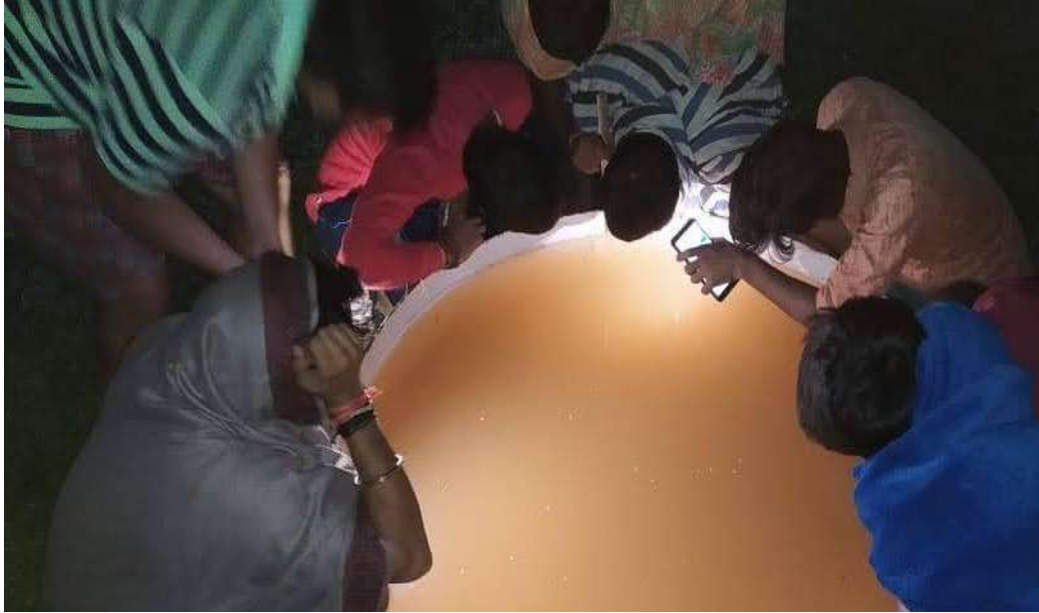
STUDENTS PRACTICING FOR VIEW OF PAN EVAPORIMETER ON DATED 4 FEBRUARY 2021