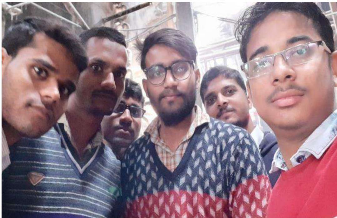
STUDENTS VISITED AT SUGAR MILLS FOR REMEDIAL KNOWLEDGE ON VALUE ADDITION ON DATED 3 JANUARY 2020