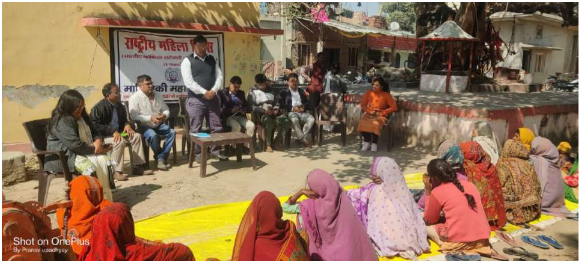
Awareness among the community about the gender issues