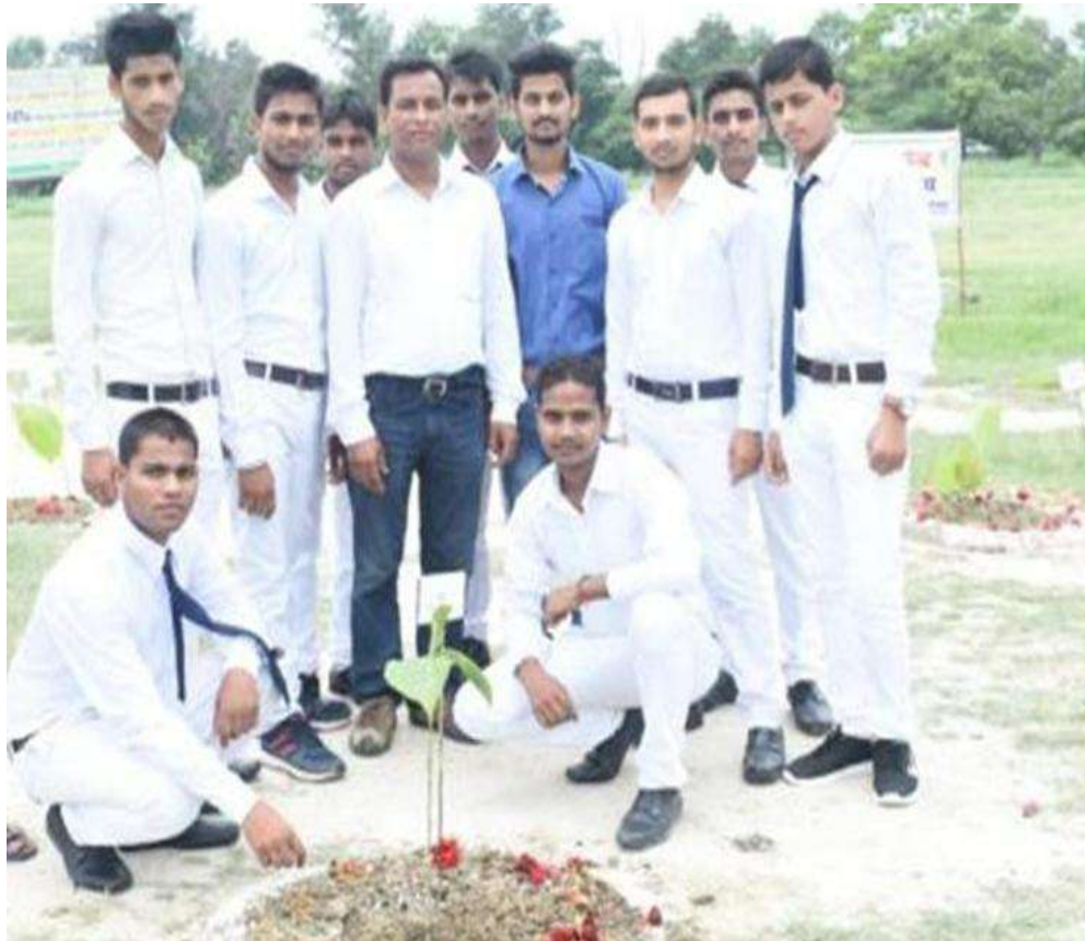
PLANTATION BY STUDENTS AT FARMERS FIELD IN VILLAGES OF MILKIPUR BLOCK ON DATED 21 JUNE 2017