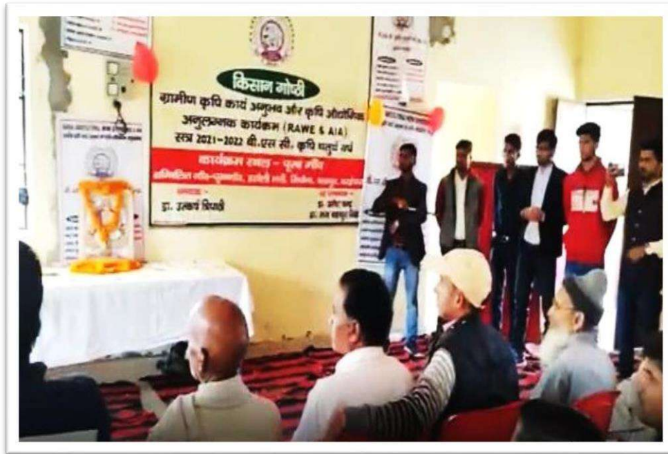
STUDENTS DURING THE KISAN GOSTHI TO ACQUAINT THE FARMERS ON SCIENTIFIC CULTIVATION OF CROPS ON DATED 26 NOVEMBER 2021