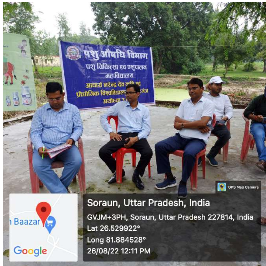
Animal health camp