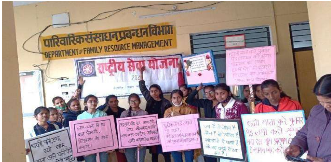
AWARENESS PROGRAMME ON BETI BACHAO AND BETI PADHAO SWACHCH BHARAT ABHIAYAN AT CAMPUS ON DATED 16 MARCH 2021