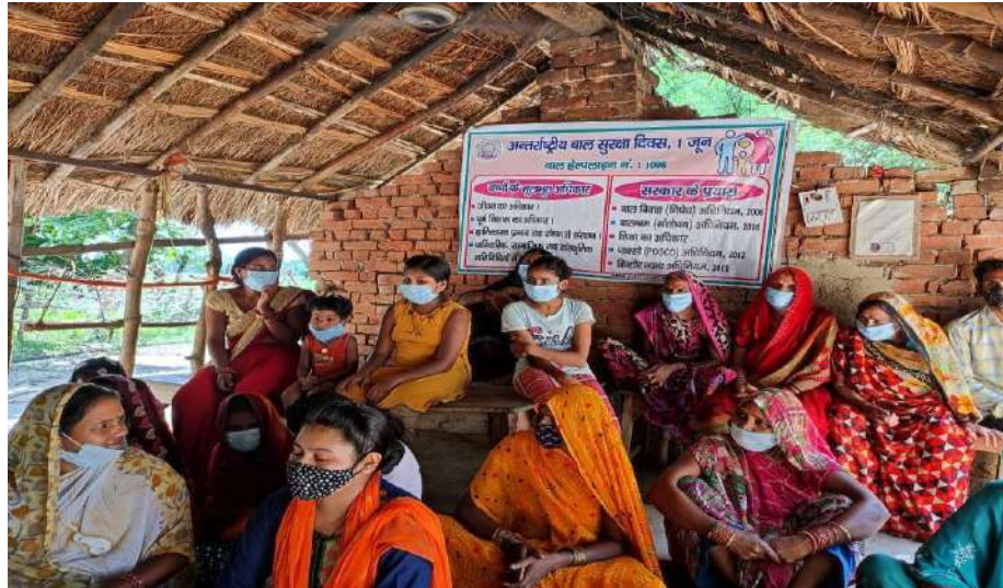
AWARENESS PROGRAMME ORGANIZED ON INTERNATIONAL CHILD PROTECTION DAY ON DATED 1 JUNE 2021

The International Child Protection Day organized by the students of Department of Human Development and Family Studies in Lal ka Purwa village, Ayodhya to aware the rural women on child rights, sexual abuse. Students also discussed the ways to achieve total well beings of children.