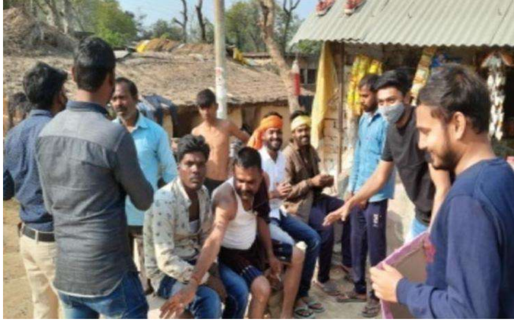
INTERACTION ON WEEDICIDE APPLICATION WITH FARMERS UNDER THE EXPERT SUPERVISION ON DATED 20 SEPTEMBER 2017