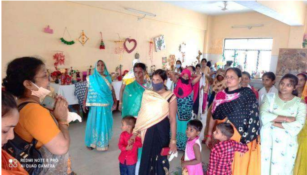
DEMONSTRATION CONDUCTED BY STUDENTS ON HANDICRAFTS MATERIALS FOR RURAL WOMEN ON DATED 20 MAY 2022

In this training students guided the rural women to enhance their existing knowledge on handicraft. They imparted practical skills to rural women for preparing decorative handicraft items and earning money through its sale to improve their standard of living