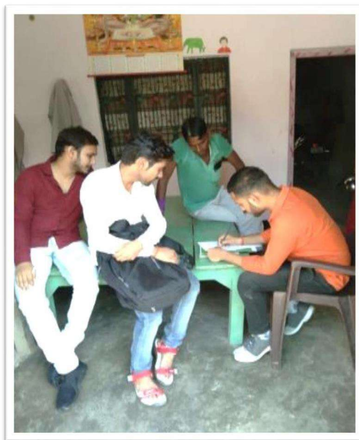
STUDENTS INTERACTING WITH FARMER TO AWARE ABOUT THE BENEFIT OF SUMMER PLOUGHING OF FIELD ON DATED 5 JULY 2021

College of Agriculture, a constituent unit of the university organized extension programmes were conducted for small & marginal farmers in neighbouring villages of university held at Milkipur Block in session 2021-22. This student extension programmes were conducted with an objective to generate awareness on seed treatment, Paddy line transplanting, balanced fertilizers and to expose farmers about best practices of majors crops to get maximum yields from this major kharif crop. Additionally, students had conducted the Kisan Gosthi to reach the maximum farmers of neighbouring villages.