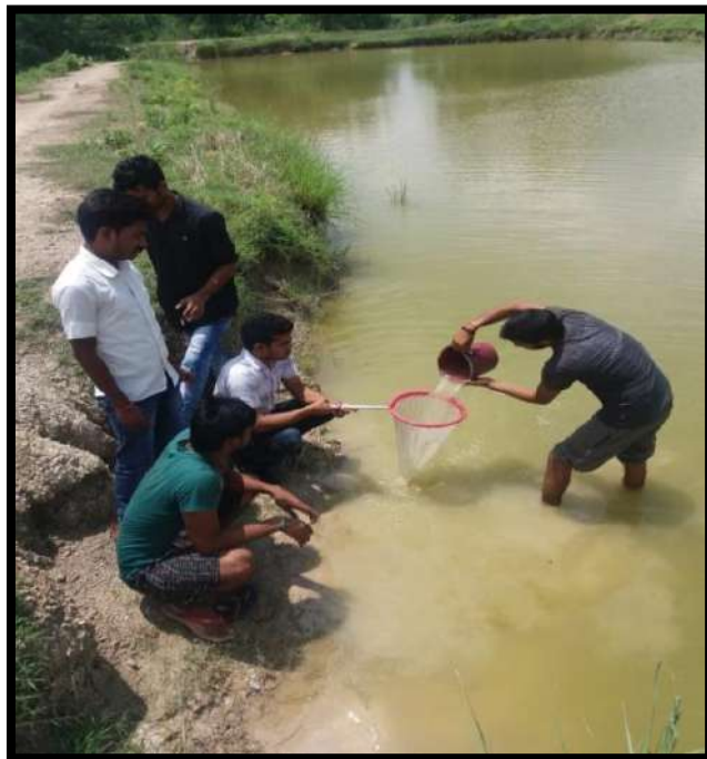
STUDENTS DURING COLLECTION OF PLANKTON BY PLANKTON NET ON DATED 26 JULY 2019

The students of the College of Fisheries Science (A constituent unit) were attached to their local village due to COVID-19. During this village attachment programme they interact with the small, marginal fish farmers and aqua-preneurer. They also become aware of farmers' problems and provide the solution to fulfill the technological gap regarding management practices.