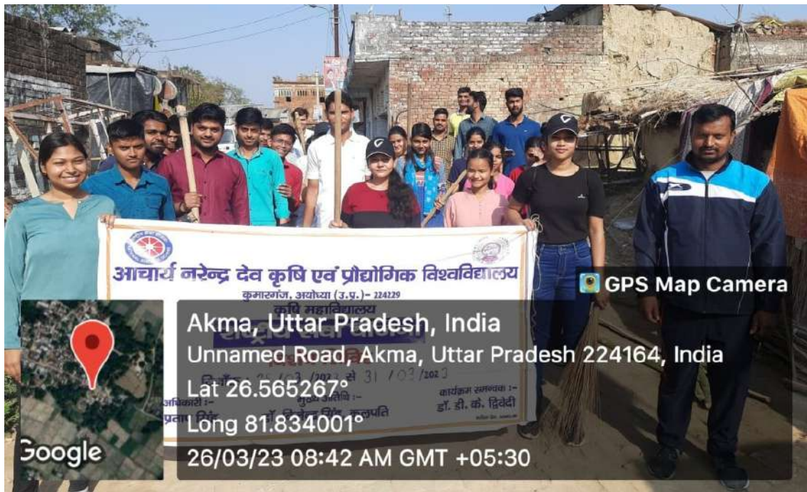
Cleanliness campaigning by NSS students at Akma village near by University