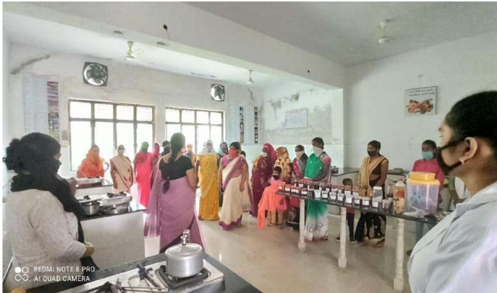
TRAINING PROGRAMME ORGANIZED BY STUDENTS ON PAPAYA PROCESSING ON DATED 7 JANUARY 2021

A training on papaya and amla processing was conducted for rural women on 07 January 2021. In this training various products were prepared by students from raw and ripe papaya like jam, jellies and laddos etc. Amla based products like amlajam, amla pickle and amla jellies etc. were prepared.