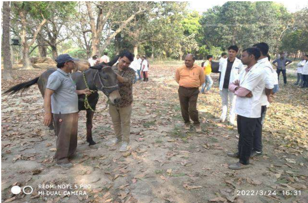
EQUINE HANDLING AND RESTRAINING CAMP BY THE STUDENTS AT FIELD ON DATED 24 MARCH 2022