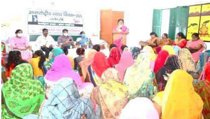
INTERACTION OF STUDENTS WITH RURAL WOMEN AT WORLD DAY FOR INTERNATIONAL JUSTICE ON DATED 17 JULY 2021

World Day for International Justice was celebrated on 17 July 2021 in village Birauli Jham, Block Milkipur to aware the women on their rights, role of women commission and its schemes and programs, women safety and security. The program was organized by the students of department of Family Resource Management & Consumer Science.