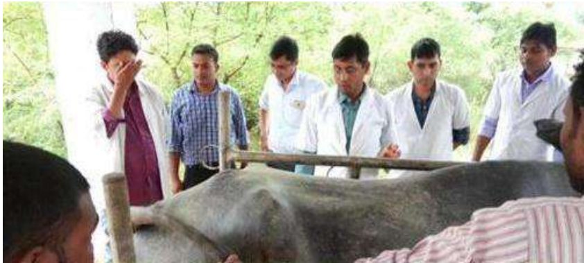
STUDENTS AT THE TIME OF SURGICAL TREATMENT OF CATTLE ON DATED 19 AUGUST 2017