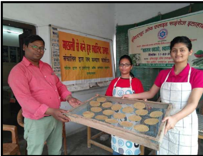
VALUE ADDITION OF FISH BY PREPARING FISH PAPAD AND OTHER PRODUCTS ON DATED 17 MARCH 2019