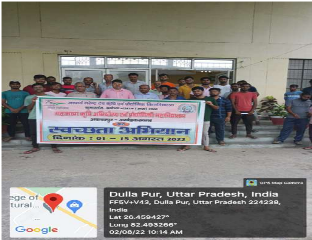
Cleanliness campaign by faculty and students of College of Horticulture & Forestry