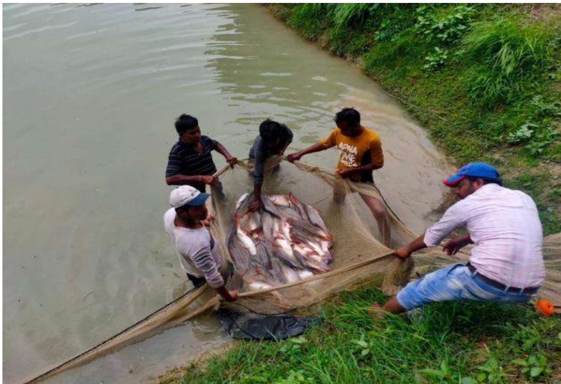
INSTALLATION OF HAPA FOR COMMON CARP ON DATED 17 MARCH 2020