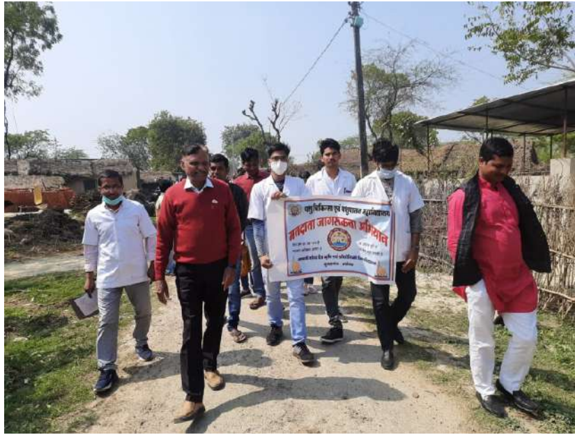
Matdata Jagrukta Abhiyan (Voter Awareness)