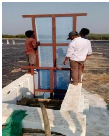
PACKING OF THE SLUCE GATES OF POND ON DATED 3 JULY 2018