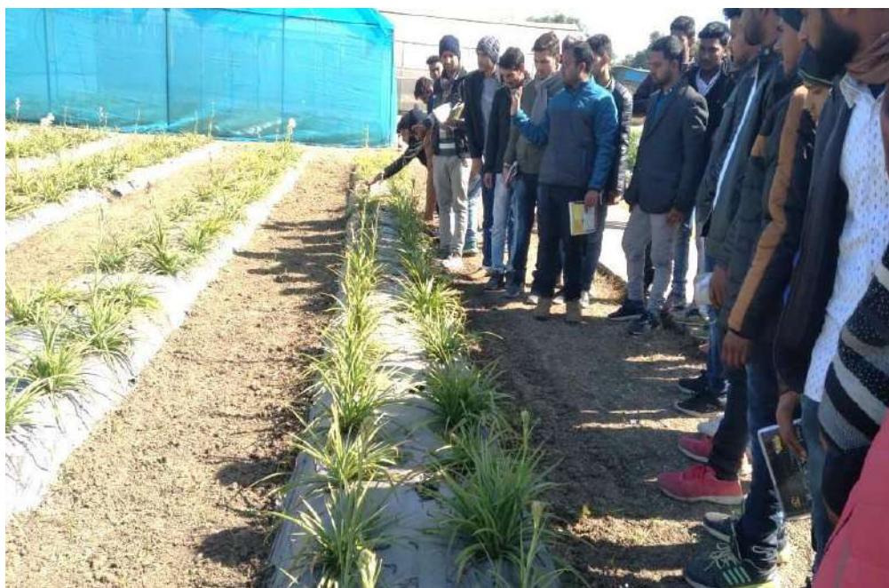
EXPOSURE VISIT OF FARMERS BY STUDENTS AT ALOE VERA FIELD ON DATED 27 NOVEMBER 2018