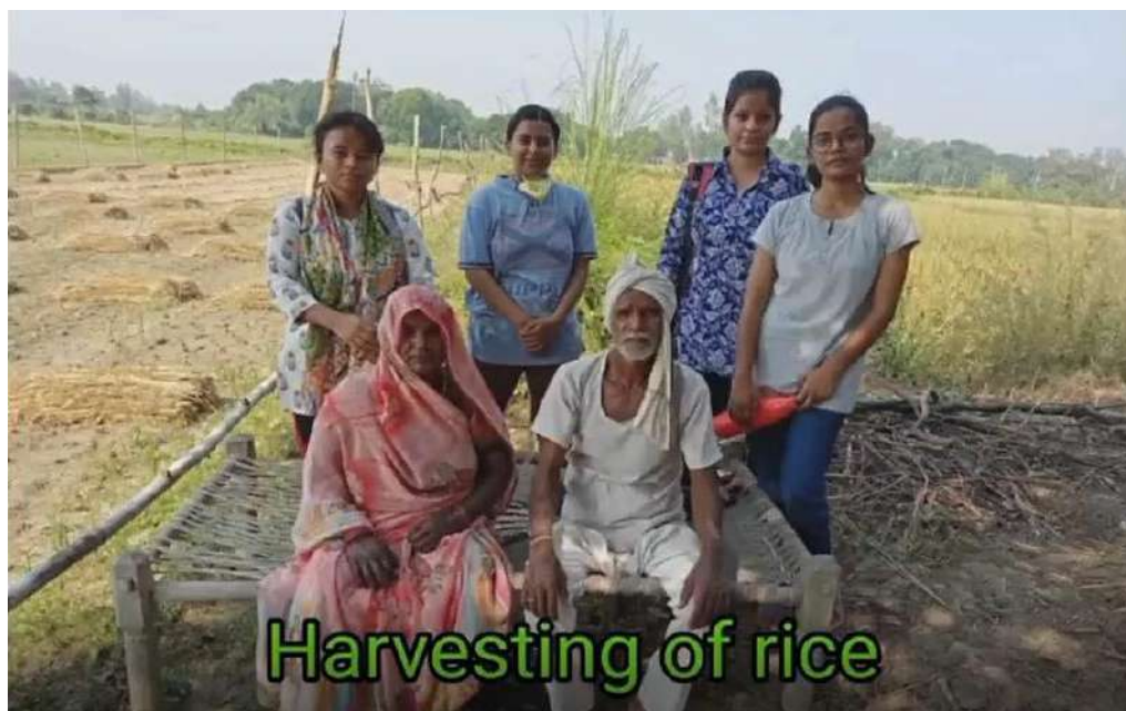
GIRLS STUDENT INTERACTING WITH FARMER FAMILY TO AWARE ON SCIENTIFIC CULTIVATION OF PADDY ON DATED 15 JUNE 2022