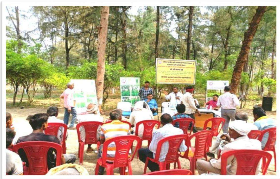
STUDENTS INTERACTION WITH FARMERS AND CAPACITY BUILDING ON IMPORTANCE OF AGROFORESTRY ON DATED 5 JULY 2021