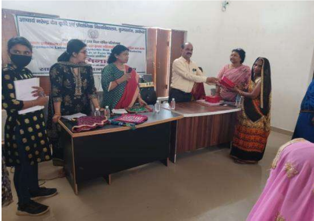
WOMEN HEALTH AWARENESS CAMP FOR GOOD HEALTH MANAGEMENT IN VILLAGES ON DATED 15 MARCH 2020