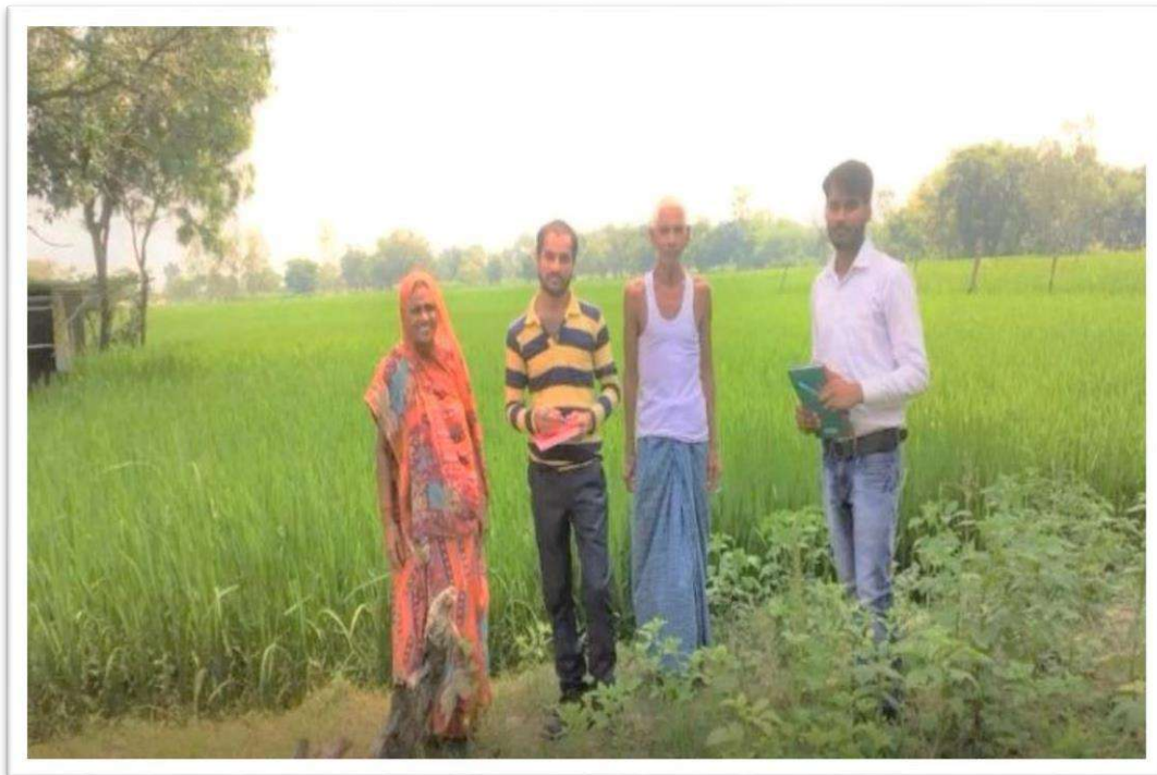
STUDENTS INTERACTING WITH FARMERS AT THEIR FIELD ON DATED 27 SEPTEMBER 2021