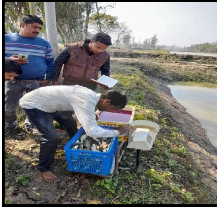
WEIGHING OF HARVESTED FISH BY THE STUDENTS ON DATED 5 OCTOBER 2020

The students of College of Community Science, a constituent unit , demonstrated the preparation of value-added products from waste during the extension programme “Preparation of Best Out of the Waste” conducted in Joriyam village. Recycling helps in processing waste or used products into useful or new products. Students used waste material of household and converted it into useful products.