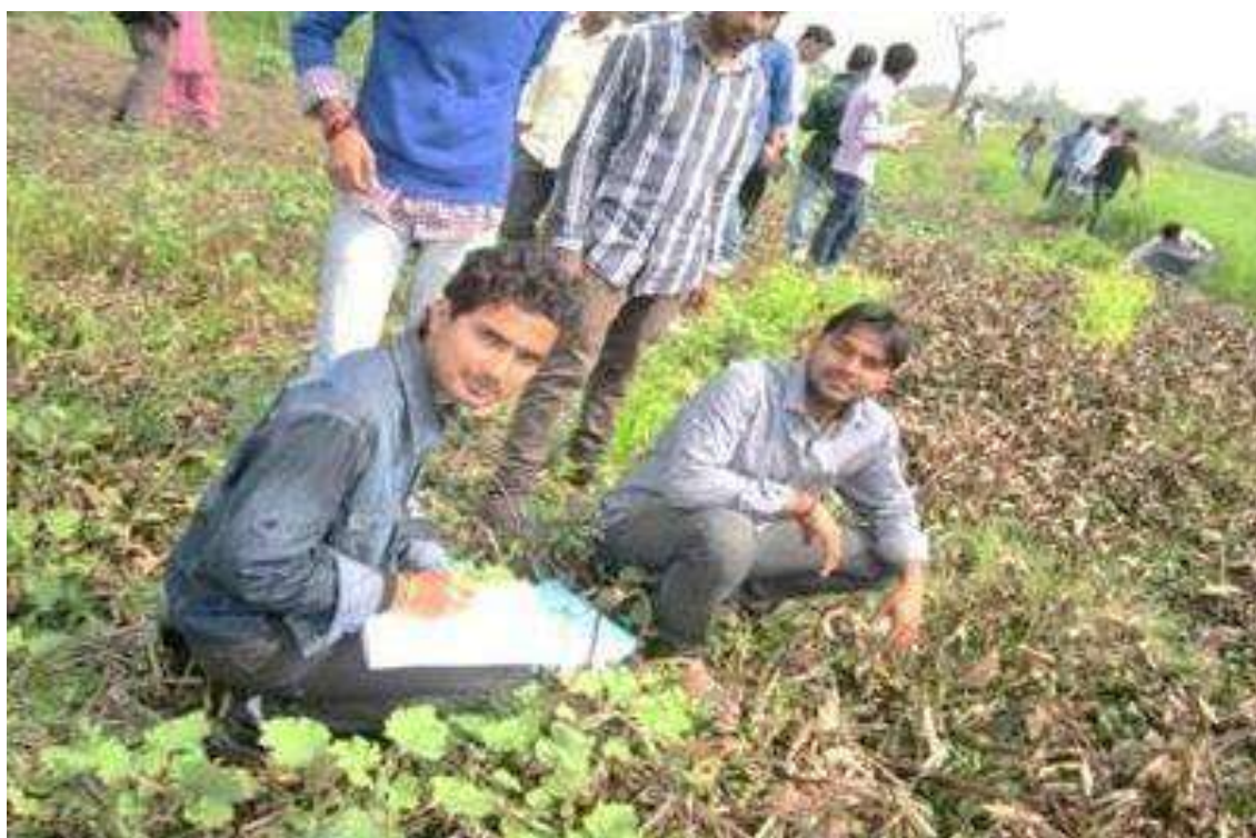
AWARENESS PROGRAMME ON REMOVAL OF AQUATIC WEED AT ATANAGAR, GOVINDPUR ON DATED 23 NOVEMBER 2018