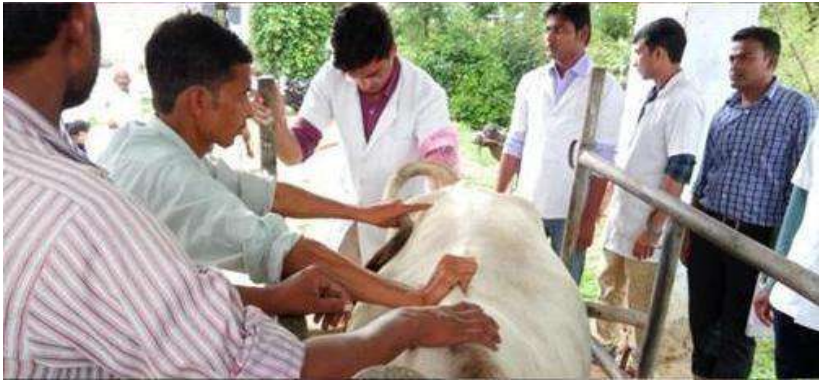
STUDENTS AT THE TIME OF SURGERY OF INFECTED CATTLE CATTLE ON DATED 19 AUGUST 2017