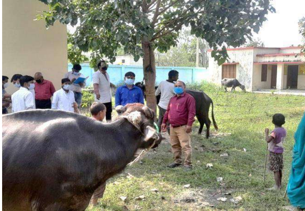
INTERACTION WITH VILLAGERS ON ANEMIA DISEASE IN ANIMALS ON DATED 30 OCTOBER 2021