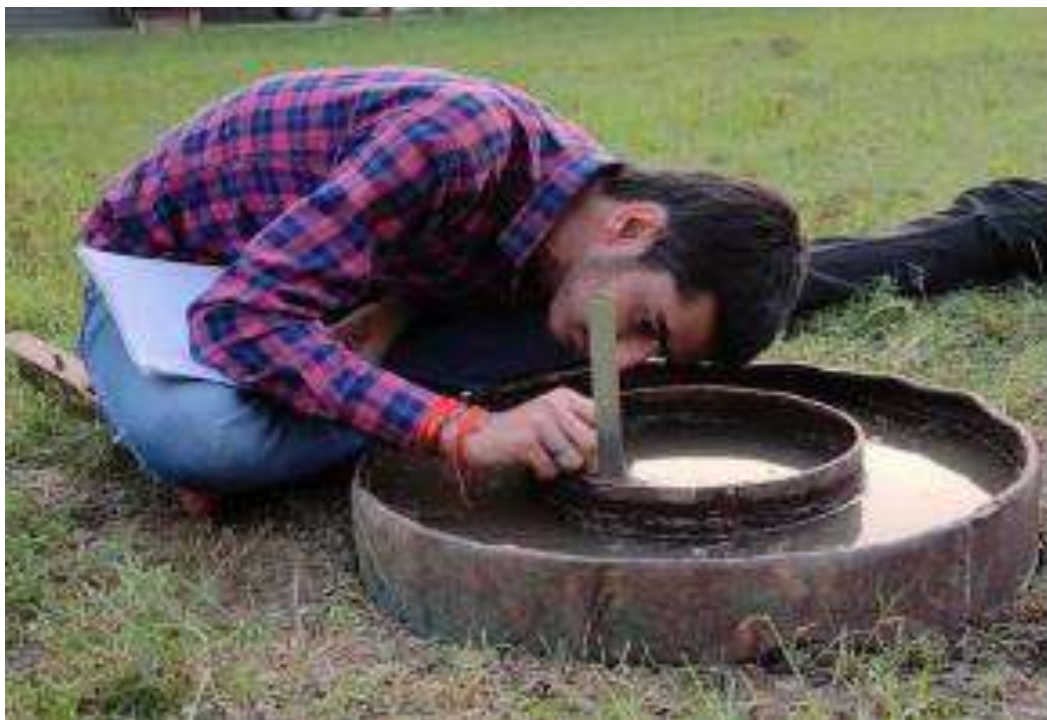
MEASUREMENT OF INFILTRATION ON DATED 6 JULY 2022