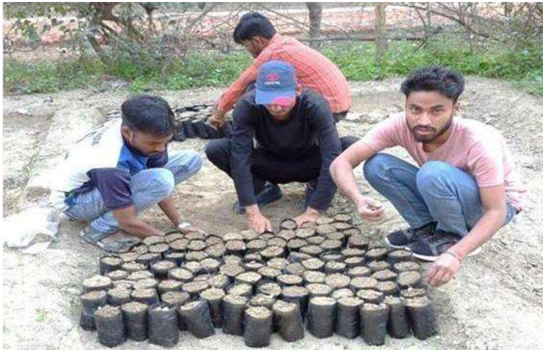
SKILLING OF FARMERS ON POLYBAG FILLING BY STUDENTS AT FIELD ON DATED 8 MARCH 2018