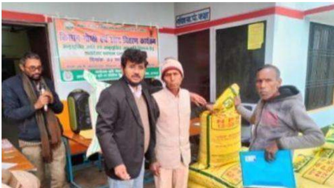
FERTILIZER DISTRIBUTION TO NEIGHBOURING VILLAGERS OF MILKIPUR BLOCK ON DATED 17 JANUARY 2018