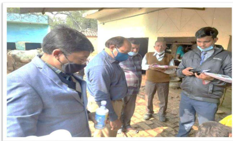
DURING MASTITIS DISEASE AWARENESS CAMP IN NEIGHBOURING VILLAGES BY EXPERT & STUDENTS ON DATED 22 JANUARY 2021