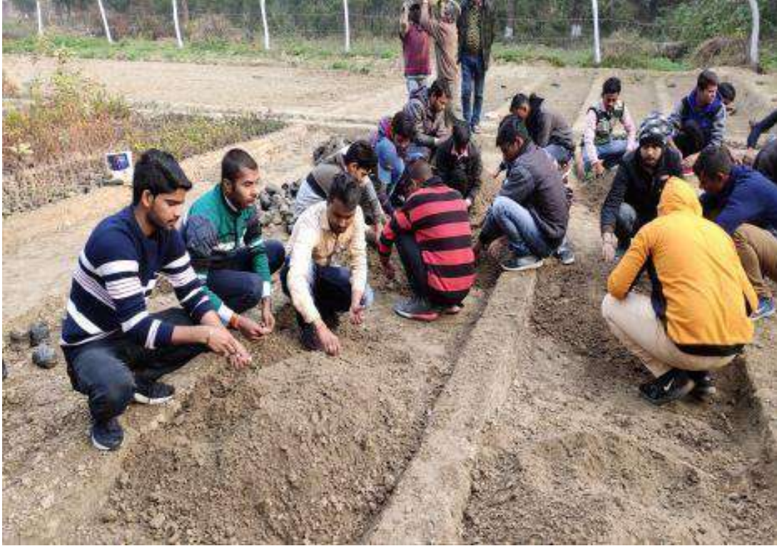
NURSERY PREPARATION BY STUDENTS AT FARMERS FIELD IN VILLAGES OF MILKIPUR BLOCK ON DATED 12 FEBRUARY 2018