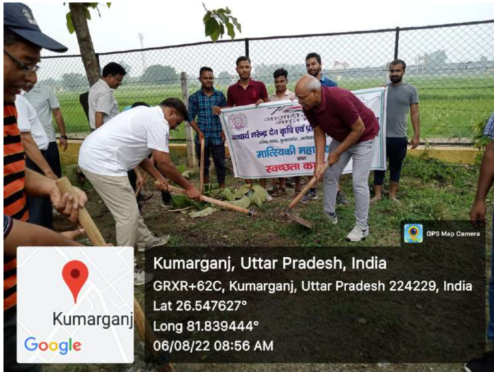
Hon'ble Vice Chancellor, Dean College of Fisheries and Students together participating in cleanliness campaign