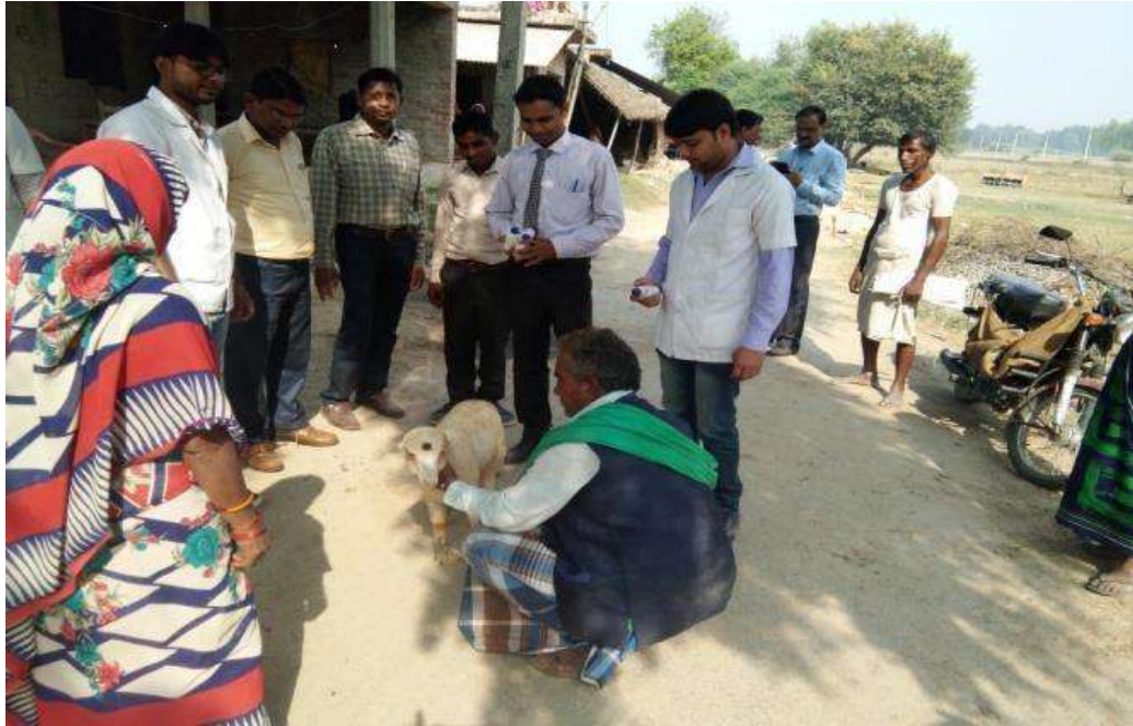
CAPACITY BUILDING OF FARMERS BY STUDENTS ON GOAT HEALTH AT FILED ON DATED 5 MARCH 2019