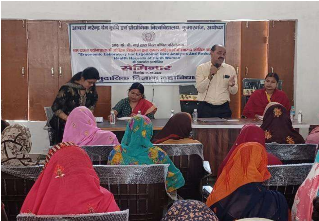
STUDENTS ORGANISED WOMEN HEALTH AWARENESS CAMP FOR BETTER HEALTH PRACTICES IN VILLAGES ON DATED 15 MARCH 2020