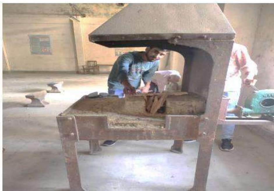
A VIEW OF FURNACE OBSERVED BY STUDENTS ON DATED 3 NOVEMBER 2020