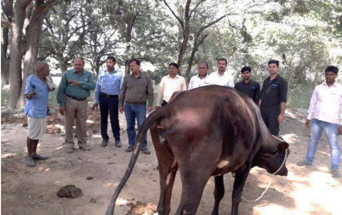
VACCINATION AWARENESS CAMPAIGN AT VILLAGE PURA (SUMERPUR), AKMA FOR FARMERS ON IMPORTANCE OF VACCINATION ON DATED 27 FEBRUARY 2019