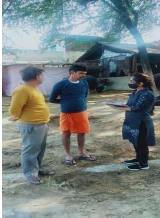
INTERACTION WITH FARMER AT THE TIME OF NURSERY SOWING DURING COVID-19 PERIOD ON DATED 23 FEBRUARY 2021