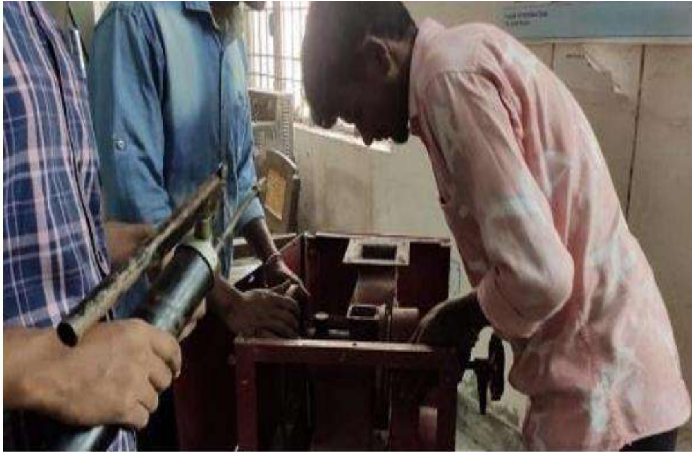
MAINTENANCE OF MILLING MACHINE ON DATED 8 SEPTEMBER 2021