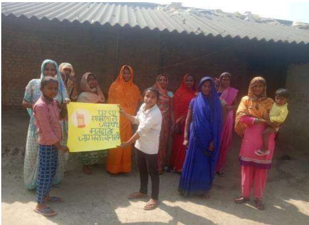
VOTER AWARENESS CAMPAIGN AT NEIGHBOURING VILLAGES OF UNIVERSITY FOR 100% POLLING ON DATED 20 OCTOBER 2020