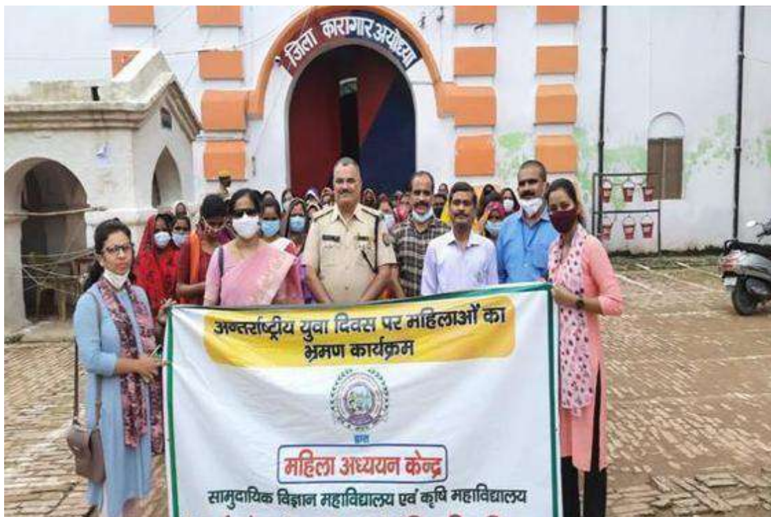
AWARENESS PROGRAMME BY STUDENTS ON INTERNATIONAL YOUTH DAY ON DATED 11 AUGUST 2018