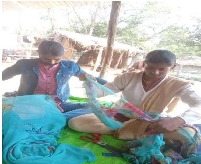
PREPARATION OF USEFUL MATERIAL FROM HOUSEHOLD WASTE ON DATED 18 NOVEMBER 2020

The students of College of Community Science, a constituent unit , demonstrated the preparation of value-added products from waste during the extension programme “Preparation of Best Out of the Waste” conducted in Joriyam village. Recycling helps in processing waste or used products into useful or new products. Students used waste material of household and converted it into useful products.