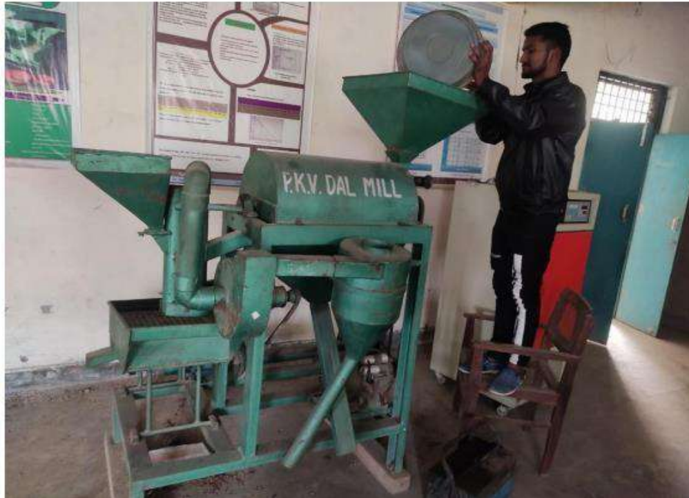
VIEW OF DAL MILL ON DATED 8 OCTOBER 2021