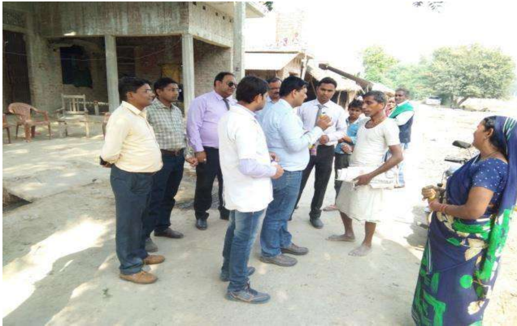
HEALTH CAMP WITH SPECIAL EMPHASIS ON PREVENTION AND CONTROL OF DISEASES OF GOAT ON DATED 5 MARCH 2019