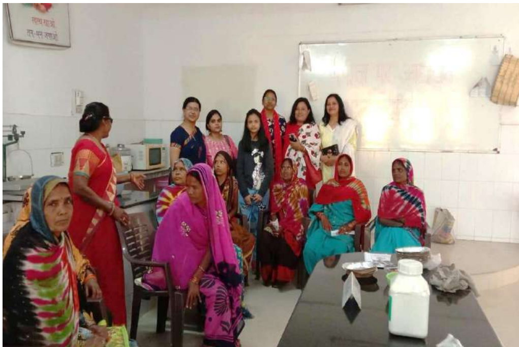
TRAINING PROGRAMME ORGANIZED BY STUDENTS ON AMLA PROCESSING ON DATED 9 FEBRUARY 2022