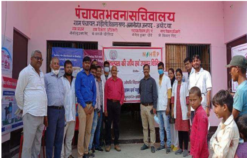
AWARENESS PROGRAMME ON DIFFERENT DISEASES OF LIVESTOCK IN AMANIGANJ, AYODHYA ON DATED 10 MARCH 2022