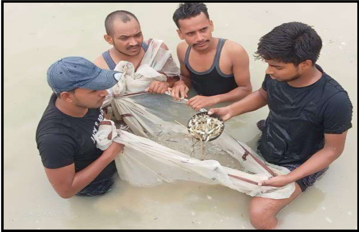
REMOVAL OF WEED FISHES BY MANUAL METHOD ON DATED 26 JULY 2019