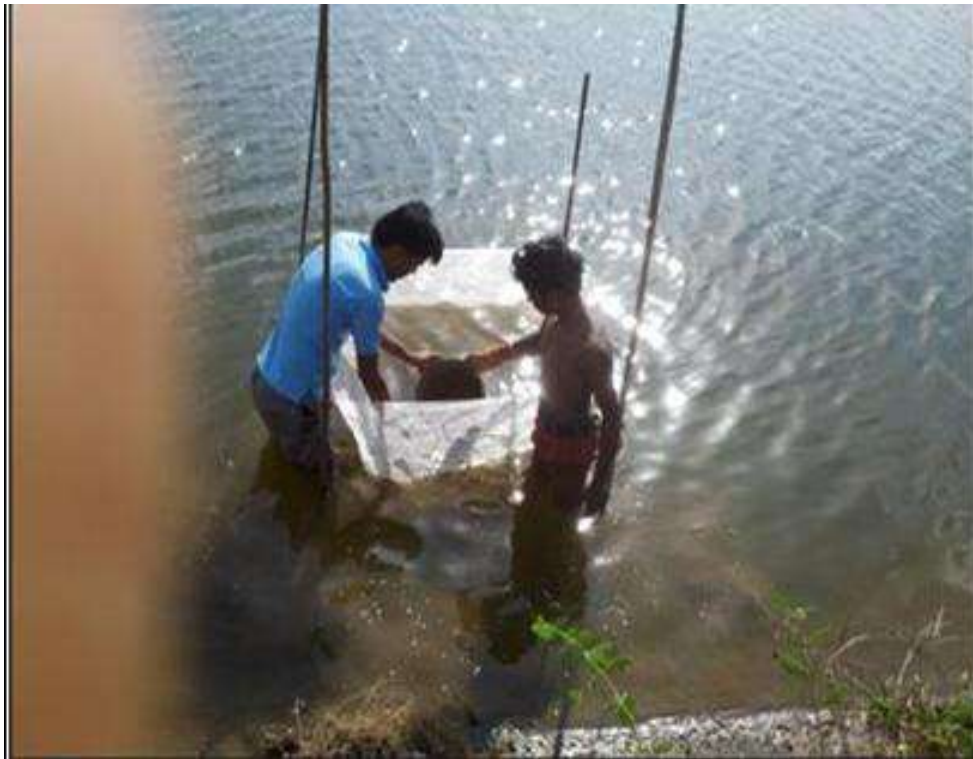
ACCLIMATIZATION OF SEEDS BY STUDENTS ON DATED 16 MARCH 2018