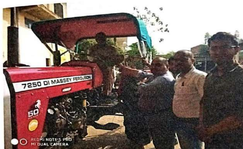
HANDOVER NEW TRACTOR TO FARMERS ON DATED 18 AUGUST 2017