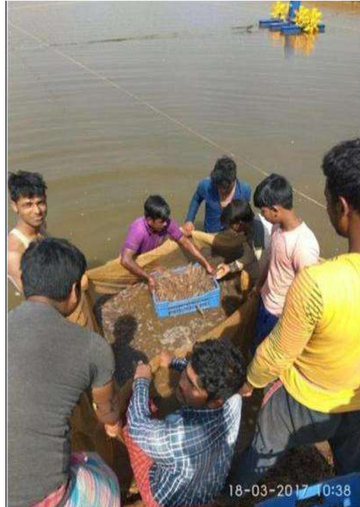
HARVESTING OF SHRIMP ON DATED 18 JUNE 2018