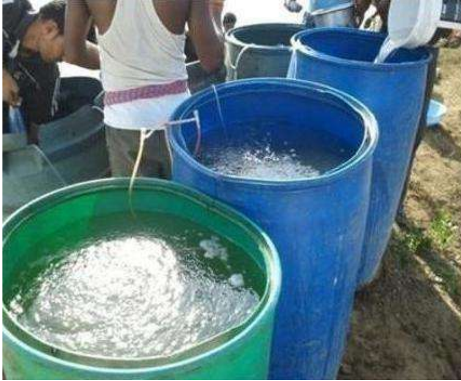
CHECKING OF SURVIVAL RATE IN HAPA 16 FEBRUARY 2018