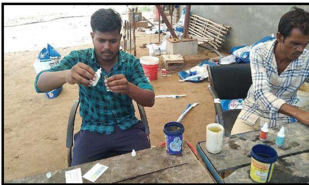
MONITORING OF pH LEVEL OF THE POND WATER BY STUDENTS AT FIELD ON DATED 28 SEPTEMBER 2021