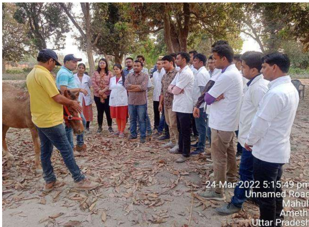
INTERACTION ON EQUINE HANDLING AND RESTRAINING BY THE STUDENTS AT FIELD ON DATED 24 MARCH 2022