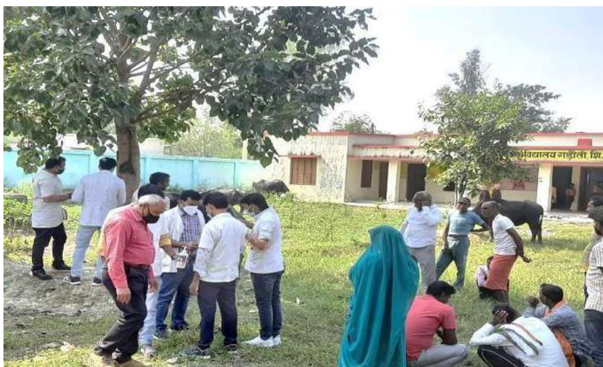
INTERACTION OF EXPERTS ON KETOSIS & ANEMIA DISEASE IN SURROUNDING VILLAGES ON DATED 30 OCTOBER 2021