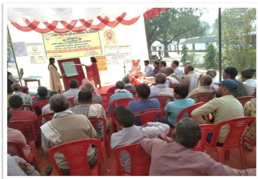
KISAN GOSTHI TO AWARE FARMERS ON PROGRESSIVE FARMING AT VILLAGE LALKAPURVA, AMANIGANJ BLOCK OF AYODHYA DISTRICT ON DATED 23 MARCH 2022