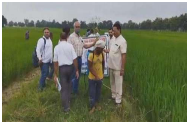
DEMONSTRATION OF WEEDICIDE APPLICATION AT FARMER FIELD ON DATED 15 SEPTEMBER 2017

In year 2017-18, Agricultural extension activities of the College of Agriculture (A constituent unit) were conducted by 119 students who were divided in 21 groups. Students went to villages groupwise namely Soraon, Aatanagar, Raincha, Mukundpur, Meghmau, Rampur Babuan, Haliapur, Jarai, Taudhikpur, Saraibaggha, Bhawanigarh, Deeh, Tirhut, Kankarkola, Dehariyanva, Umara, Kaanpa, Gauraprani, Peepari, Tiwaripur and Dobhyara of Sultanpur District respectively and made farmers aware about scientific cultivation and recent technologies in agriculture. Students made farmers aware about scientific manner of cultivation of crops i.e., maize, paddy, pigeonpea, urdbean, mungbean etc. They also told farmers about seed rate, scientific method of nursery raising, fertilizer weed, water and nutrient management. They also gave information to farmers regarding mushroom production technology, insect pest management and storage technology. They encouraged farmers to use the bio-agent. Students created awareness among farmers about use of certified seeds, kharif seed- production, animal health, Jeevamrit, Beejamrit in natural farming and insurance of crops. Students also made them aware about education and malnutrition. Students made farmers aware about use of exact quantity of insecticides and pesticides for protection of crops when crop field got infected more than 5 percent by insects.