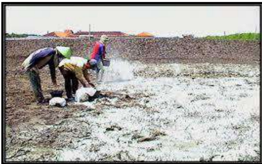
LIMING OF POND FOR RECLAMATION ON DATED 28 SEPTEMBER 2021

The in-Plant attachment programme of the students of College of Fisheries Science on aqua farming was scheduled at Village-Roohrianwali, Teh/Dist. Shri Muktsar Sahib, a site of Punjab Royal Health Food Pvt. Ltd. A group of students were recruited on 28/09/2021. They interact with the small, marginal farmers and aqua-preneurer. They also become aware of farmers' problems and provide the solution to fulfill the technological gap regarding management practices.