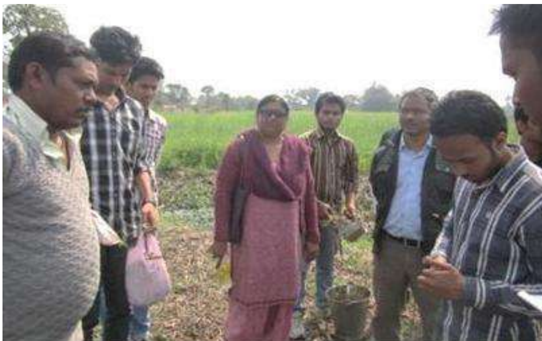
AWARENESS PROGRAMME ON REMOVAL OF AQUATIC WEED AT ATANAGAR, GOVINDPUR ON DATED 23 NOVEMBER 2018