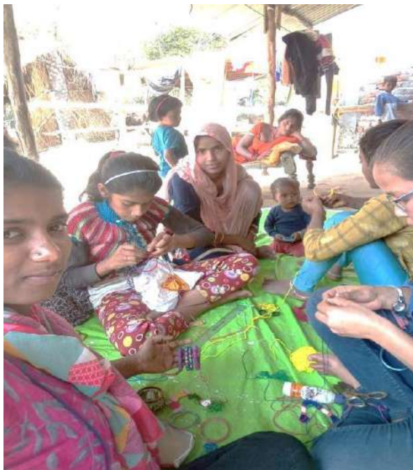
BEST OUT OF WASTE ACTIVITIES DONE BY STUDENTS AND VILLAGE WOMEN ON DATED 18 MAY 2021

During the extension programme conducted in 2021-22, Students of College of Community Science performed various activities with village women to help them learn new skill and recycling waste products. Recycling helps in processing waste or used products into useful or new products. Students used unused household items and converted it into useful products. There are a number of items that can be renewed. For e.g. saree, bangles, etc.