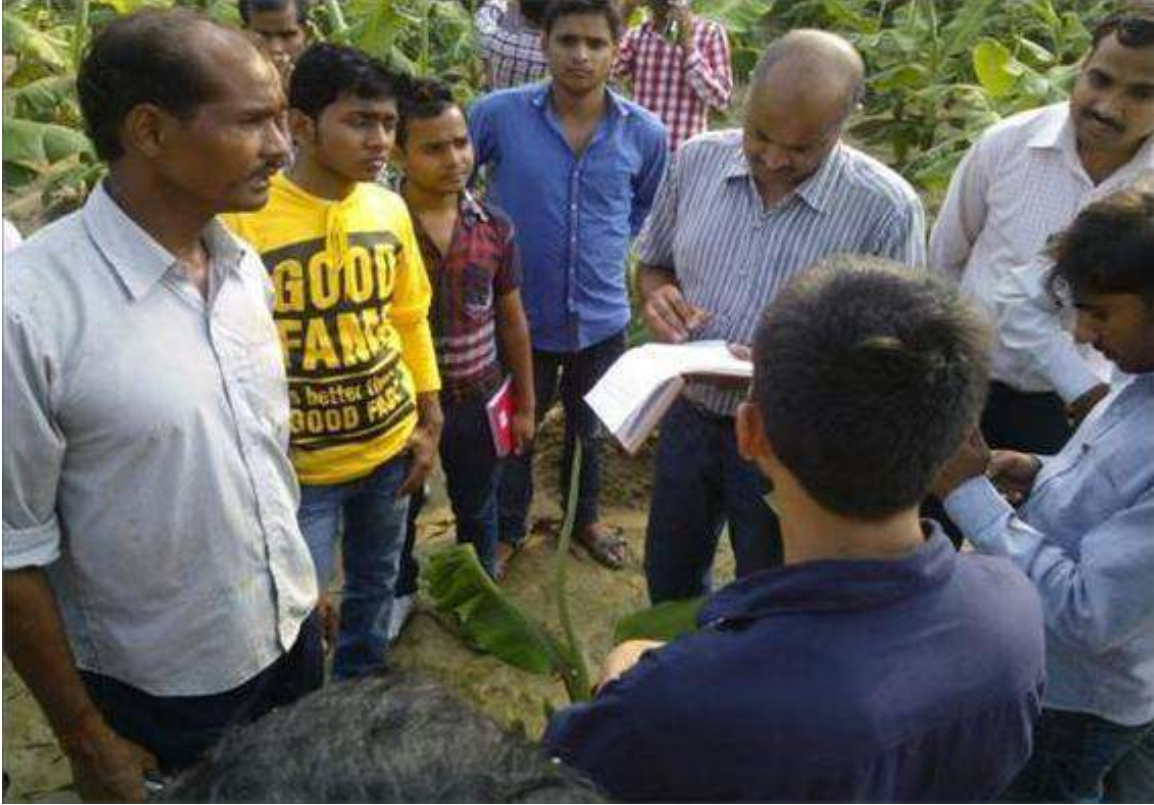
FARMERS CAPACITY BUILDING PROGRAMME ORGANIZED BY STUDENTS IN NEARBY VILLAGES ON DATED 10 NOVEMBER 2018