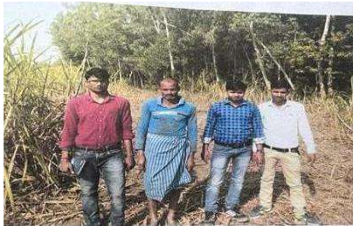
STUDENTS INTERACTED WITH FARMERS ON PROGRESSIVE FARMING OF SUGARCANE CROP ON DATED 11 OCTOBER 2019