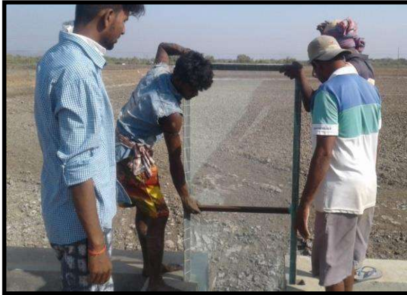
PACKING OF THE SLUICE GATES ON DATED 22 FEBRURY 2019

College of Fisheries Science (A constituent unit) conducted in Plant Training Programme of Aqua farming at Pancham Aquaculture Farm. The B.F.Sc 4 th year students under the In Plant Training Programme of aquaculture department on 22/02/2019 were recruited to the Farm PANCHAM AQUACULTURE FARMS Pvt. Ltd. Jalsar and Vedhi Tal. Palghar Dist. where semi intensive & Extensive culture of Litopenaeus vannamei were practiced and skilled.