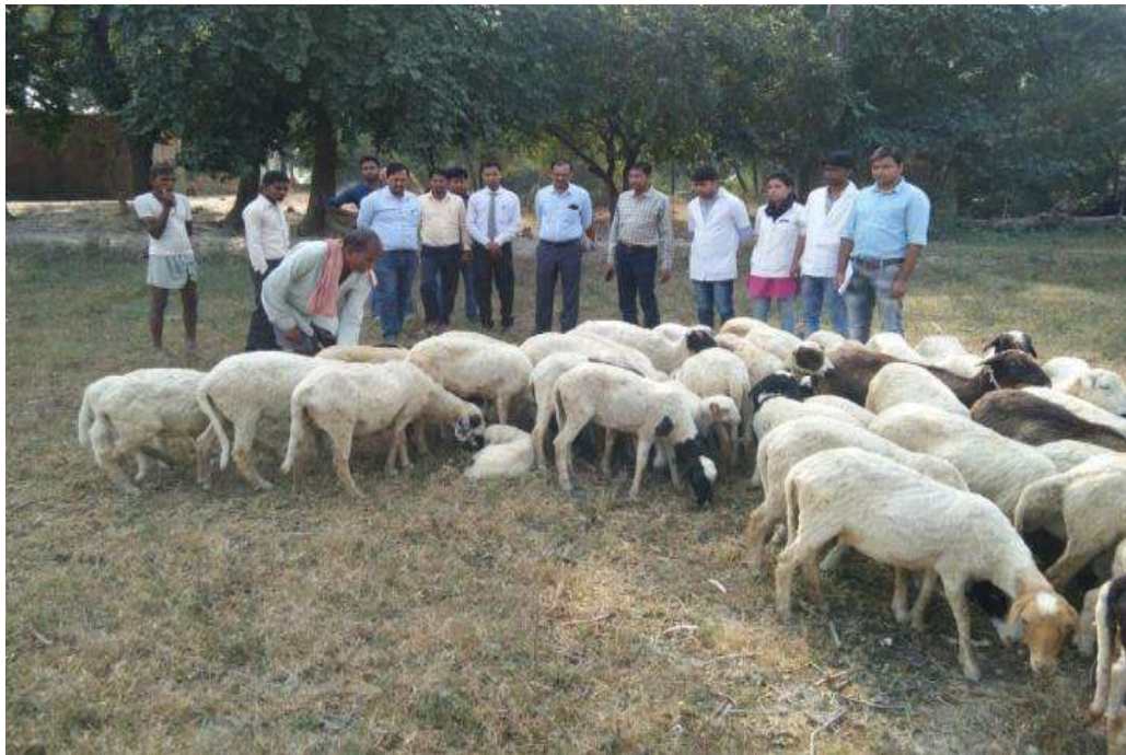
HEALTH CAMP WITH SPECIAL EMPHASIS ON PREVENTION AND CONTROL OF DISEASES OF GOAT ON DATED 5 MARCH 2019