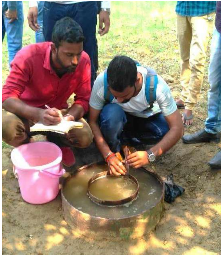
DEMONSTRATION OF DOUBLE RING INFILTROMETER AT FIELD ON DATED 6 FEBRUARY 2018