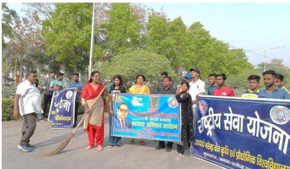
CLEANLINESS DRIVE BY THE NSS VOLUNTEERS ON DATED 23 FEBRUARY 2021

NSS programme was also organized by College of Community Science, this activities impart comprehensive knowledge on youth development activities, team building, leadership, development issues, disaster management, village adoption. All the I year students participated in this event one of the important service that can be rendered by NSS volunteers is disseminating, watershed management, wasteland development, non-conventional energy, low cost housing, sanitation, nutrition and personal hygiene, schemes for skill development, income generation, government schemes such as Swachh Bharat, Ayushman Bharat, Beti Bachao and Beti Padhao.