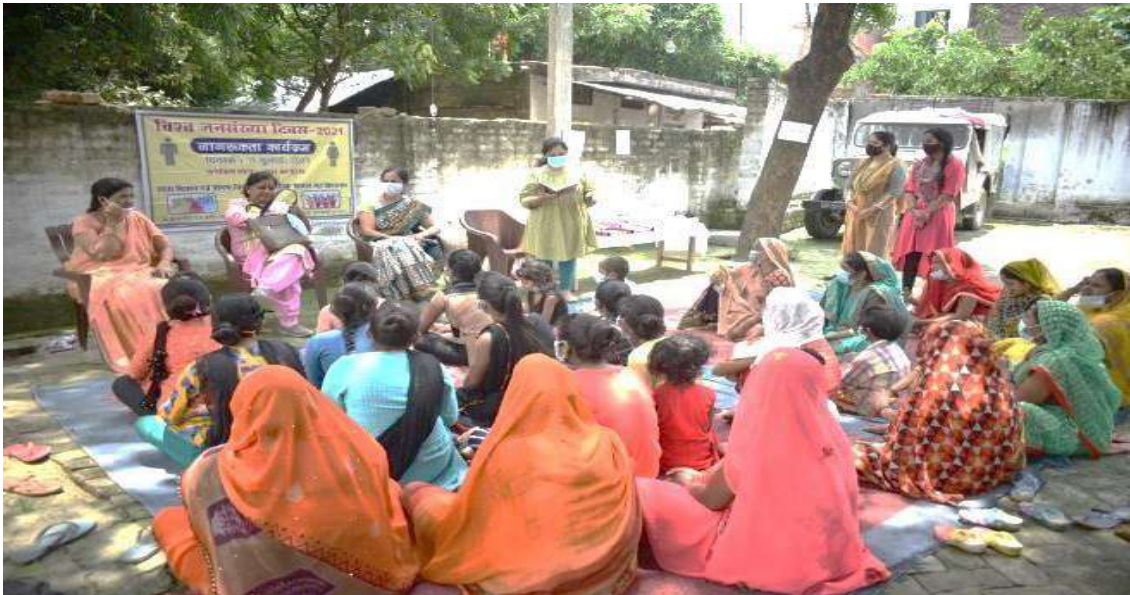
INTERACTION WITH VILLAGERS ON WORLD POPULATION DAY (11 JULY 2022)

World Population Day was celebrated by Department of Food Science and Nutrition in the village Lal ka purwa. Students delivered lectures to adolescent girls and rural women. Nutritious recipe competition for rural adolescent girls was held and discussions were done on breast and cervical cancers, institutional deliveries and immunization among children, malnutrition among women and children and its management.