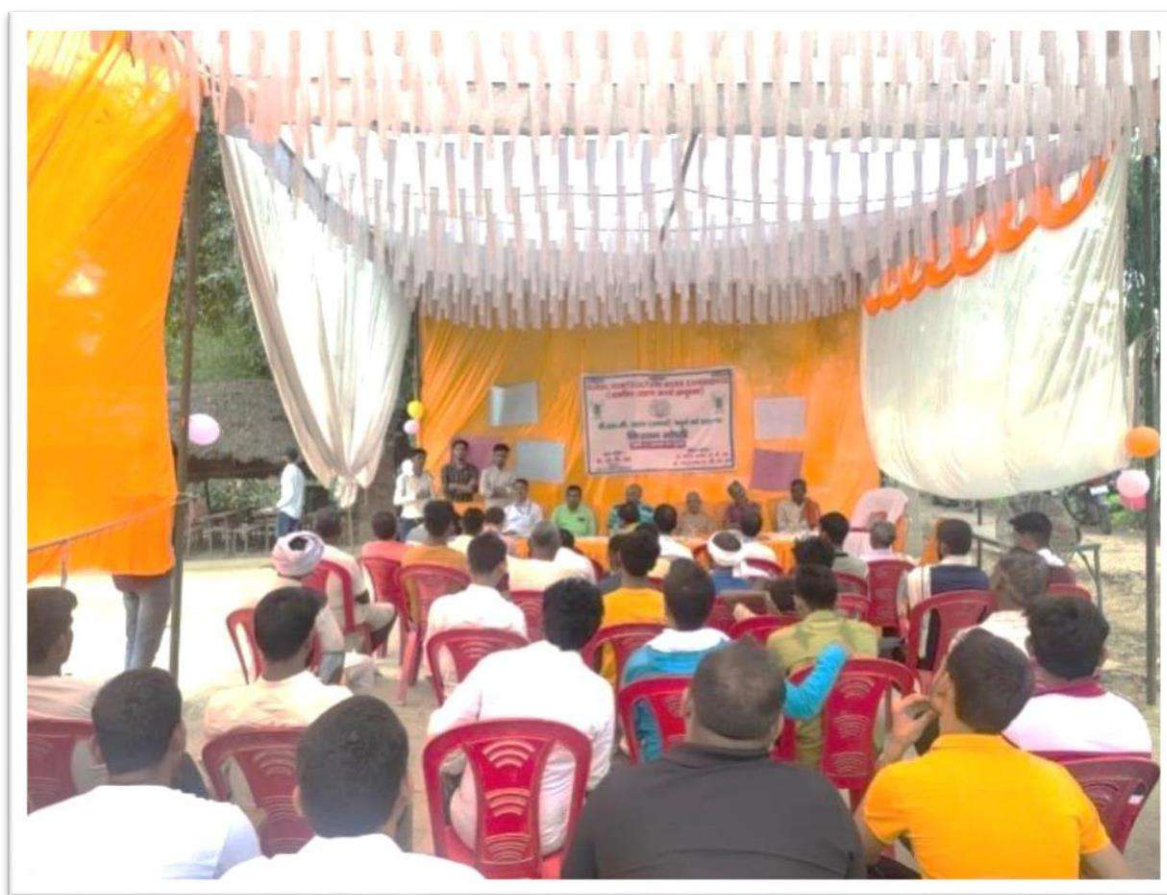
KISAN GOSTHI ON SCIENTIFIC CULTIVATION OF VEGETABLES & PLANT PROTECTION IN NEARBY VILLAGES ON DATED 23 AUGUST 2022

Rural area work experience on horticultural crop was successfully completed by the B.Sc. (Horticulture) fourth year students of College of Horticulture & Forestry in the village of Pragas ka Purva and other neighbouring villages of Milkipur block for learning and capacity building/ training of farmers under the guidance of coordinator and teachers. During this session, students were engaged in different different activities to reach the maximum small & marginal farmers and trained on scientific cultivation of vegetables crops (Brinjal, Tomato, Okra, Pointed gourd, Cucurbits, etc.), fruit crops (Banana, Mango, Aonla, Jack fruit, Bael) by the kisan gosthi/ field visit. With the help of expert/ teachers students had arranged the practical demonstration for farmers on value added products like, Aonla pickles & candy, Mango pickles beverages, Bael beverages and strawberry juice to enhance their income and encouraged them to cultivate the horticultural crops on commercial scale as agri-entrepreneur. In addition to that, students were also arranged camp/kisan gosthi for seed distribution, fertilizer distribution, seedling distribution etc.in surrounding areas of the Adodhya districts under the umbrella event of "Azadi ka Amrit Mahotsav". Capacity building and awareness programme was also provided by students in the nearby villages with enthusiasm and shared information on new government scheme, voter rights and responsibilities etc. in the presence of mentor.