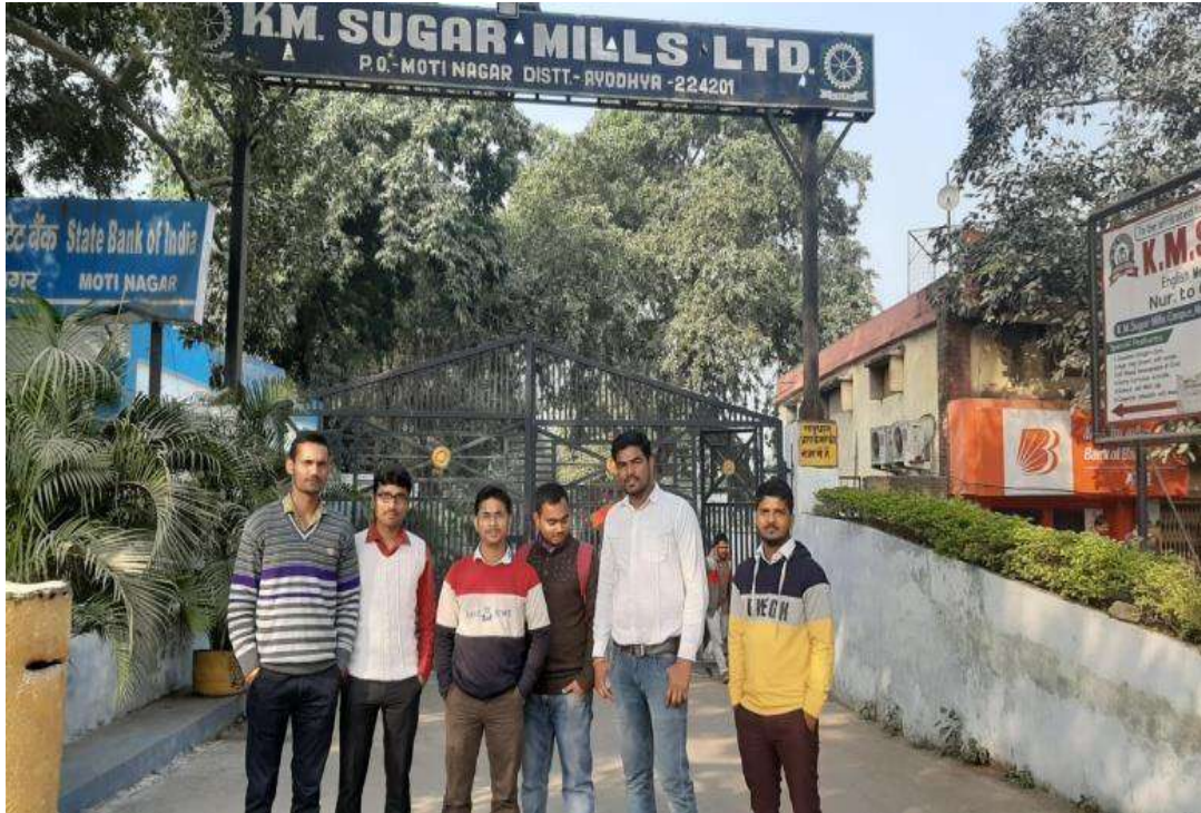
STUDENTS VISITED AT SUGAR MILLS FOR REMEDIAL KNOWLEDGE ON VALUE ADDITION ON DATED 3 JANUARY 2020