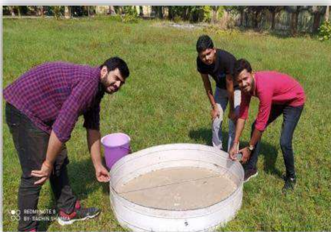
A VIEW OF PAN EVAPORIMETER ON DATED 27 JANUARY 2022