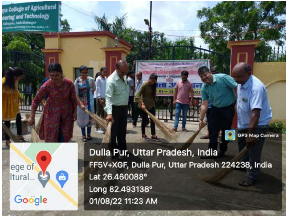
SWACHCHH BHARAT ABHIYAN