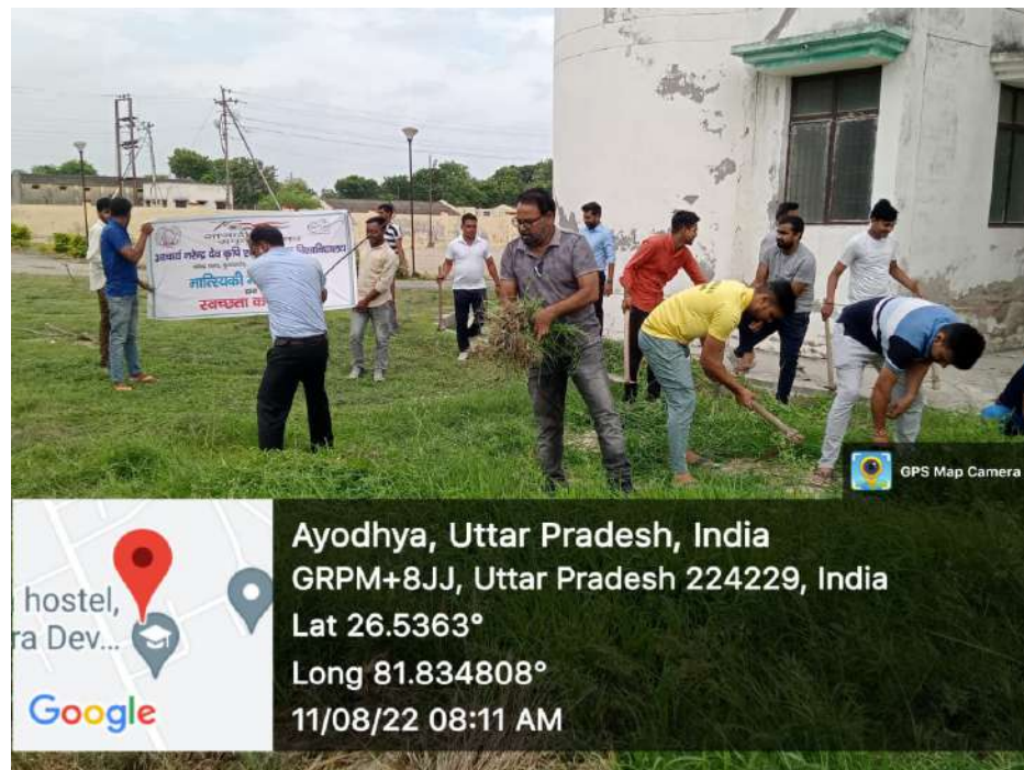
SWACHCHH BHARAT ABHIYAN