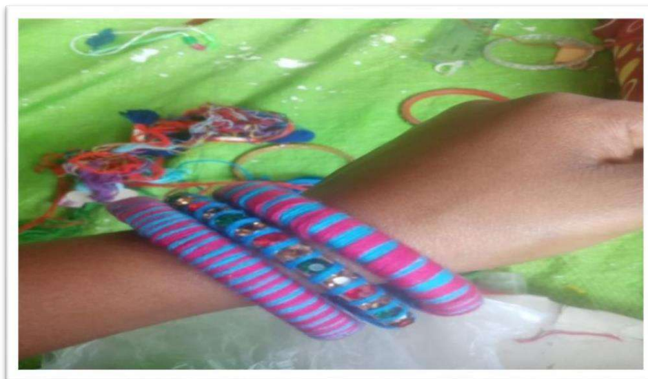
BANGLES PREPARED BY STUDENTS FROM HOUSEHOLD WASTE ON DATED 18 NOVEMBER 2020

NSS programme was also organized by College of Community Science, this activities impart comprehensive knowledge on youth development activities, team building, leadership, development issues, disaster management, village adoption. All the I year students participated in this event one of the important service that can be rendered by NSS volunteers is disseminating, watershed management, wasteland development, non-conventional energy, low cost housing, sanitation, nutrition and personal hygiene, schemes for skill development, income generation, government schemes such as Swachh Bharat, Ayushman Bharat, Beti Bachao and Beti Padhao.