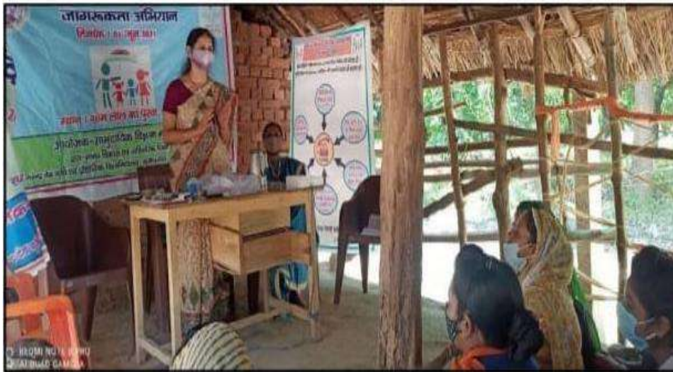
AWARENESS ON PROHIBITION OF CHILD LABOUR DAY IN NEIGHBOURING VILLAGES ON DATED 14 JULY 2022

Students of Department of Human Development and Family Studies conducted awareness programme on Prohibition of Child Labour Day in Lal ka Purwa village, Ayodhya to aware women and adolescents on child labour acts and policies related to child education, child safety etc.