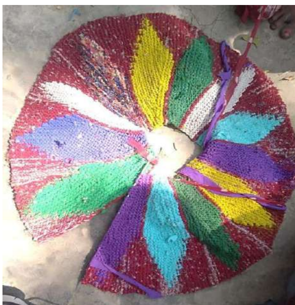
BEST OUT OF WASTE PRODUCT FABRICATED BY STUDENTS AND VILLAGE WOMEN ON DATED 18 MAY 2021