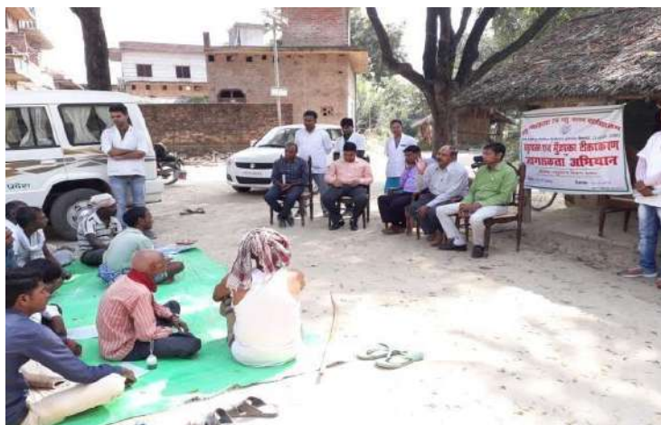
VACCINATION AWARENESS CAMPAIGN AT VILLAGE PURA (SUMERPUR), AKMA FOR FARMERS ON IMPORTANCE OF VACCINATION ON DATED 11 OCTOBER 2018