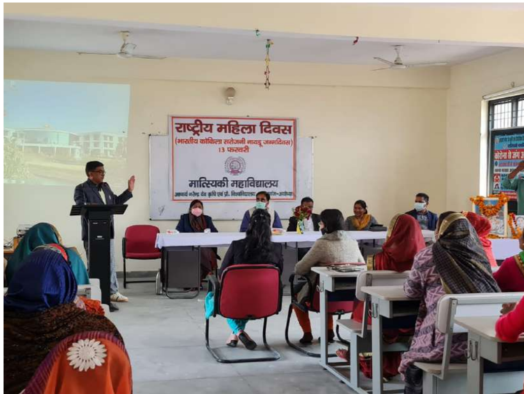
The students of the university are creating awareness among the community about the gender issues.