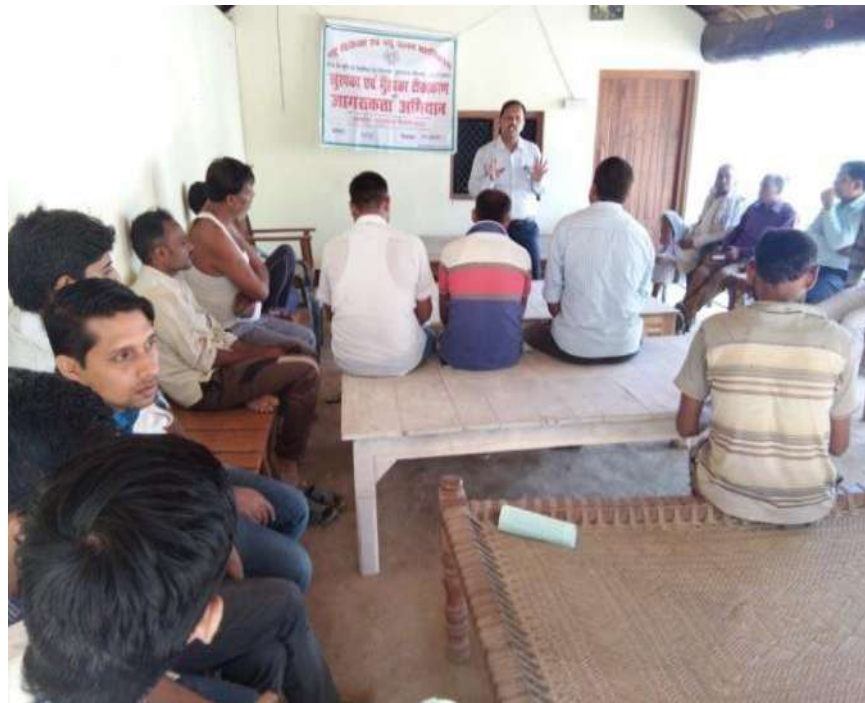
VACCINATION AWARENESS CAMPAIGN AT VILLAGE MEWAPUR FOR FARMERS ON IMPORTANCE OF VACCINATION ON DATED 23 FEBRUARY 2019