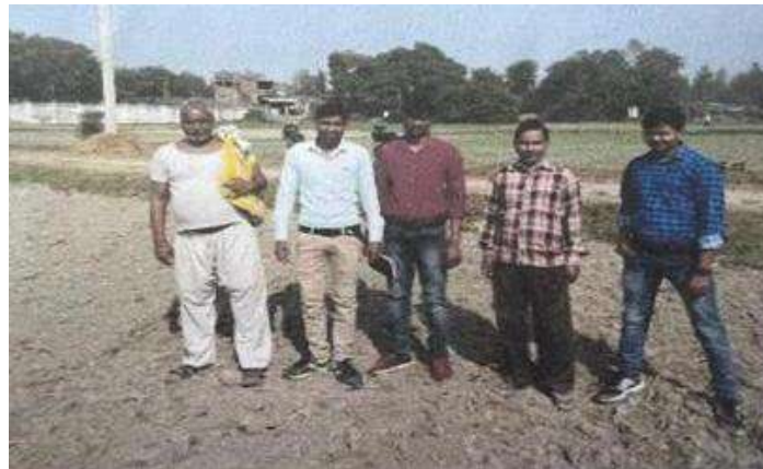
SOWING OF WHEAT ON FARMER'S FIELD ON DATED 11 OCTOBER 2019