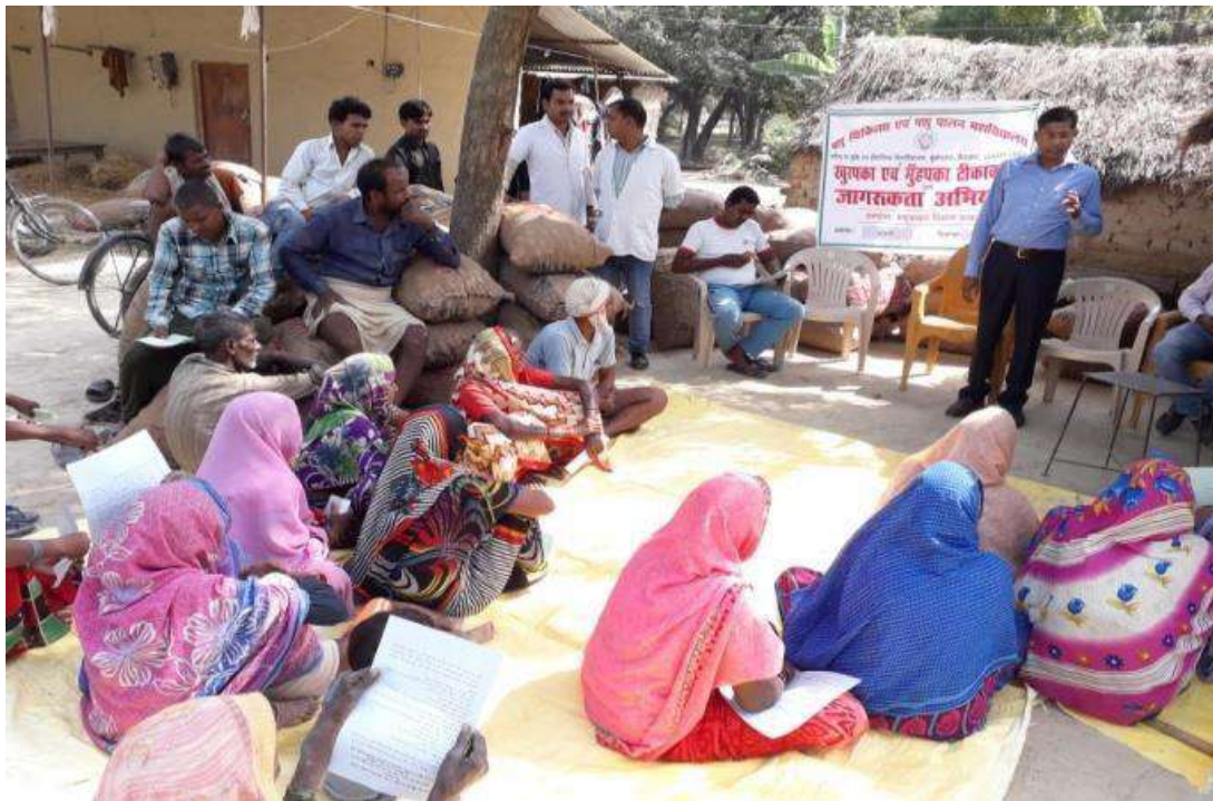
VACCINATION AWARENESS CAMPAIGN AT VILLAGE MEWAPUR FOR FARMERS ON IMPORTANCE OF VACCINATION ON DATED 5 MARCH 2019