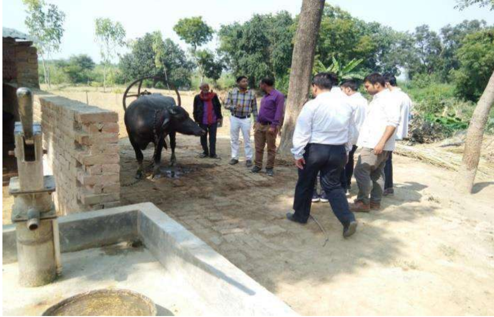
VACCINATION AWARENESS CAMPAIGN AT VILLAGE MEWAPUR FOR FARMERS ON IMPORTANCE OF VACCINATION ON DATED 5 MARCH 2019