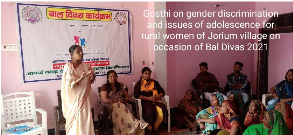
Gosthi on gender discrimination and issues of adolescence for rural women of Jorium village on occasion of Bal Divas 2021