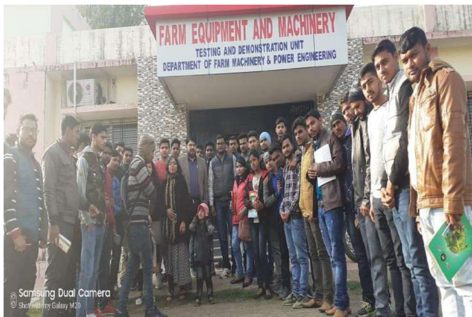
VIEW OF FARM EQUIPMENT AND TESTING LABORATORY ON DATED 14 JANUARY 2019