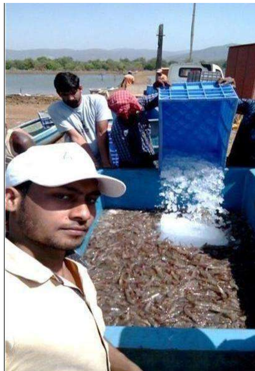
ICING OF HARVESTED SHRIMP FOR MAINTAINING QUALITY ON DATED 18 JUNE 2018