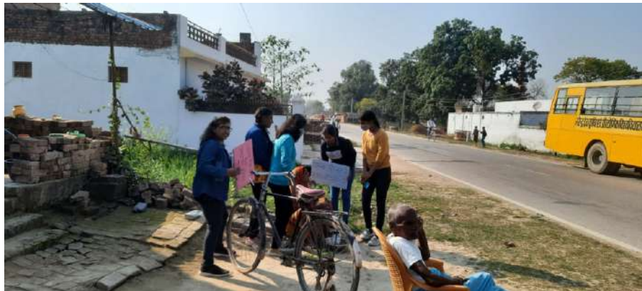
Matdata Jagrukta Abhiyan (Voter Awareness)