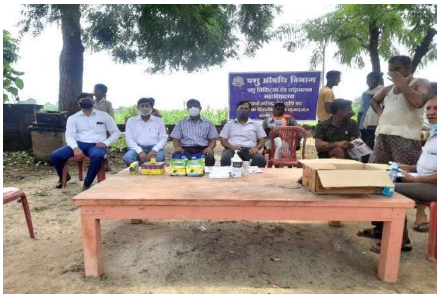
KETOSIS & ANEMIA DISEASE DIAGNOSIS CAMP IN SURROUNDING VILLAGES BY EXPERT ON DATED 30 OCTOBER 2021