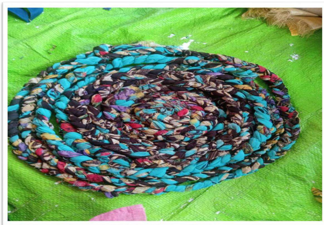
MAT PREPARED BY STUDENTS FROM HOUSEHOLD WASTE