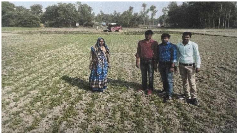
AWARENESS PROGRAMME ON SCIENTIFIC CULTIVATION OF VEGETABLE CROPS ON DATED 11 OCTOBER 2019