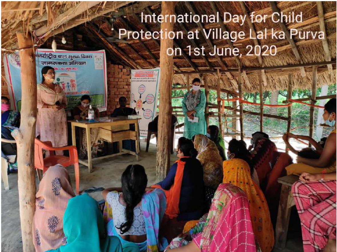
International Day for Child Protection at Village Lal ka Purva on 1st June, 2020