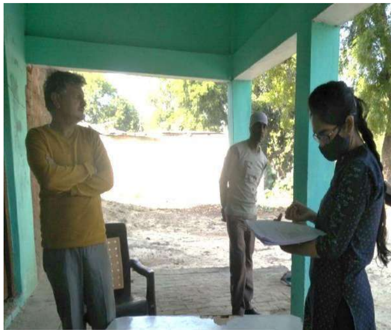
INTERACTION WITH FARMER AT THE TIME OF NURSERY SOWING DURING COVID-19 PERIOD ON DATED 23 FEBRUARY 2021