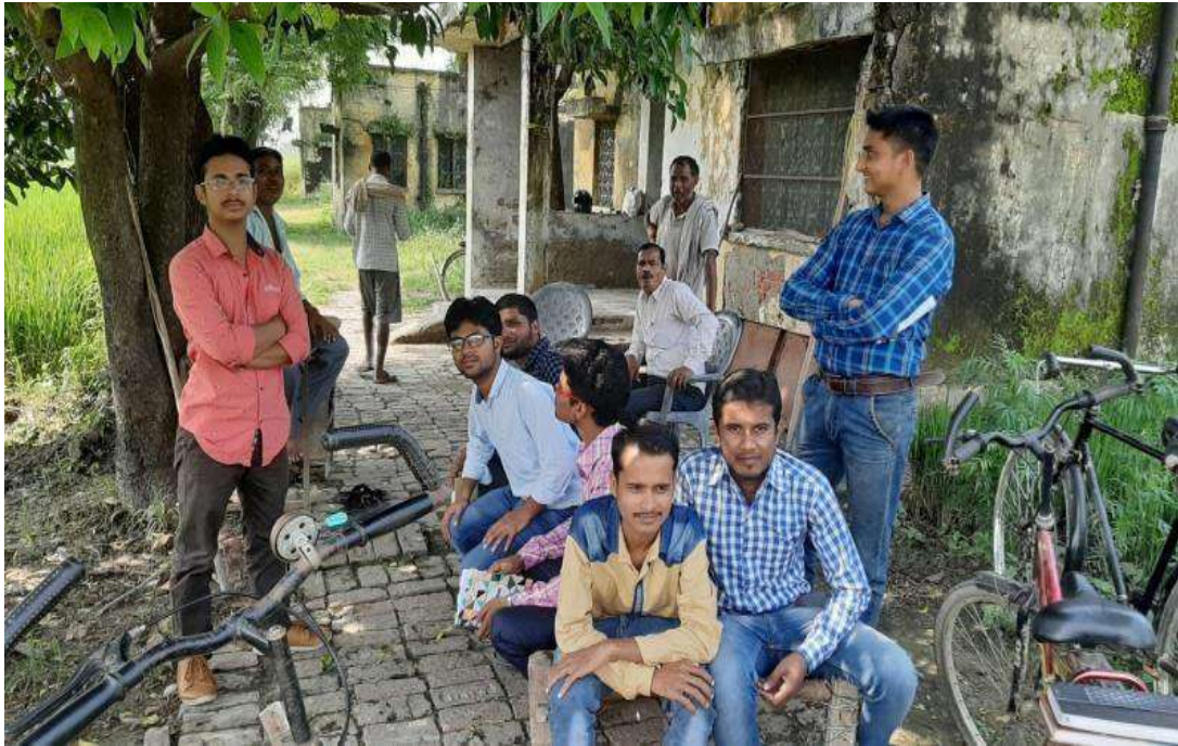
STUDENTS VISIT AT NEIGHBOURING VILLAGE TO AWARE ON POST-HARVEST MANAGEMENT 16 OCTOBER 2019