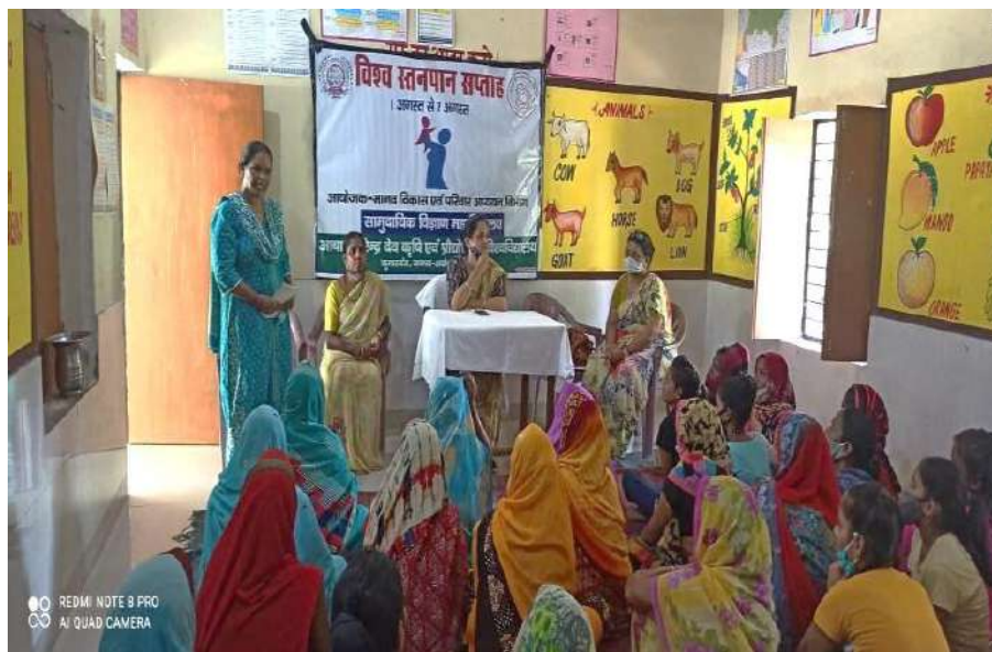
AWARENESS PROGRAMME ON WORLD BREAST FEEDING WEEK AT 5 AUGUST 2022

World Breast Feeding week (1-7 August) was organized at gram Sidhauna , block Milkipur by the students of Department of Human Development and Family Studies. Importance of breast feeding, health issues and diet related for lactating mothers etc. were discussed. Online poster competition on importance of Breast Feeding was also organized for college students.