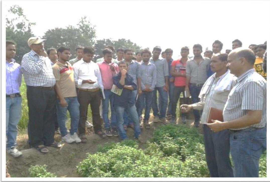
DEMONSTRATION ON SCIENTIFIC CULTIVATION OF VEGETABLES & PLANT PROTECTION IN NEARBY VILLAGES ON DATED 11 AUGUST 2021