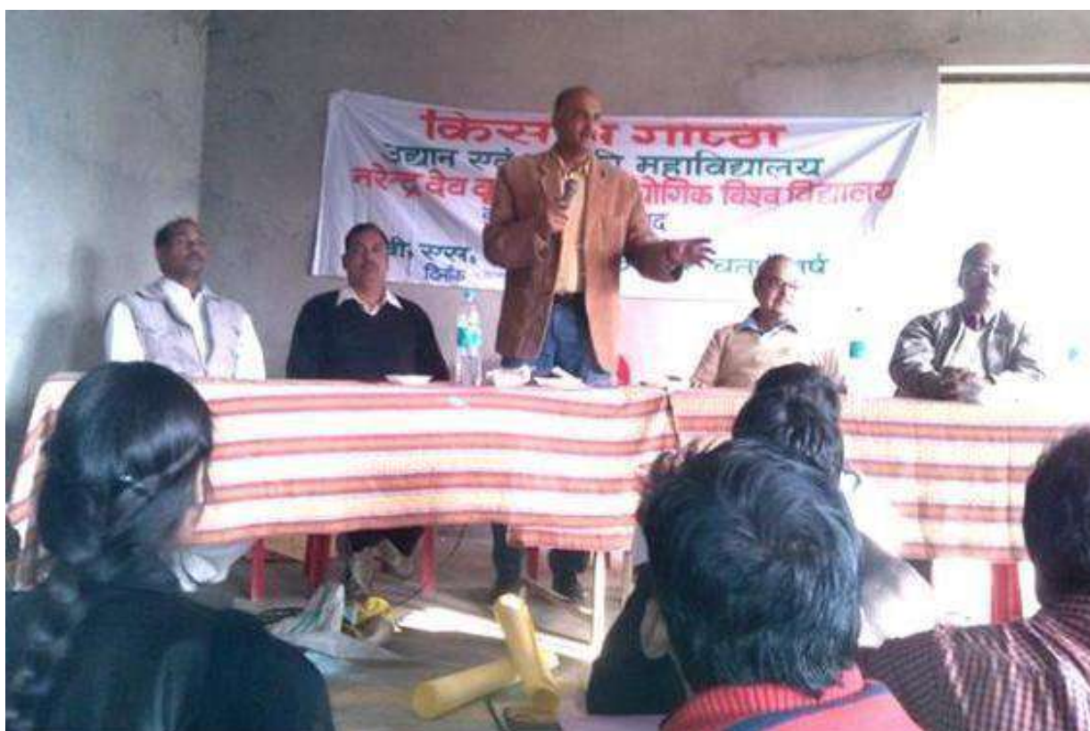
KISAN GOSHTI ORGANIZED BY STUDENTS UNDER EXPERT GUIDANCE AT NEARBY VILLAGES ON DATED 13 JANUARY 2017

Students of B.Sc.(Hons.) College of Horticulture & Forestry (A constituent unit) were involved in extension of commercial Horticulture and processing of fruits and vegetables in the neighbouring nursery and native villages/ town. The extension programme was undertaken as nursery management of fruits, vegetables and flowers concerning their raising technique, management and marketing through value addition. Under students extension programme, students were conducted different activities on practical processing technology of various seasonal fruits and vegetables on farmers field. In addition to that, farmers of neighbouring districts were trained on processing of various products like jam, jelly, murabba, candies, pickles, squash, syrup, RTS etc. During the Covid period, Students were made their herculean efforts to reach the maximum farmers to get benefited by new technology/capacity building in the native village/ block. Students had actively engaged in different different extension activities throughout the year for capacity building with demonstration & Kisan goshti.