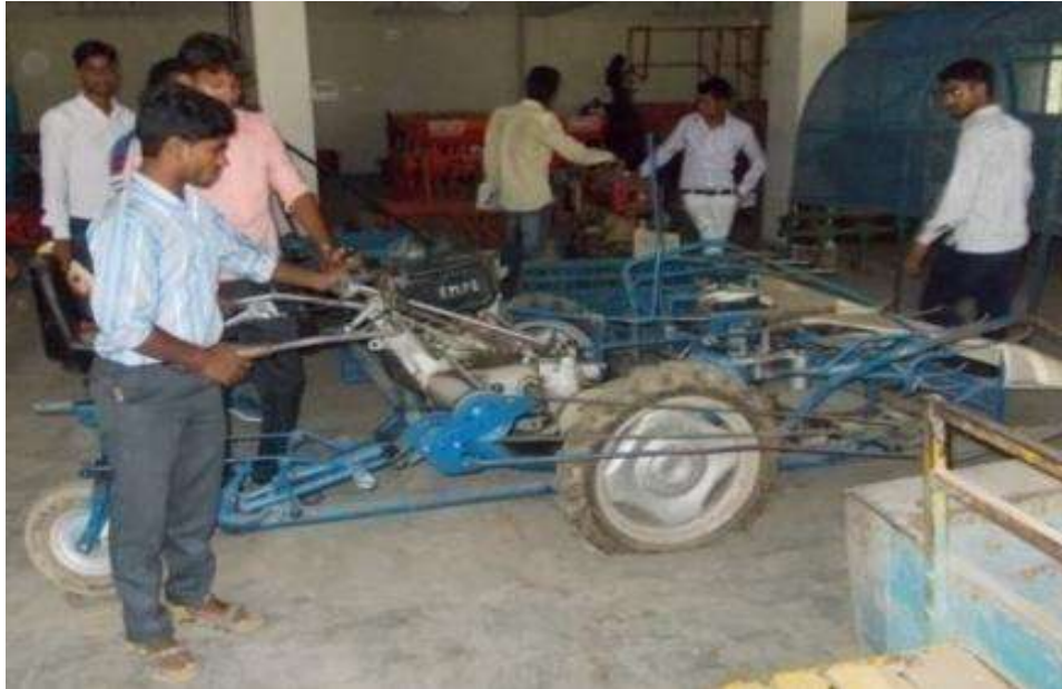
DEMONSTATION OF OPERATING OF TILLER EQUIPMENTS ON DATED 8 SEPTEMBER 2019