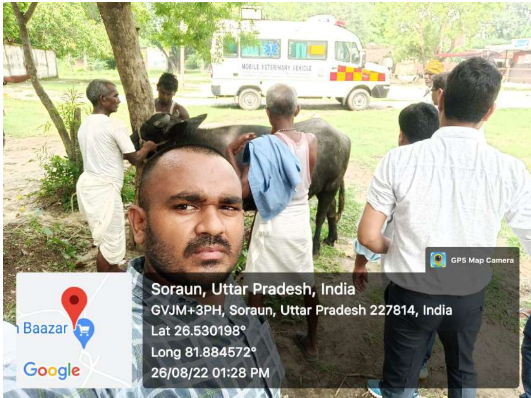
Animal health camp